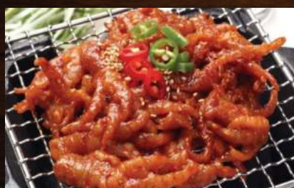
Spicy Boneless Chicken Feet