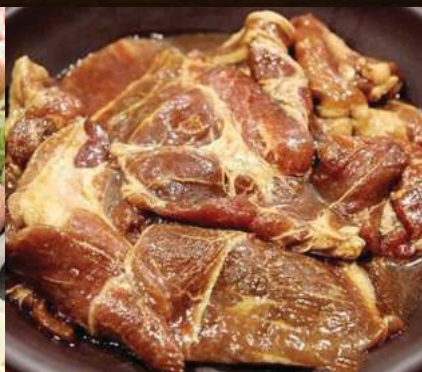
Marinated Pork Collar 양념목살