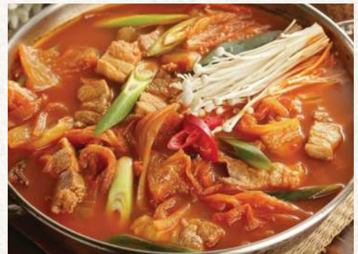
Kimchi & Pork Stew 🌶️