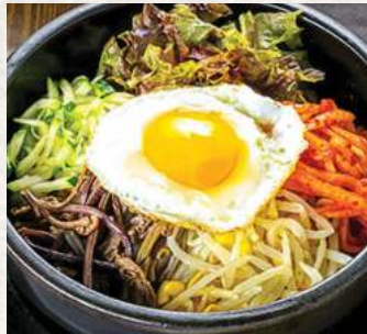
Bibimbap in Hot Stone 돌솥비빔밥 $18.8