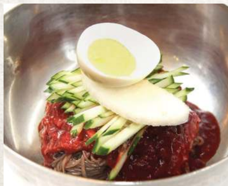
Spicy Cold Noodle (Dry)