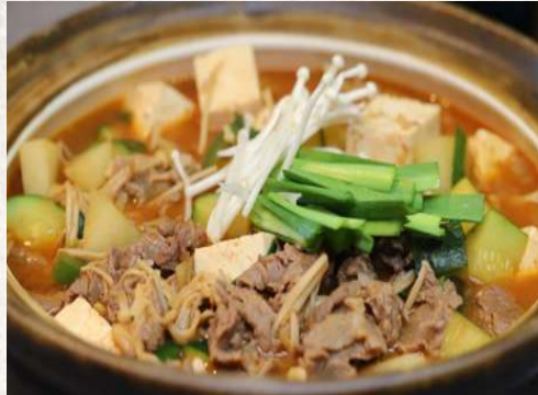
Soybean Paste Stew with Beef Brisket