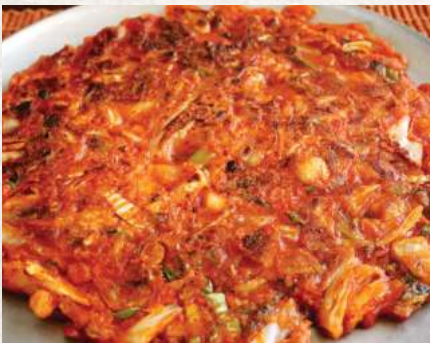
Kimchi Pancake 김치전 $24