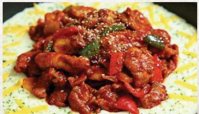
Spicy Chicken with Cheese