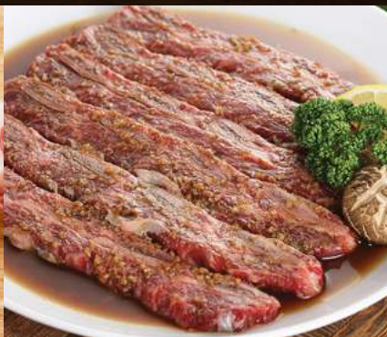
Marinated Beef Rib 양념 갈비