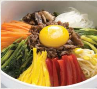
Bibimbap 비빔밥 $16.8