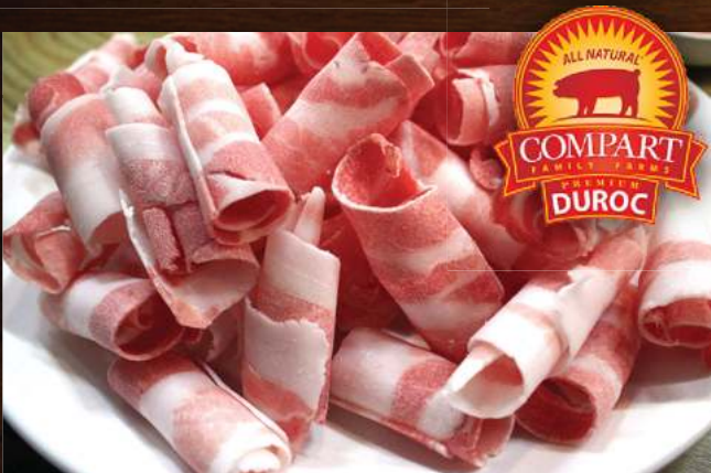
Thinly Sliced Pork Belly