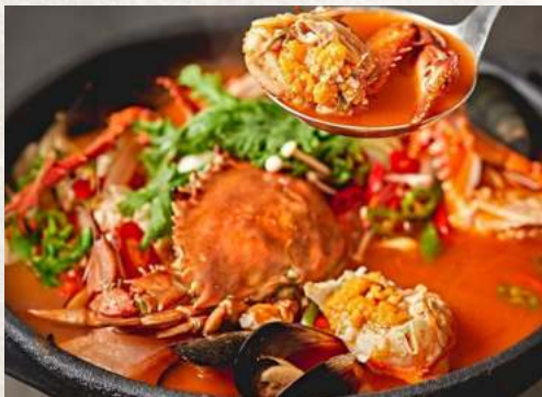
Spicy Blue Crab Stew 🌶️