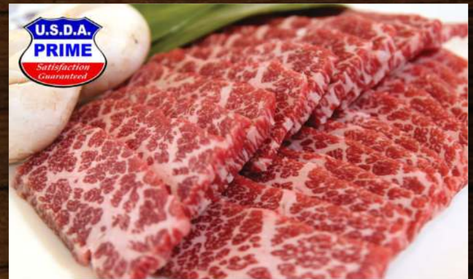
Boneless Beef Short Rib