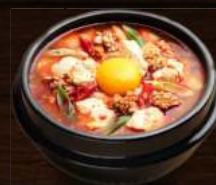
Choice of 1 Soup

Seafood / Kimchi / Chives 해물파전 / 김치전 / 부추전