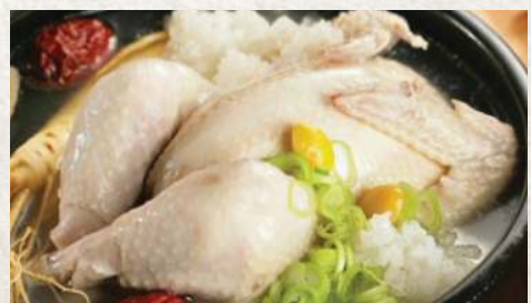
Ginseng Chicken Soup 삼계탕 $24.8

*Images depicted in the menu are for reference only.