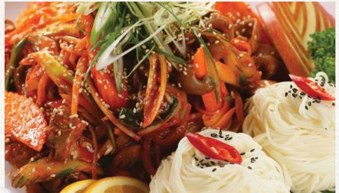
Spicy Whelk Salad with Noodle