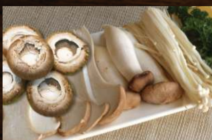
Assorted Mushroom Set