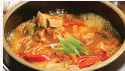
Kimchi Soup 김치찌개 $15.8