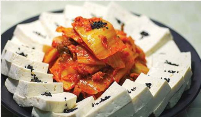
Tofu with Pork & Kimchi