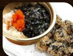
Riceballs with Flying Fish Roe 날치알주먹밥