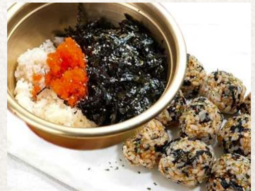
Riceballs with Flying Fish Roe 날치알주먹밥 $10