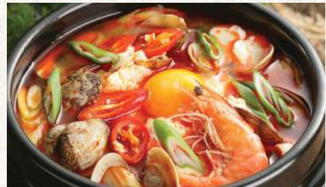
Seafood Tofu Soup 해물순두부찌개 $18.8