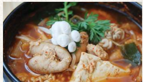
Spicy Fish Roe Soup 알탕 $28