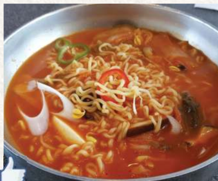
Seafood Spicy Ramyun