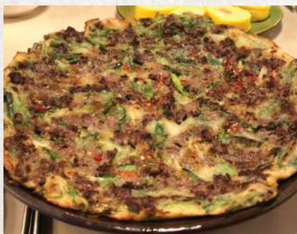
Beef Bulgogi Pancake 불고기파전 $28