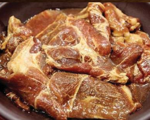
Marinated Pork Collar