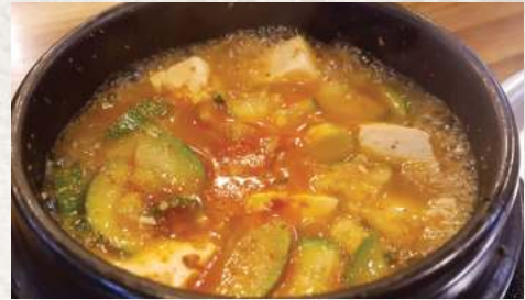
Bean Paste Soup 된장찌개 $15.8