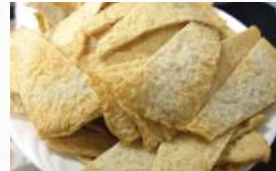
Fish Cake 오뎅사리 $3