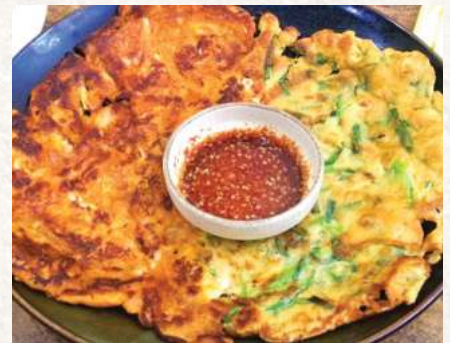
Half & Half Pancake 특 반반전 $28.8