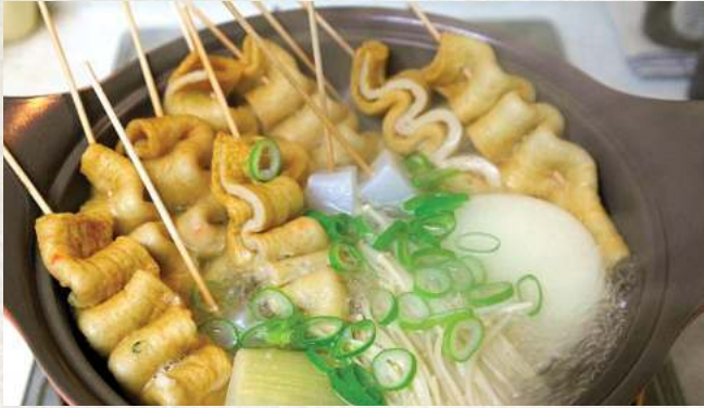
Fish Cake Soup