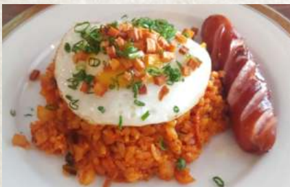
Kimchi Fried Rice 김치볶음밥 $16.8