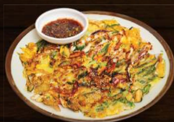
Choice of 1 Pancake

Seafood / Kimchi / Chives 해물파전 / 김치전 / 부추전