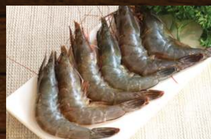
Prawns (6 pcs)