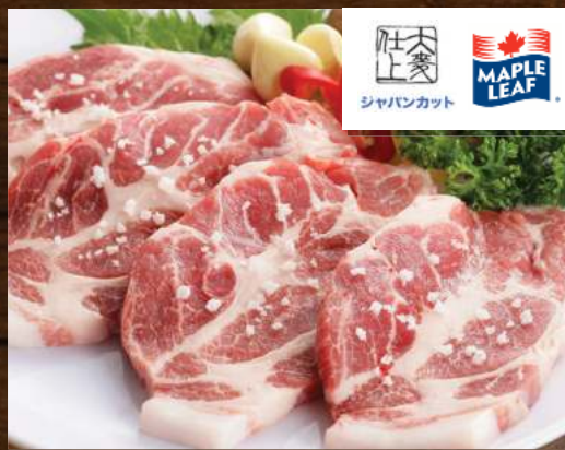
Fresh Pork Collar