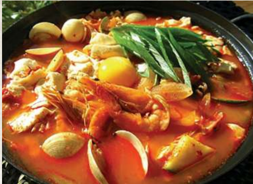
Seafood Soft Tofu Stew 🌶️