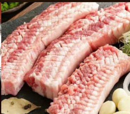
X-Cut Thick Pork Belly 벌집 생삼겹살