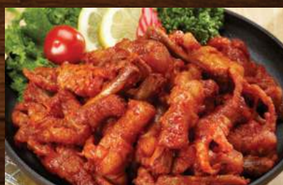
Spicy Bone Chicken Feet