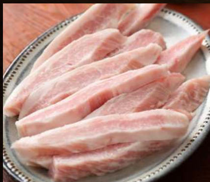
Pork Jowl 항정살