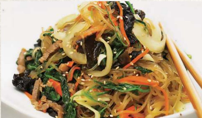
Glass Noodle with Veg.