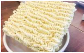
Ramyun Noodle 라면사리 $5