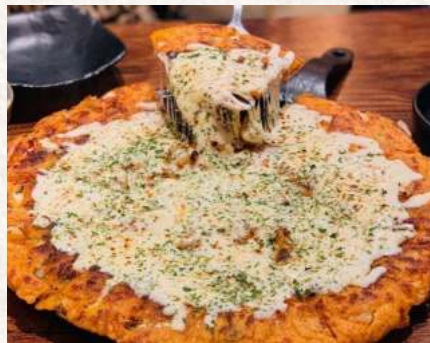
Cheese Kimchi Pancake 치즈 김치전 $28