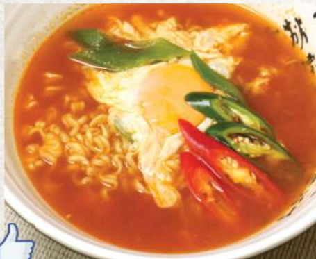
Korean Ramyun 🌶️