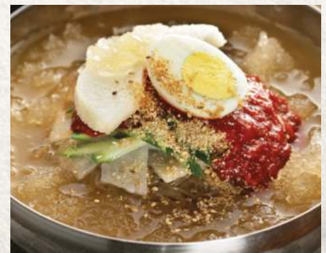
Cold Noodle (Soup)