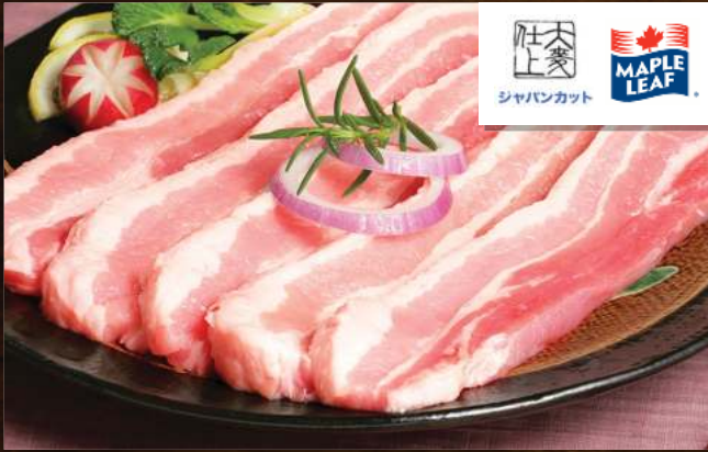
Fresh Pork Belly