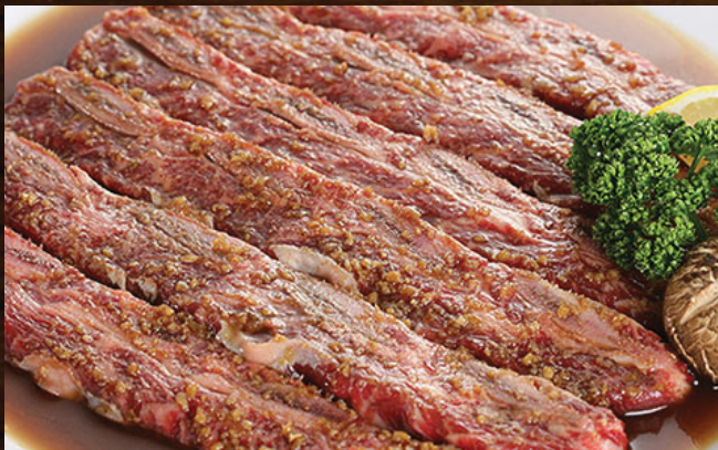
Marinated Beef Rib