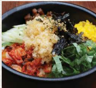
Rice with Fish Roe in Hot Stone 알밥 $14.8