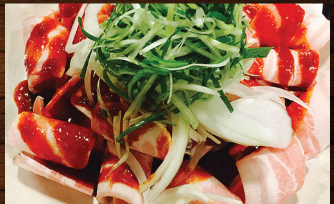
Thinly Sliced Spicy Pork Belly