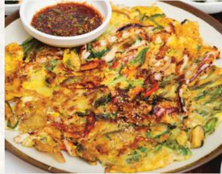
Seafood Pancake 해물파전 $28