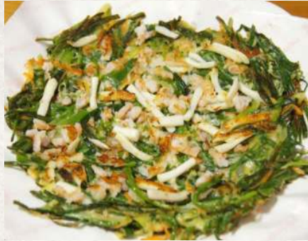
Chives pancake 부추전 $24