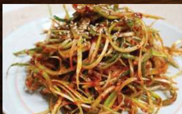
Spring Onion Salad