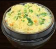
Steamed Egg 계란찜

Kimchi / Bean Paste / Soft Tofu 김치찌개 / 된장찌개 / 순두부찌개