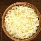
Add-on Mozzarella Cheese