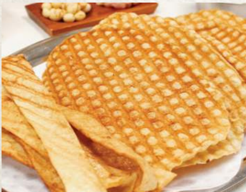
Fish Crackers (6pcs) 쥐포튀김 $10