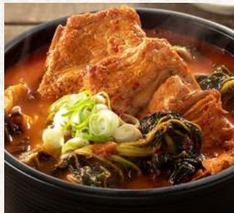
Pork Rib Hangover Soup 뼈해장국 $25