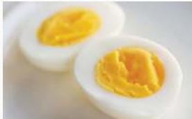
Boiled Egg 삶은계란 $2