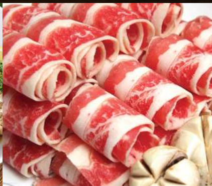
Beef Brisket 차돌박이