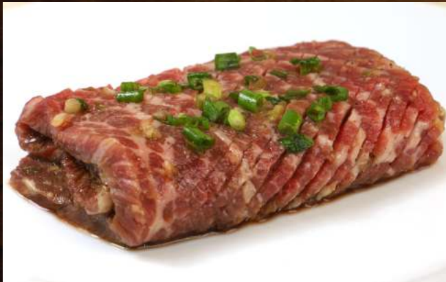
Marinated King Rib