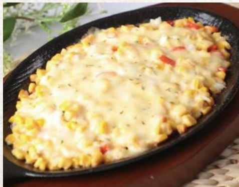
Corn Cheese 콘치즈 $12