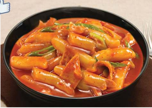
Tteokbokki 🌶️ (Spicy rice cake)