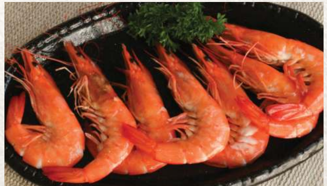
Butter Prawns (8 pcs)