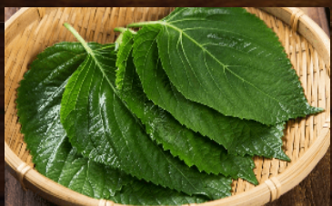
Perilla Leaf basket