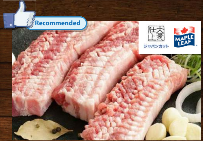
X-Cut Thick Pork Belly