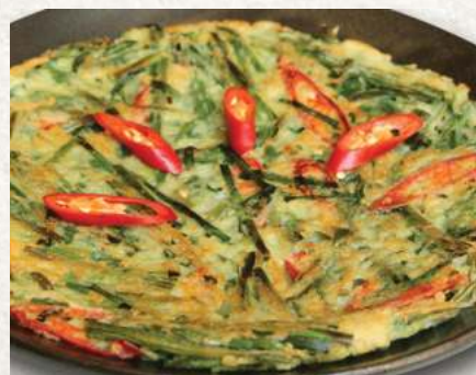
Vegetable Pancake 야채전 $22

*Images depicted in the menu are for reference only.