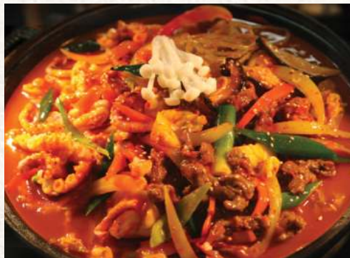
Beef & Octopus Stew