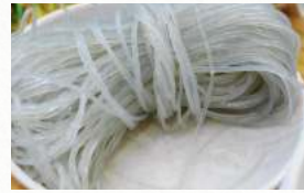
Glass Noodle 당면사리 $3