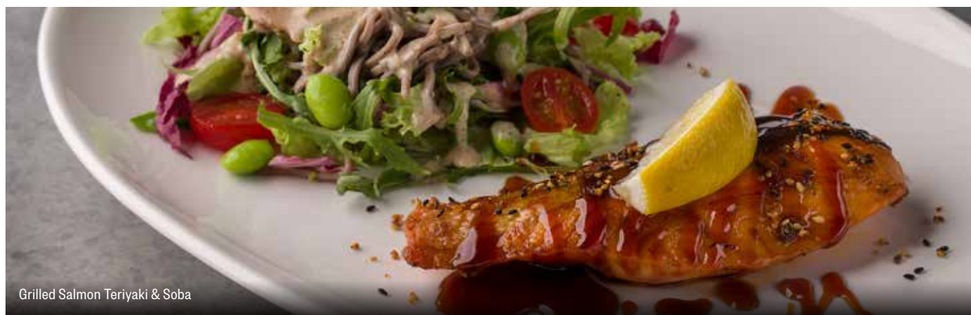
Grilled Salmon Teriyaki & Soba