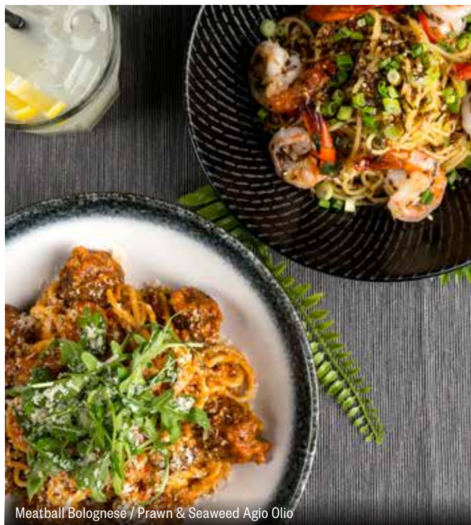
Meatball Bolognese / Prawn & Seaweed Aglio Olio

White Shimeji Mushrooms, Button Mushrooms, Basil Pesto, Parmesan