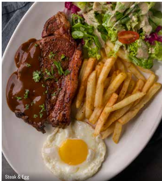
Steak & Egg

Pan-Seared Salmon with Crispy Skin, Mirin Baked Potato, Sautéed Haricot Verts, Lemon Wedge