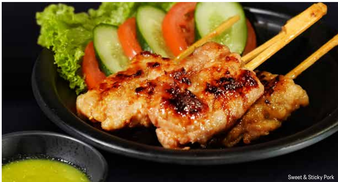
Sweet & Sticky Pork

Grilled Marinated Chicken, Fresh Lemongrass, Honey, Garlic (5 pcs)