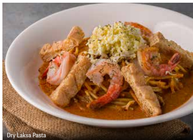
Dry Laksa Pasta

Spaghetti, Laksa Gravy, Tiger Prawns, Tao Pok, Eggs, Laksa Leaves