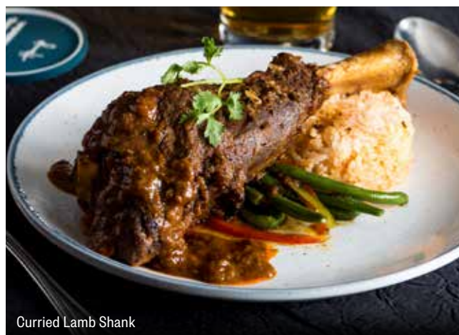
Curried Lamb Shank