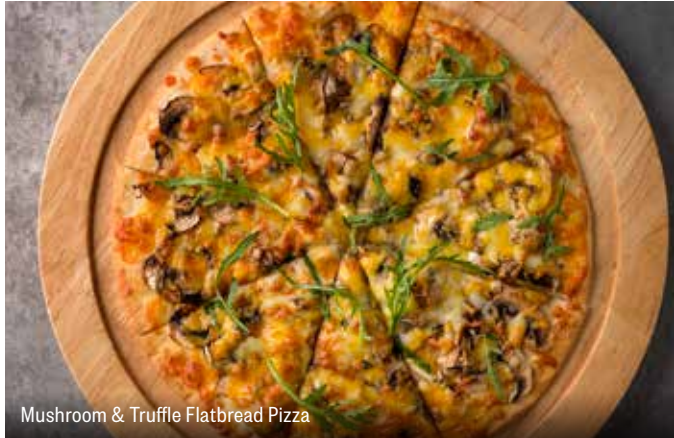
Mushroom & Truffle Flatbread Pizza