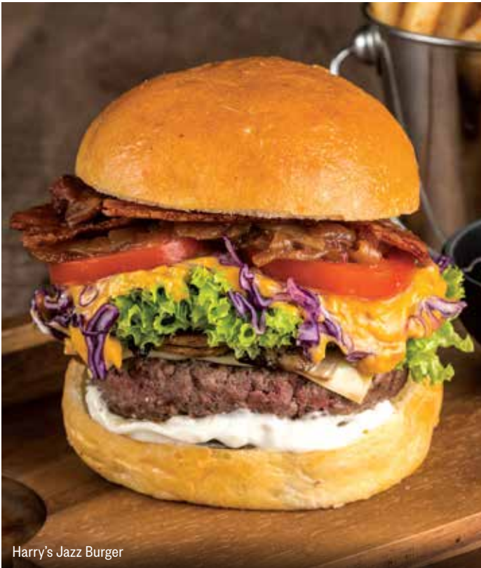
Harry's Jazz Burger