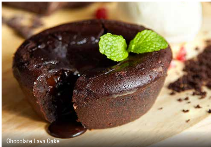
Chocolate Lava Cake