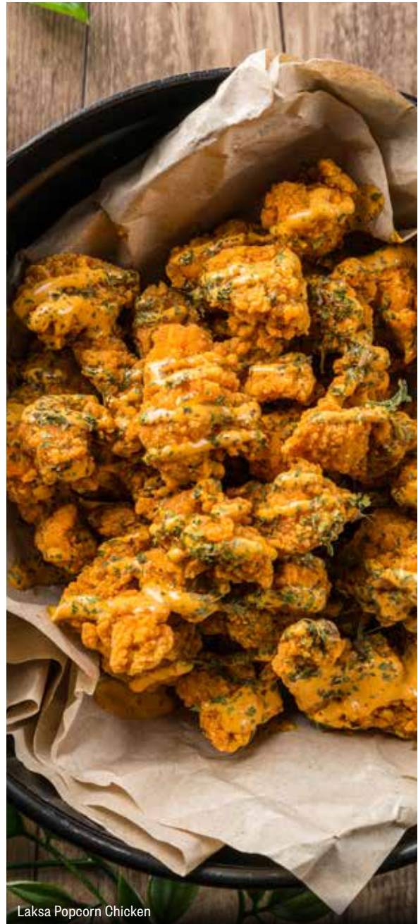
Laksa Popcorn Chicken