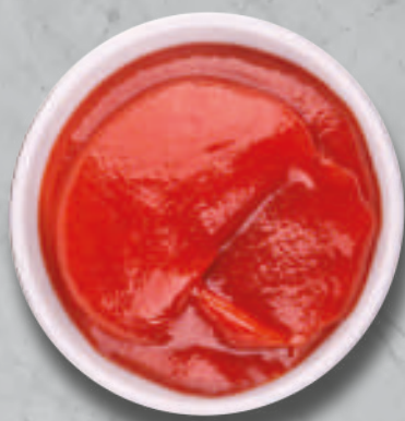
RUBRA (Italian Ketchup)