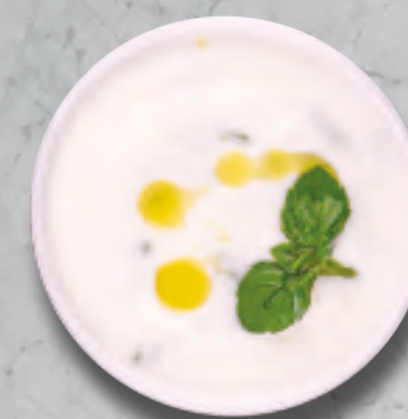
MINT and YOGURT