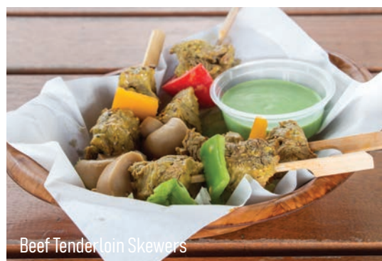
Beef Tenderloin Skewers