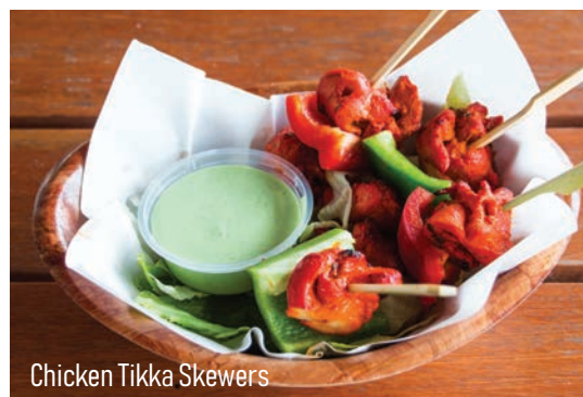
Chicken Tikka Skewers