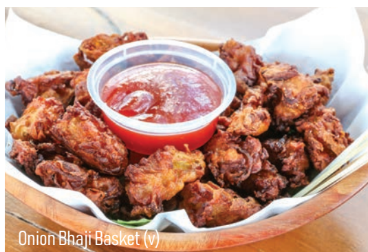
Onion Bhaji Basket (v)