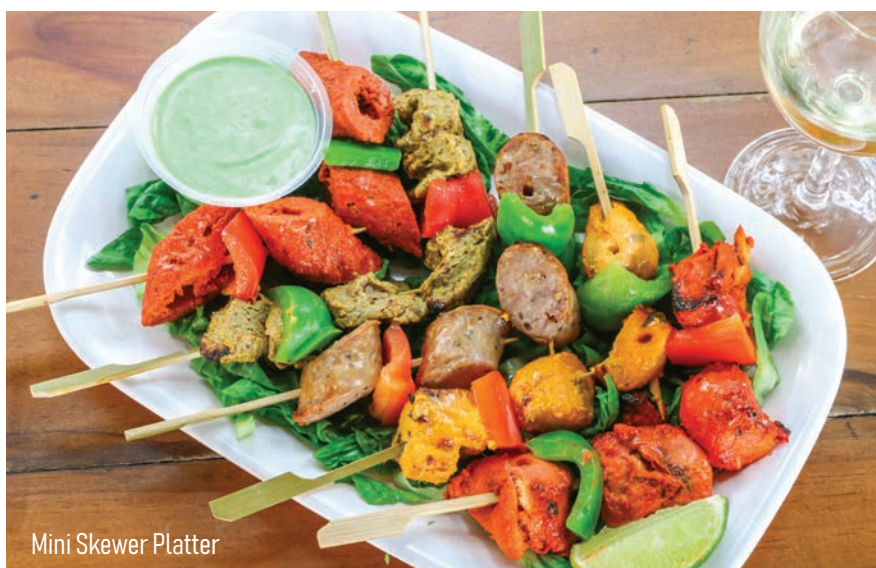
Mini Skewer Platter