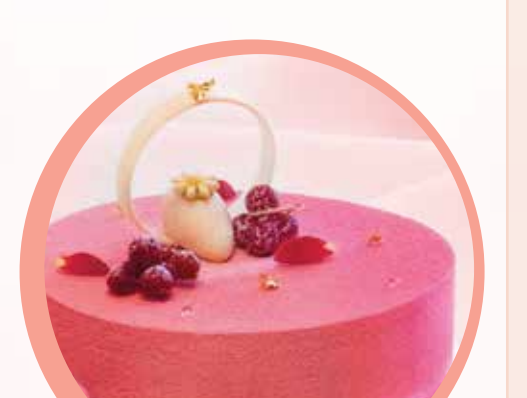
Pre-book: Signature 500g Raspberry Lychee Dream Cake at $38*(u.p $49++)