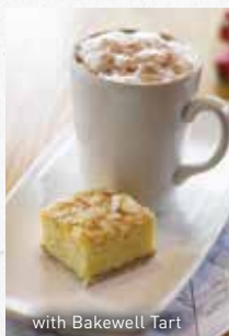
with Bakewell Tart