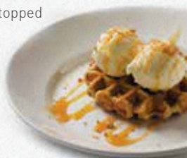
Toffee Crunch Waffle

A cinnamon waffle served warm with two scoops of vanilla ice cream, drizzled in toffee flavoured sauce and sprinkled with toffee pieces