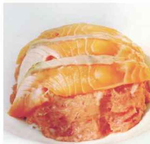
サーモンひっかき炙り丼 SALMON HIKKAKI ABURI DON SET

Slices of salmon, and scraped salmon flame-torched and served with miso soup, chawanmushi, salad and dessert.