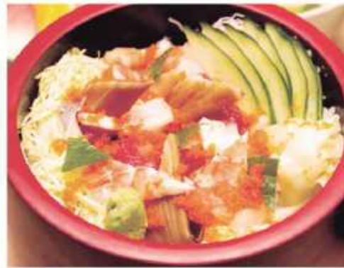
バラチラシ丼 BARACHIRASHI DON SET

Mixed diced sashimi topped on sushi rice and served with miso soup, chawanmushi, salad and dessert.