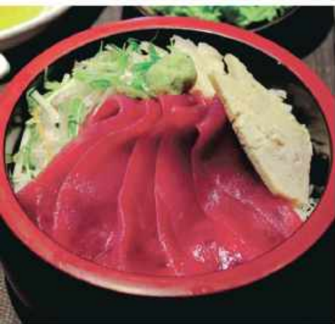
鉄火丼 MEBACHI TEKKA DON SET

Big-eyed Maguro lean meat sashimi on sushi rice and served with miso soup, chawanmushi, salad and dessert.