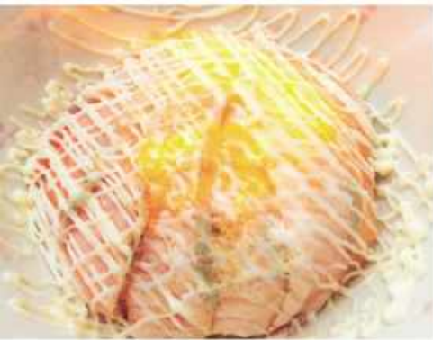
サーモンマヨネーズ炙り丼 SALMON ABURI DON SET

Tofu breaded and fried until crisp drizzled with spicy sauce, on rice and served with miso soup, chawanmushi, salad and dessert.