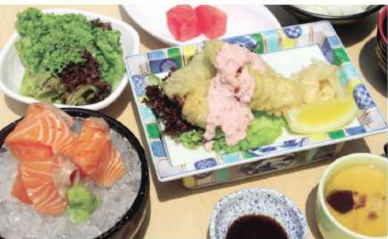
サーモントルタル焼き定食 SALMON TARTARE YAKI SET $21 90 ++

Grilled salmon with sweet-savoury teriyaki sauce accompanied with Salmon sashimi, rice, salad, chawanmushi, miso soup and dessert.