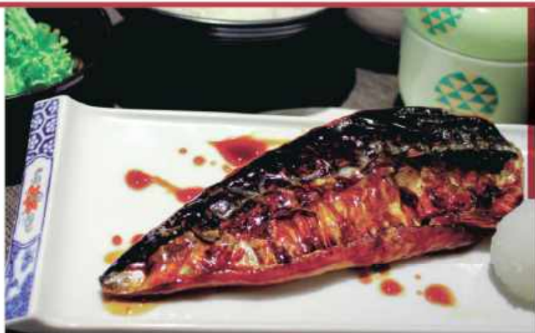
サバ照り焼き定食 SABA TERIYAKI SET $18 80 ++

Savour Maguro Toro in three styles: Teriyaki (braised in sweet-savoury sauce), Tataki (lightly seared with grated radish), and 2 different cuts of Sashimi.