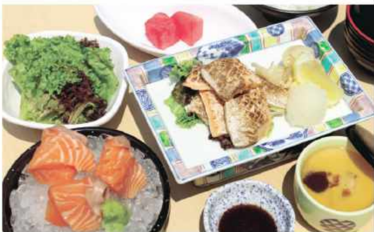
サーモンハラス焼き定食 SALMON HARASU YAKI SET $24 90 ++

Salmon drizzled with special tartare sauce and served with rice, salad, chawanmushi, miso soup and dessert.