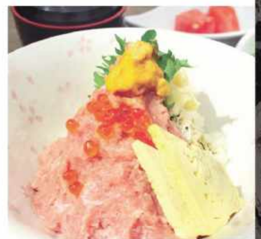
トロウニいくら丼 TORO UNI IKURA DON SET

TORO meat topped with fresh uni (sea urchin) and salmon roe on rice and served with miso soup, chawanmushi, salad, and dessert.