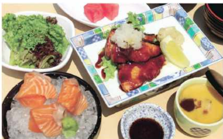
サーモン照り焼き定食 SALMON TERIYAKI SET $21 90 ++

Maguro O-TORO and Salmon sashimi paired with mixed tempura and fried salmon belly set.