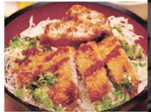
鯖かつ丼 MAGURO KATSU DON SET

Maguro fillet breaded and fried until crisp, on rice and served with miso soup, chawanmushi, salad and dessert.