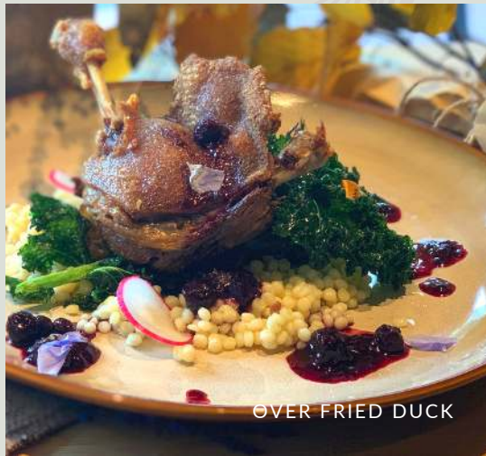
OVER FRIED DUCK