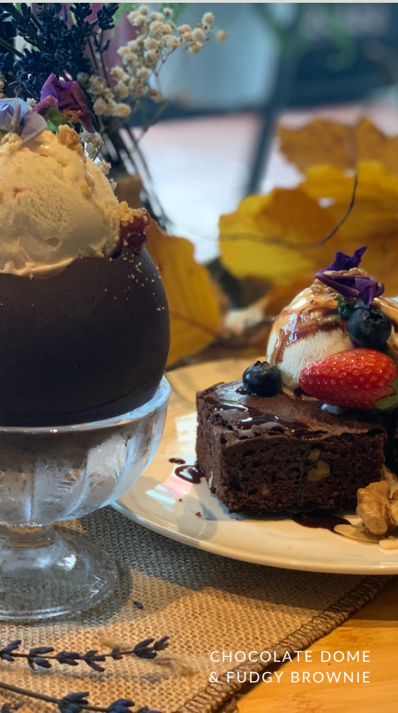
CHOCOLATE DOME & FUDGY BROWNIE

ALL PICTURES ARE FOR ILLUSTRATION PURPOSES ONLY. T&C APPLIES. ALL PRICES QUOTED ARE SUBJECTED TO 7% GST & 10% SERVICE CHARGE. FOLLOW US ON FACEBOOK OR INSTGRAM @THECOMMUNALPLACE FOR THE LATEST NEWS & EVENTS!