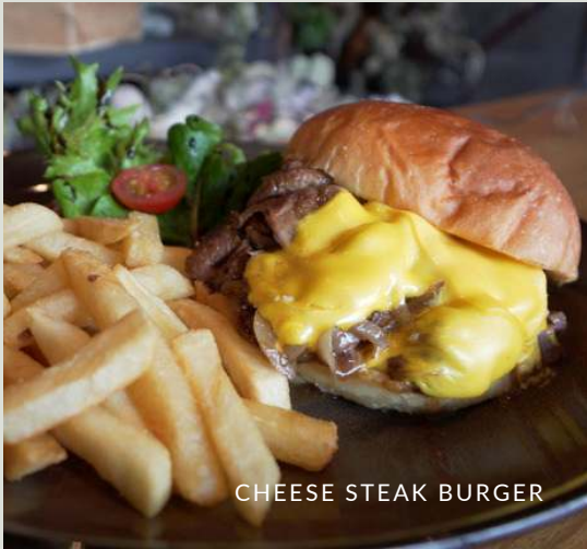
CHEESE STEAK BURGER