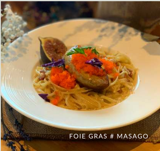
FOIE GRAS # MASAGO