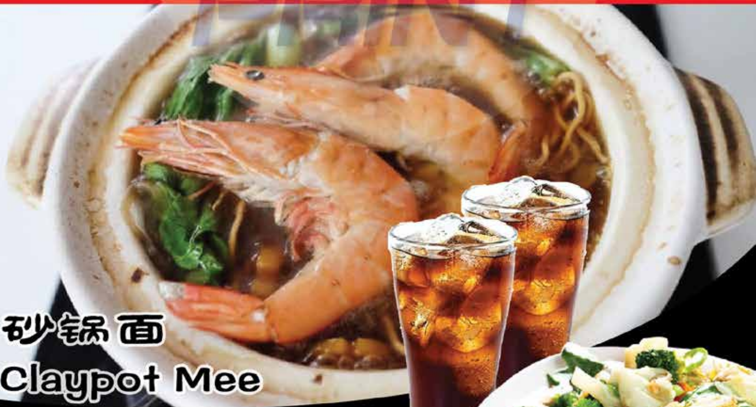
砂锅面 Claypot Mee

Inclusive of Claypot Rice / Mee + Mix Vege + 2 Drinks