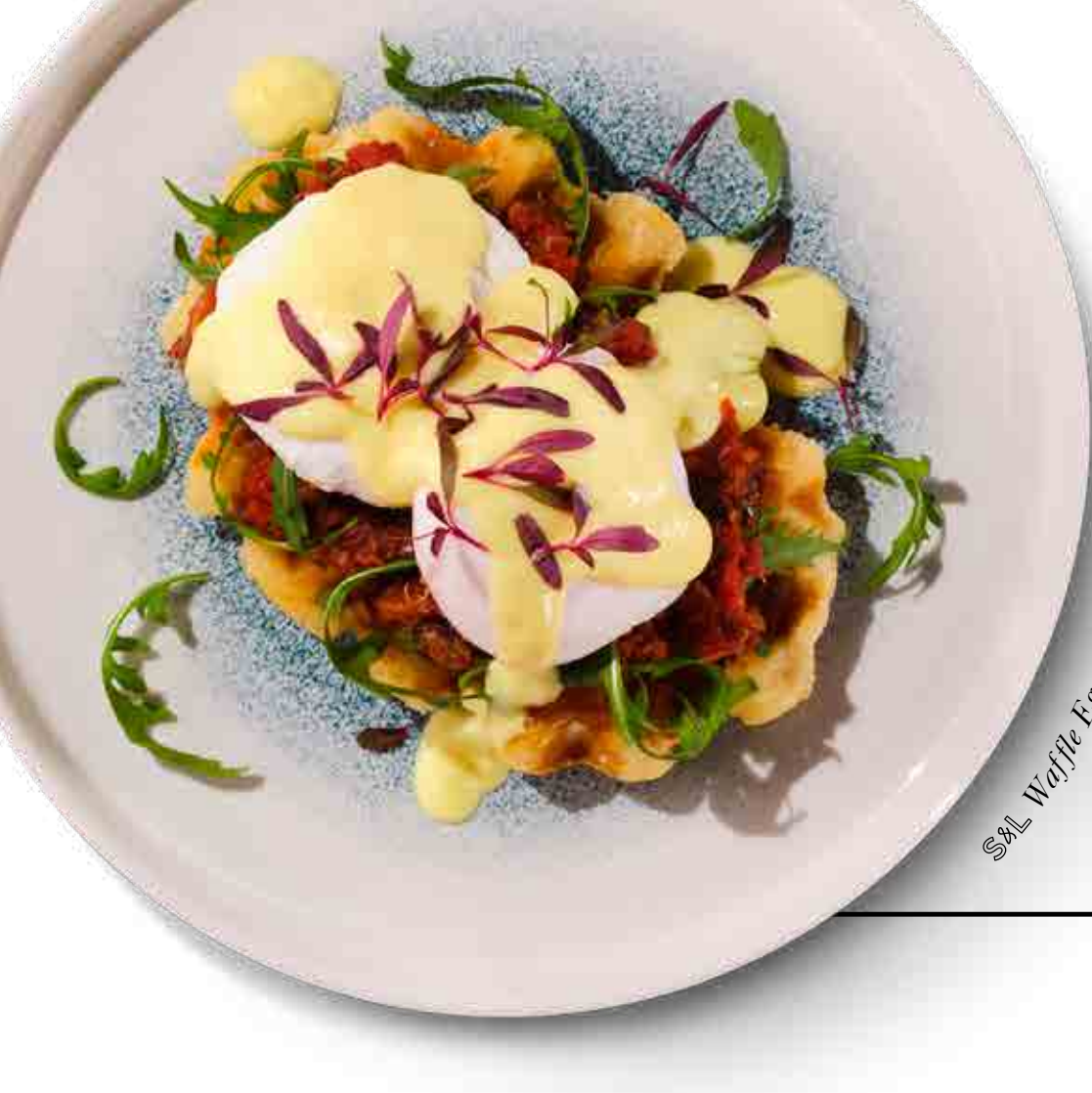
S&L Waffle Eggs