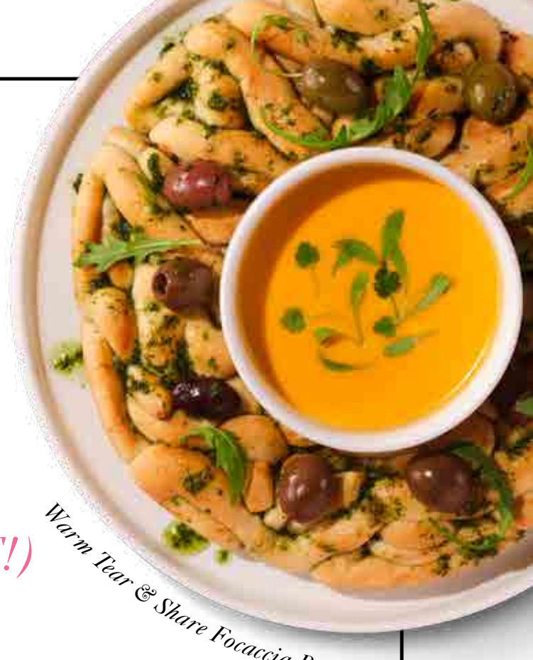
Warm Tear & Share Focaccia Bread

GRAB A PLATE AS A QUICK SNACK OR MIX THEM UP FOR A MEAL. WE RECOMMEND 3 PER PERSON. PERFECT FOR SHARING (OR NOT!)