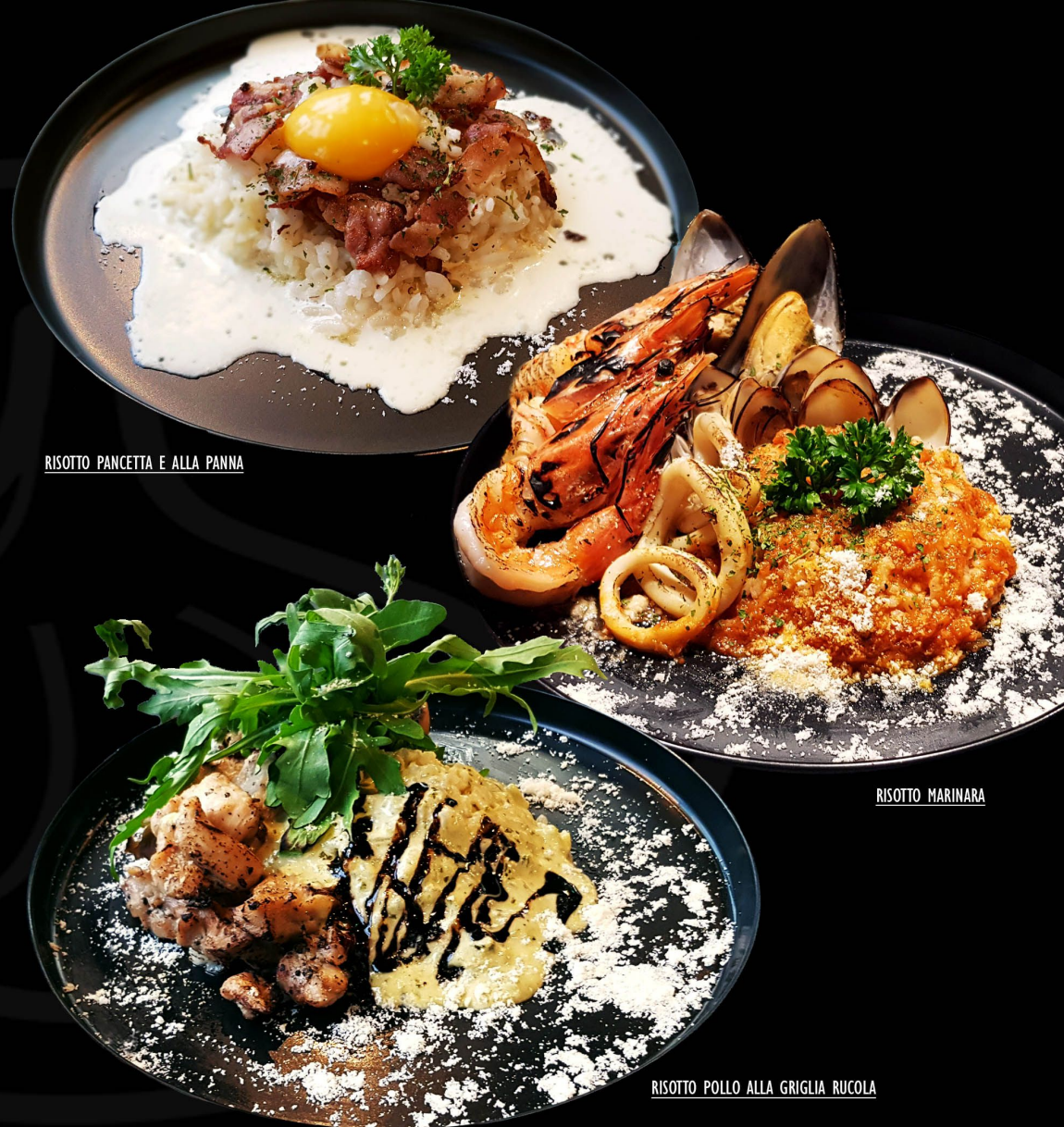
RISOTTO PANCETTA E ALLA PANNA

ITALIAN ARBORIO RICE COOKED WITH ASIATIC CLAMS, NZ HALF SHELL GREEN MUSSELS, SQUID AND PRAWNS, TOSSED WITH TOMATO AND WHITE WINE SAUCE