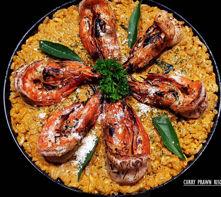
CURRY PRAWN RISOTTO