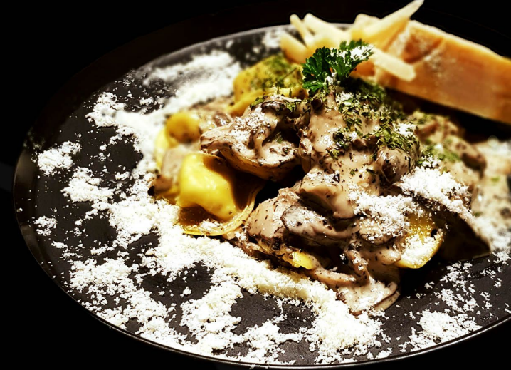
4 CHEESE TORTELLINI WITH TRUFFLE

*PRICES ARE EXCLUSIVE OF 10% SERVICE CHARGE AND 7% GST