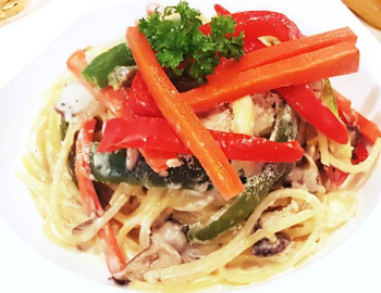
SPAGHETTI DI VERDURE GRIGLIATE MISTE

*PRICES ARE EXCLUSIVE OF 10% SERVICE CHARGE AND 7% GST