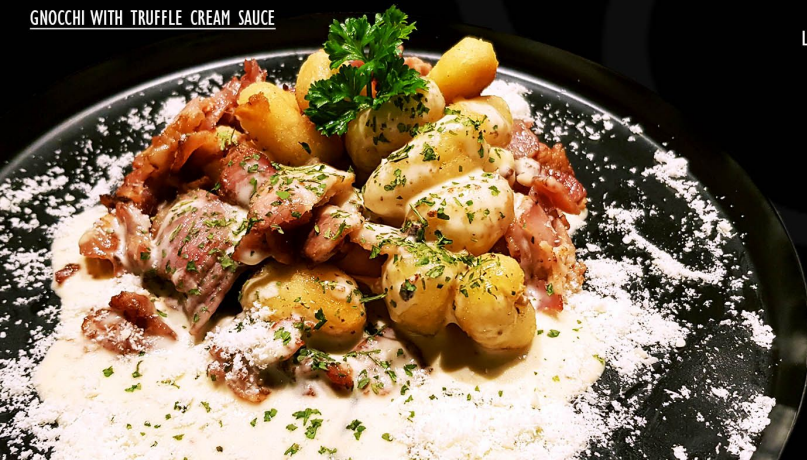
GNOCCHI WITH TRUFFLE CREAM SAUCE