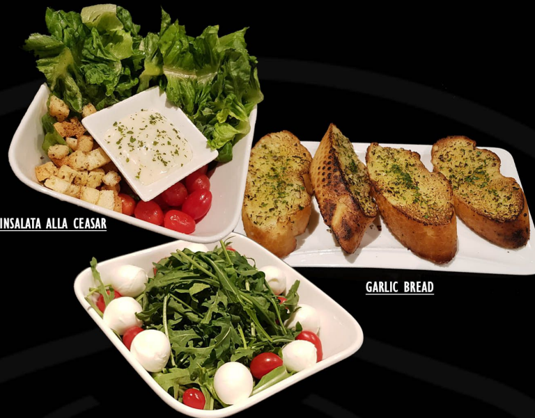
INSALATA ALLA CAESAR