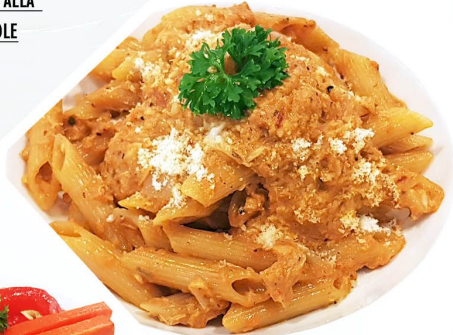
PENNE AL GRANCHIO