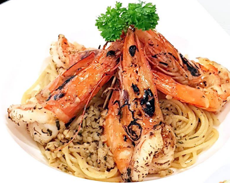
SPAGHETTI AGLIO + 5 KING SIZED PRAWNS