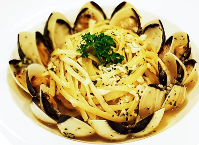
LINGUINE ALLA VONGOLE