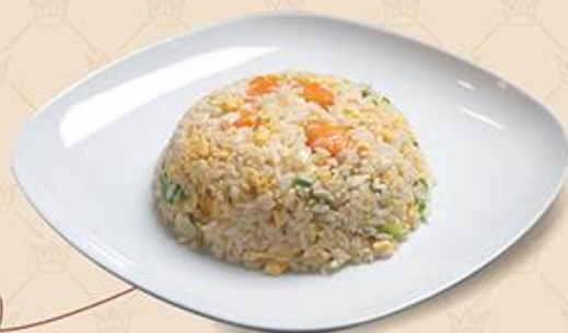
D $11.80 D2 虾仁炒饭 EGG FRIED RICE WITH SHRIMPS (PER)