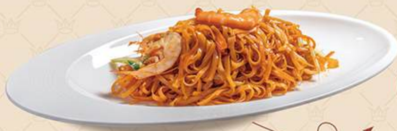
D $9.80 D3 泰式炒粿条 PAD THAI FRIED KWAY TEOW (PER)