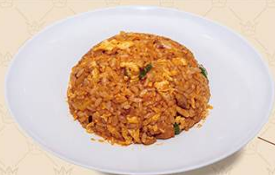
D1 香辣鸡丁炒饭 SPICY FRIED RICE (PER)