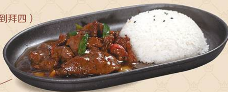
D $9.80 D5 牛肉饭 (仅限拜一到拜四) YIZUN TEPPANYAKI BEEF RICE (PER) (ONLY FROM MONDAY TO THURSDAY)