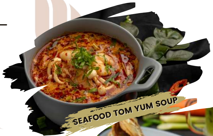
SEAFOOD TOM YUM SOUP

A hearty coconut seafood soup packed with Tom Yum flavour for the perfect pick-me-up