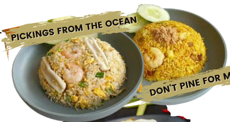
PICKINGS FROM THE OCEAN

Aromatic garlic and basil rice with fresh-cut Thai chili-as tasty as it is fragrant