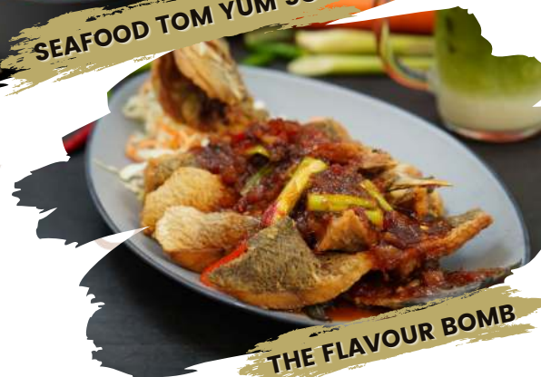
THE FLAVOUR BOMB

Golden Curry Prawn made with cherry tomatoes and shredded coconut