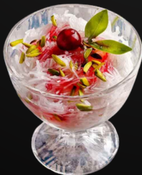
46. Faloodeh Shirazi