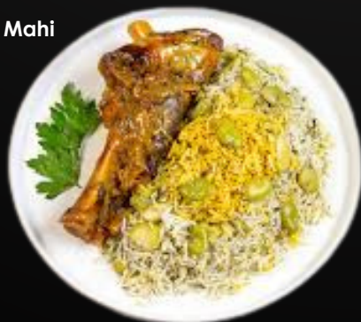
26. Baghali Polo ba Mahiche