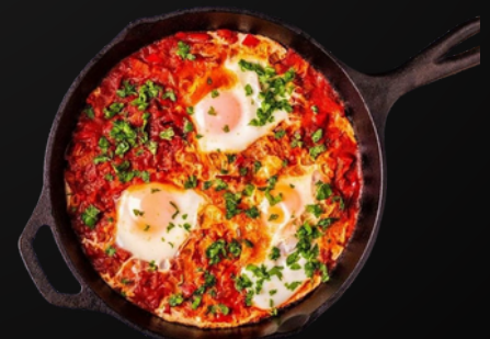
50. Om'let-e Gojeh Farangi