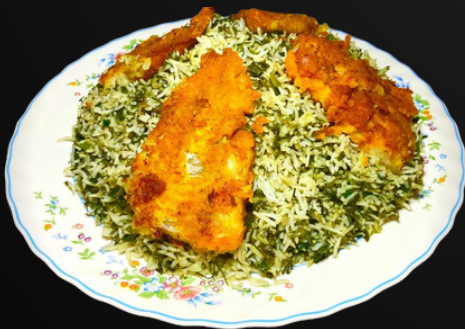
25. Shivid Polo ba Mahi