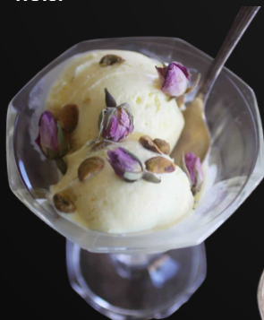
45. Bastani Sonnati