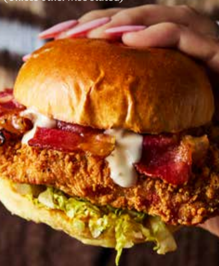
The Buttermilk Ranch

All served in a soft glazed bun with lettuce, onion and gherkin, dished up with a side of skin-on fries. (Unless otherwise stated)