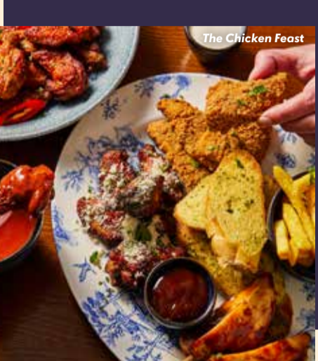
The Chicken Feast