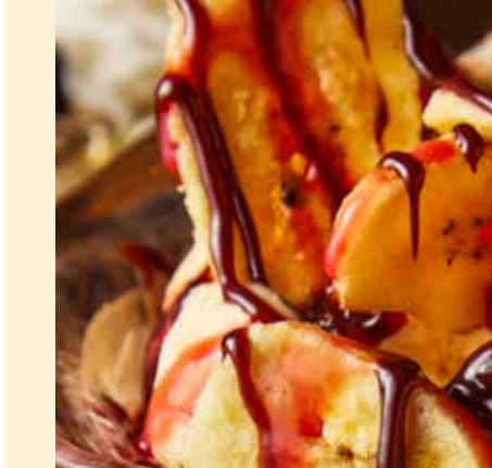
Hand-Battered Fish & Chips