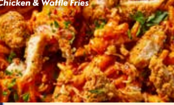
Chicken & Waffle Fries