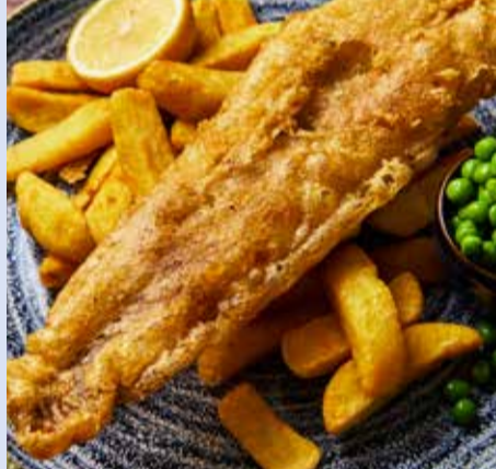
Hand-Battered Fish & Chips