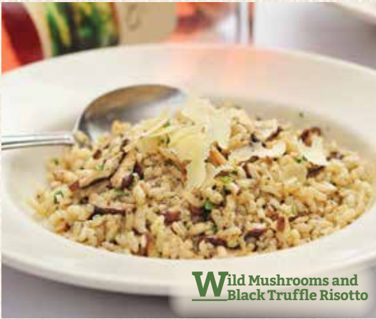
Wild Mushrooms and Black Truffle Risotto