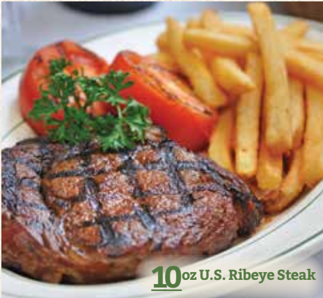
10 oz U.S. Ribeye Steak