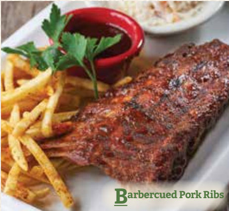
Barbercued Pork Ribs