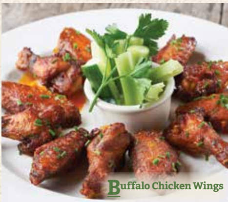
Buffalo Chicken Wings