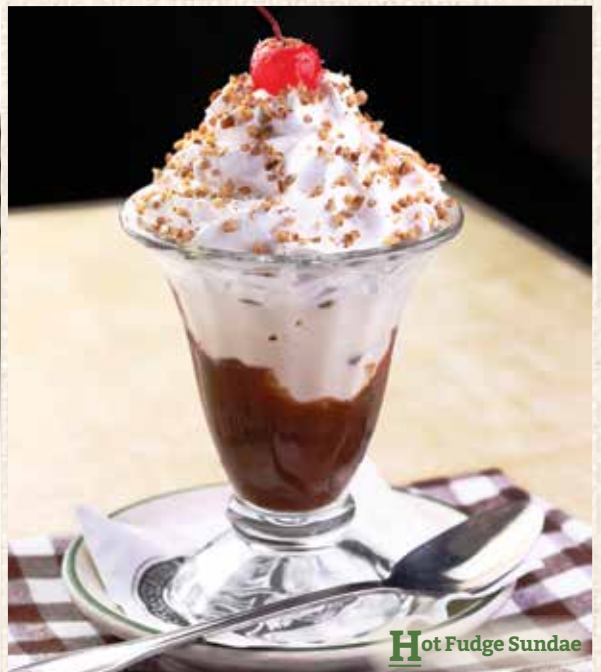
Hot Fudge Sundae