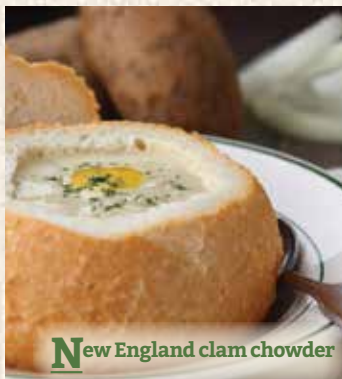
New England clam chowder