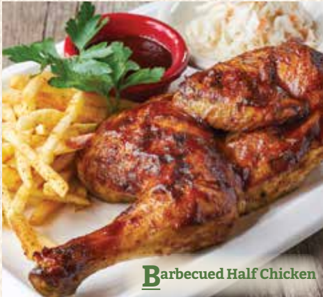
Barbecued Half Chicken