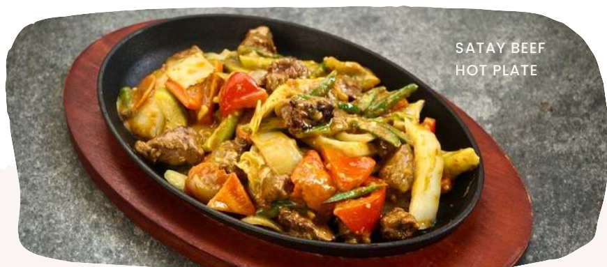
SATAY BEEF HOT PLATE