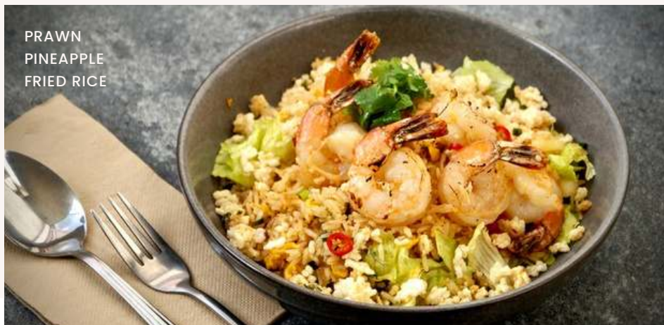
PRAWN PINEAPPLE FRIED RICE