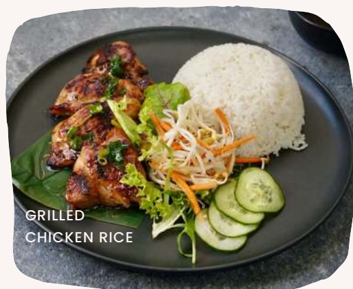
GRILLED CHICKEN RICE