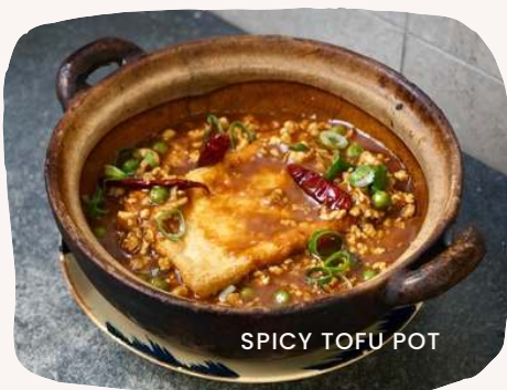
SPICY TOFU POT