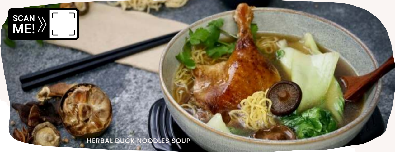
HERBAL DUCK NOODLES SOUP