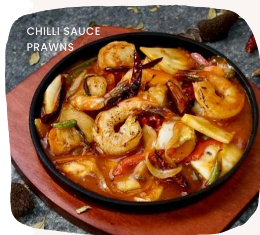
CHILLI SAUCE PRAWNS