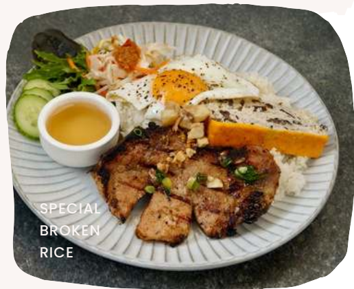
SPECIAL BROKEN RICE