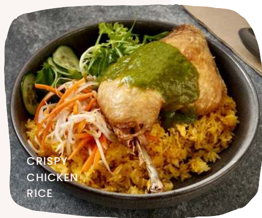
CRISPY CHICKEN RICE