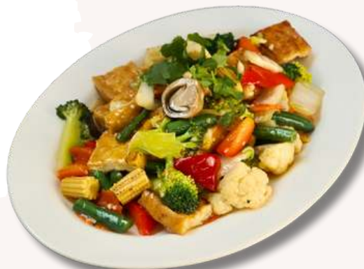
TOFU GARLIC SAUCE