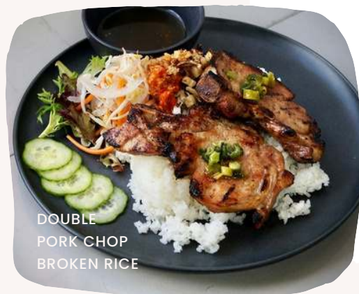
DOUBLE PORK CHOP BROKEN RICE