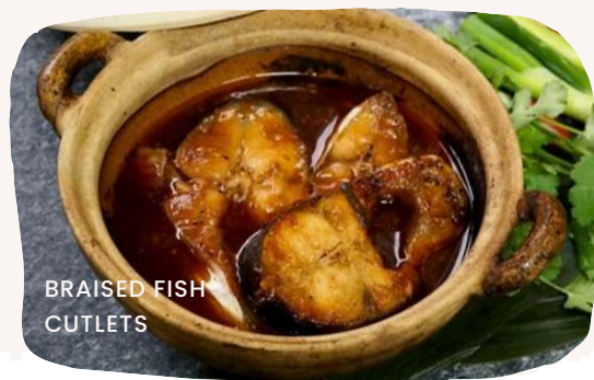
BRAISED FISH CUTLETS