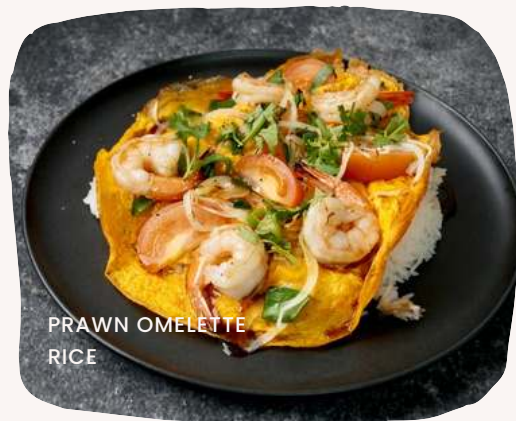
PRAWN OMELETTE RICE