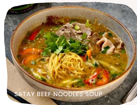
SATAY BEEF NOODLES SOUP