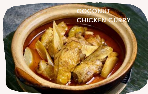
COCONUT CHICKEN CURRY