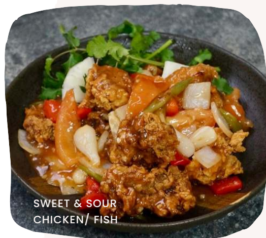
SWEET & SOUR CHICKEN/ FISH