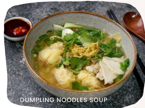
DUMPLING NOODLES SOUP

Crab & pork cake, fried tofu, tomato with crab-based broth.