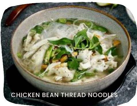
CHICKEN BEAN THREAD NOODLES