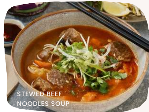
STEWED BEEF NOODLES SOUP