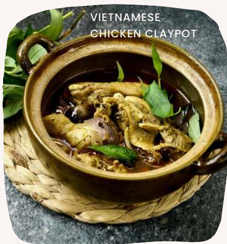
VIETNAMESE CHICKEN CLAYPOT