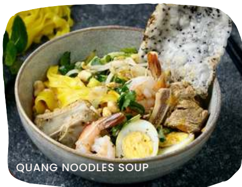
QUANG NOODLES SOUP