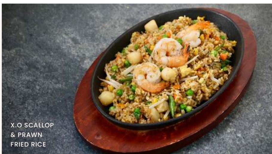
X.O SCALLOP & PRAWN FRIED RICE