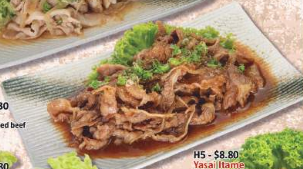
H6 - $13.80 Yakiniku pan fried sliced beef