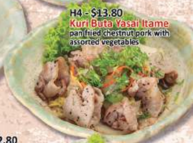
H4 - $13.80 Kuri Buta Yasai Itame pan fried chestnut pork with assorted vegetables