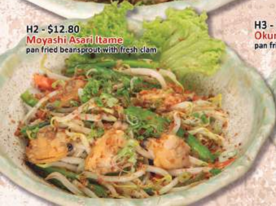
H2 - $12.80 Moyashi Asari Itame pan fried beansprout with fresh clam