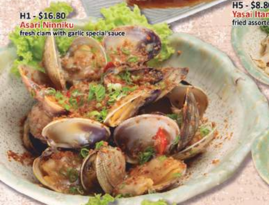
H1 - $16.80 Asari Ninniku fresh clam with garlic special sauce