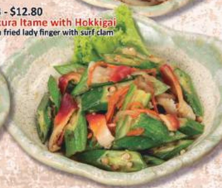
H3 - $12.80 Okura Itame with Hokkigai pan fried lady finger with surf clam