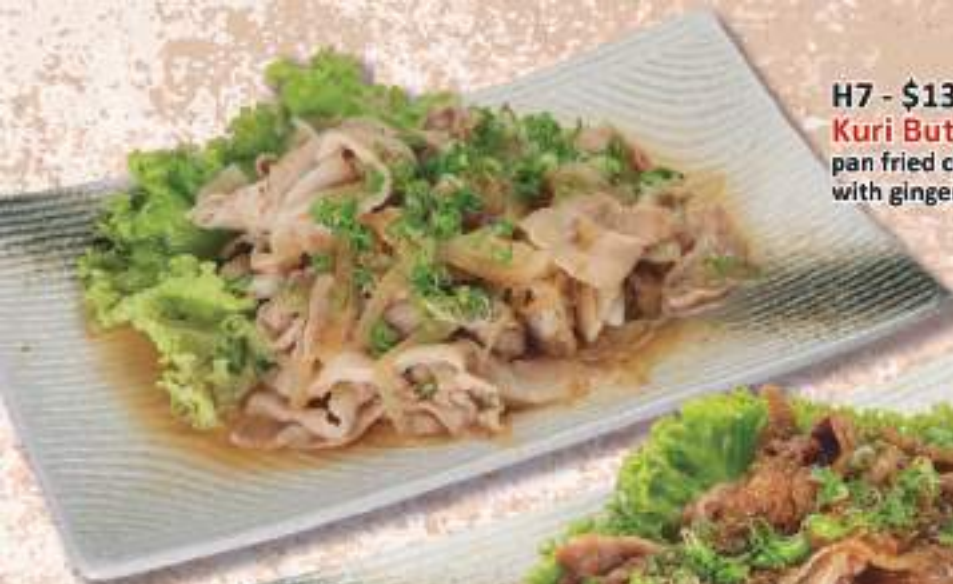
H7 - $13.80 Kuri Buta Shoga pan fried chestnut sliced pork with ginger sauce