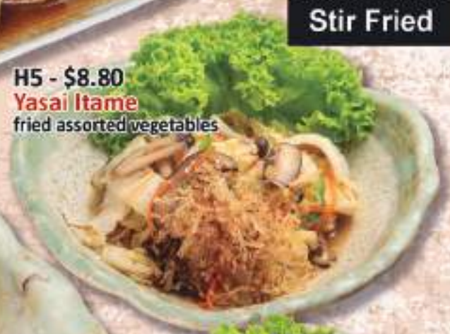
H5 - $8.80 Yasai Itame fried assorted vegetables