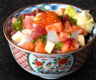
Bara Chirashi Don Assorted Cubed Sashimi Rice Bowl w/Soup 20.00