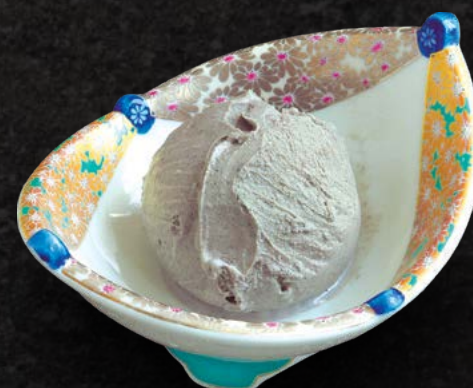
Goma Ice Cream Black Sesame Ice Cream 6.00

Images are for illustration purposes only.