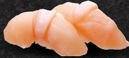
Hotate Gai Scallop 14.00 (2 pcs)