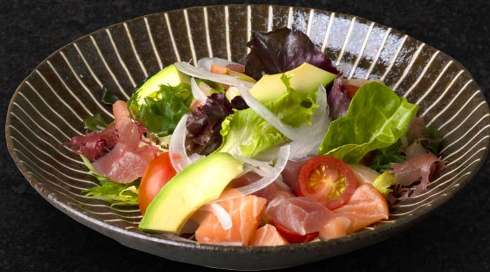
Wafu Salad Salad in Japanese Dressing Green - 13.00 | Fried Soft Shell Crab - 23.00 | Salmon - 25.00

Images are for illustration purposes only.