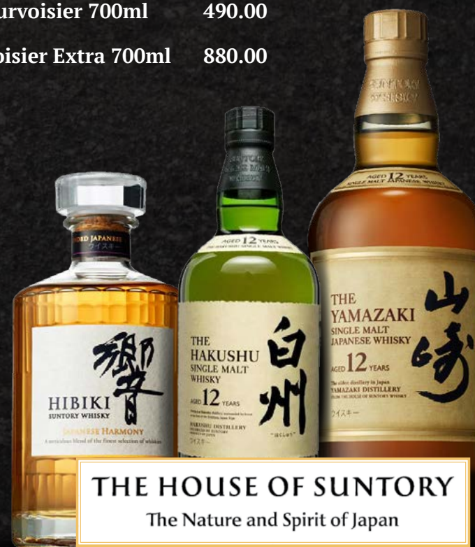
THE HOUSE OF SUNTORY The Nature and Spirit of Japan

All prices are subjected to 10% Service Charge & prevailing GST.