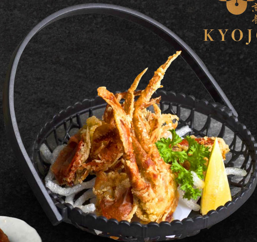
Kani Karaage Deep Fried Soft Shell Crab 15.00