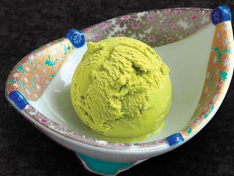
Macha Ice Cream Green Tea Ice Cream 6.00