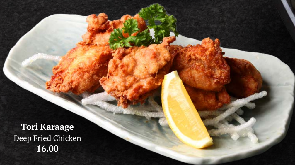
Tori Karaage Deep Fried Chicken 16.00