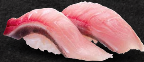
Hamachi Yellow Tai 10.00 (2 pcs)