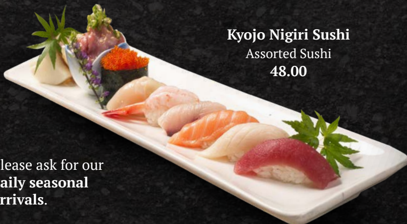
Kyojo Nigiri Sushi Assorted Sushi 48.00