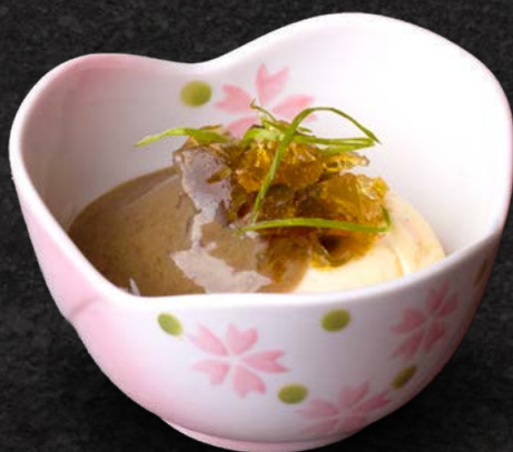
❖ Kani Tofu - Kyojo Signature Crab Meat Bean Curd 8.00