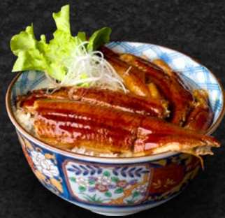
Una Don Grilled Eel with Teriyaki Sauce Rice Bowl w/Soup 30.00

☆☆☆ Upgrade to Set Meal $8.00 To include: Potato Salad Appertizer Pickles Dessert of the Day