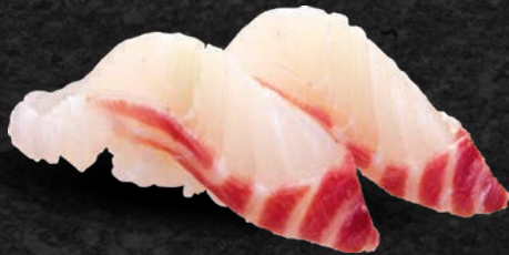
Tai Sea Bream 10.00 (2 pcs)