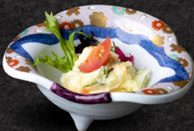
Potato Salad Japanese Potato Salad 4.00