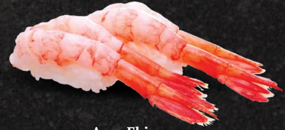
Ama Ebi Sweet Prawn 20.00 (2 pcs)