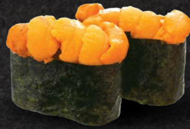
Nama Uni Sea Urchin 28.00 (2 pcs)