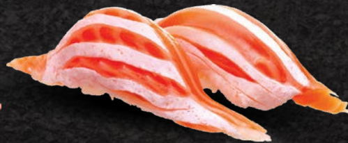
Shake Salmon 10.00 (2 pcs)