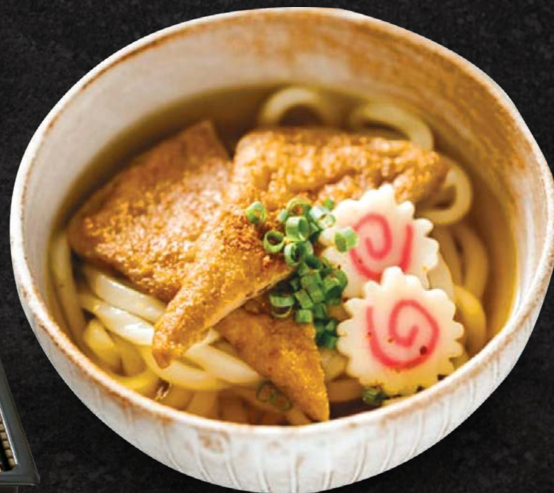
Kitsune Udon Japanese Dry Bean Curd with Noodles 13.00