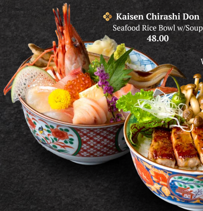
❁ Kaisen Chirashi Don Seafood Rice Bowl w/Soup 48.00