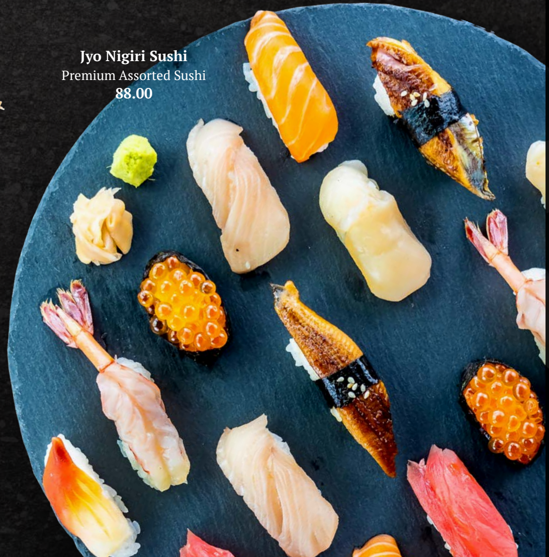
Jyo Nigiri Sushi Premium Assorted Sushi 88.00

Please ask for our daily seasonal arrivals.