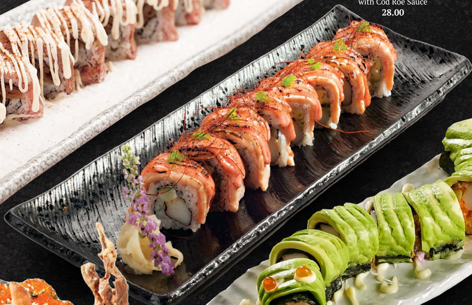
Shake Mentai Aburi Maki Seared Salmon Roll with Cod Roe Sauce 28.00