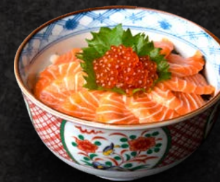
Shake Ikura Don Saimon with Salmon Roe Rice Bowl w/Soup 20.00