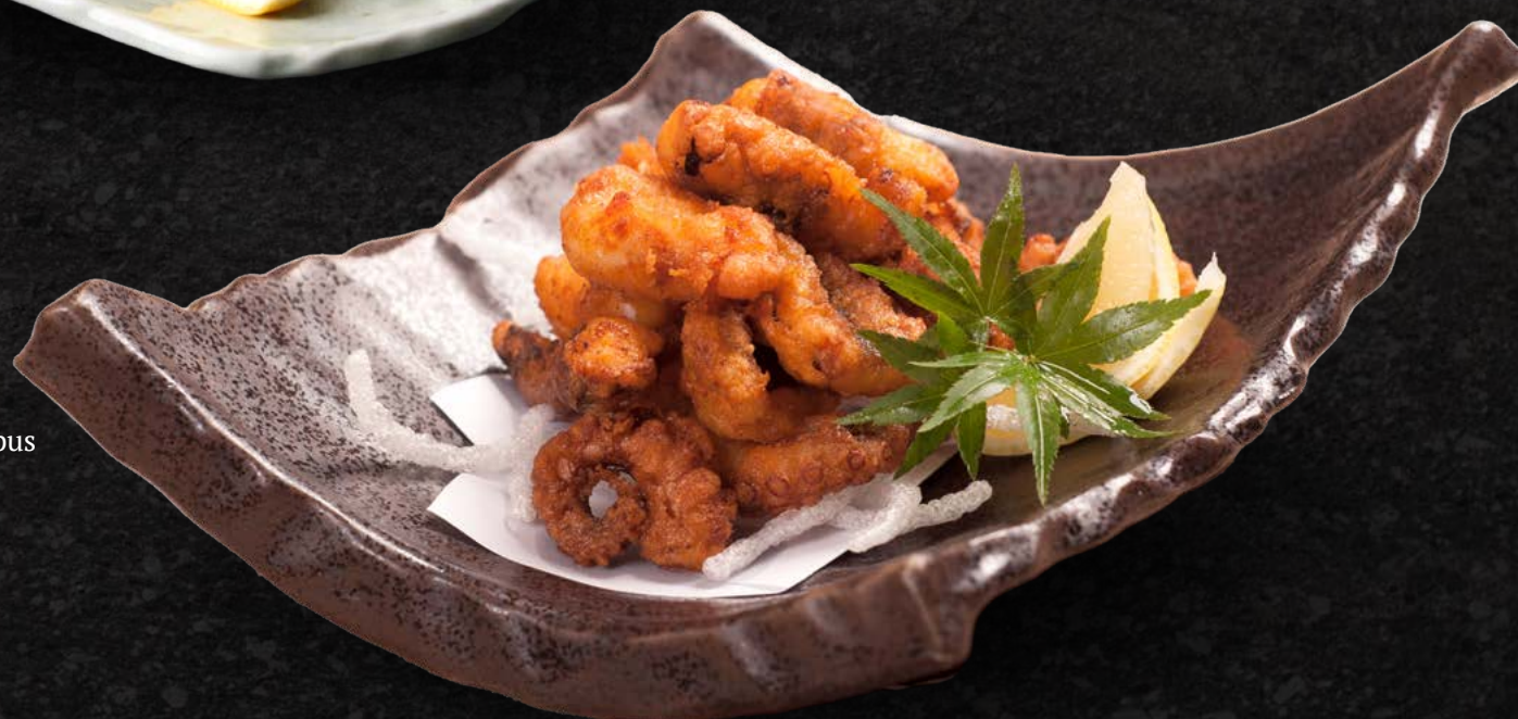
Tako Karaage Deep Fried Japanese Octopus 15.00