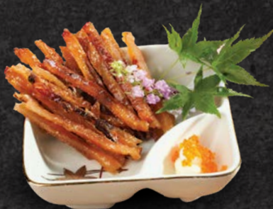
Fugu Mirin Air Dried Puffer Fish 16.00