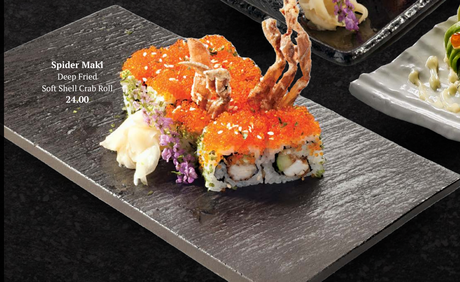
Spider Maki Deep Fried Soft Shell Crab Roll 24.00