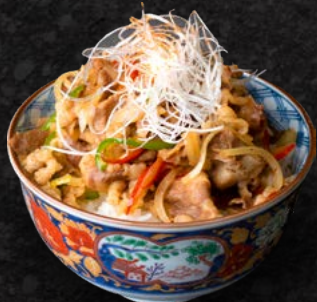
Iberico Don Grilled Iberico Slice Pork Rice Bowl w/Soup 19.00