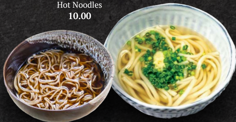
Su Soba/Udon Hot Noodles 10.00