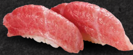
Toro Fatty Tuna 28.00 (2 pcs)