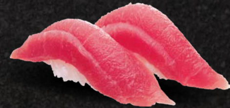
Maguro Red Tuna 10.00 (2 pcs)