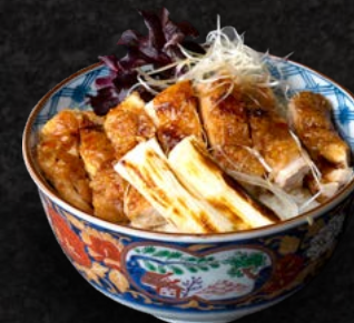
Tori Teriyaki Don Grilled Chicken with Teriyaki Sauce Rice Bowl w/Soup 19.00