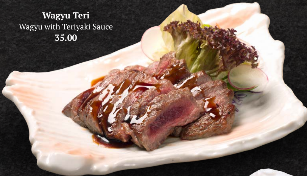
Wagyu Teri Wagyu with Teriyaki Sauce 35.00