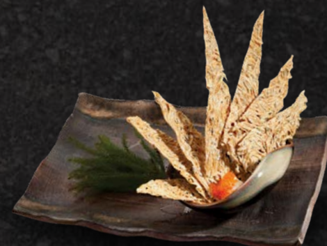
Tatami Iwashi Baby Japanese Anchovy 12.00