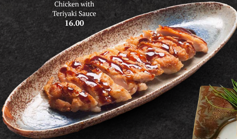
Tori Teriyaki Chicken with Teriyaki Sauce 16.00