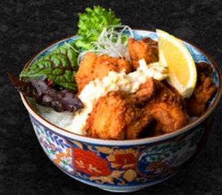
Tori Karaage Naban Don Deep Fried Chicken with Sweet & Sour Sauce Rice Bowl w/Soup 19.00