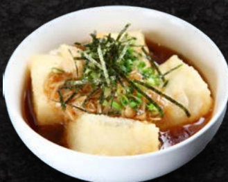
Agedashi Tofu Japanese Hot Tofu 9.00