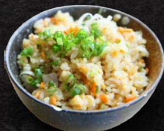
Garlic Rice Japanese Garlic Rice 6.00