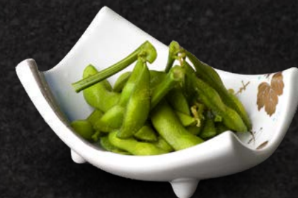
Edamame Japanese Green Bean 4.00