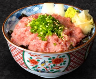
Negitoro Don Minced Tuna Belly Rice Bowl w/Soup 25.00