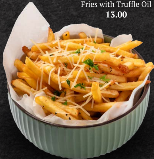
Truffle Fries Fries with Truffle Oil 13.00