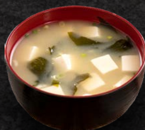
Miso Soup Japanese Miso Soup 4.00