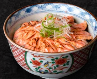
Shake Mentai Don Salmon with Mentaiko Sauce Rice Bowl w/Soup 19.00