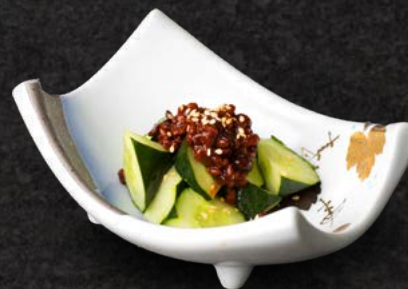
Morokyu Cucumber with Japanese Bean Sauce 9.00