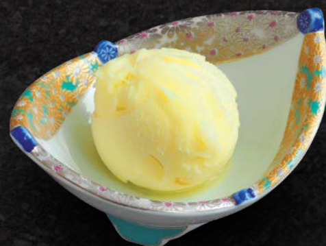
Yuzu Ice Cream Citron Ice Cream 6.00