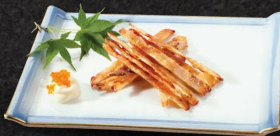
Kawahagi Leather Jacket 12.00