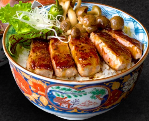
Wagyu Kaburi Don Wagyu Beef with Teriyaki Sauce Rice Bowl w/Soup 38.00

☆☆☆ Upgrade to Set Meal $8.00 To include: Potato Salad Appertizer Pickles Dessert of the Day