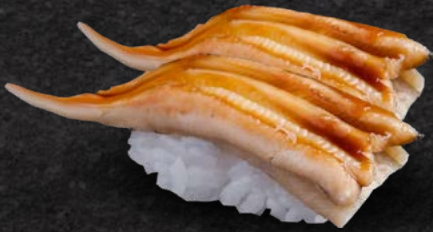
Anago Sea Eel 14.00 (2 pcs)