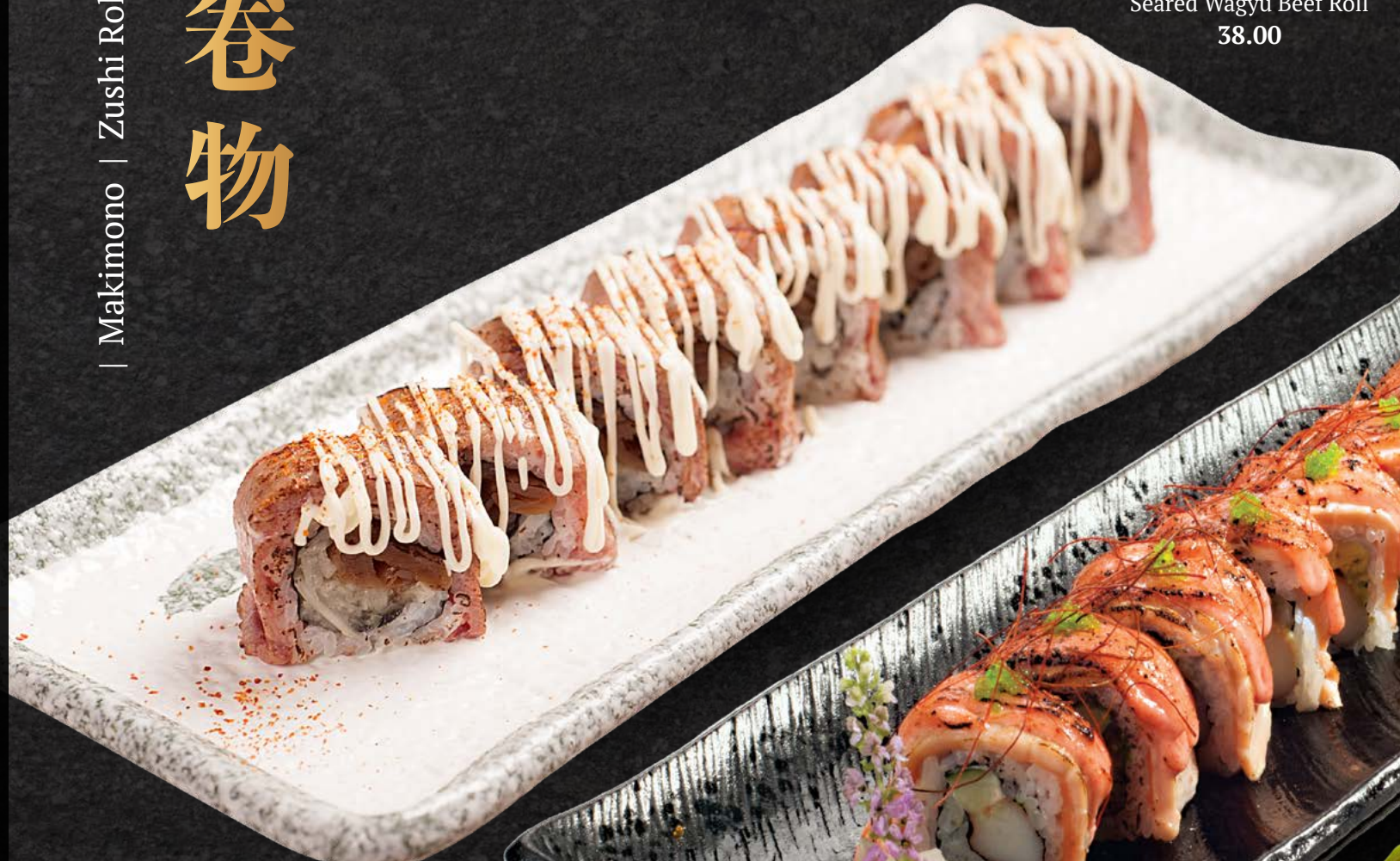
Wagyu Aburi Maki Seared Wagyu Beef Roll 38.00