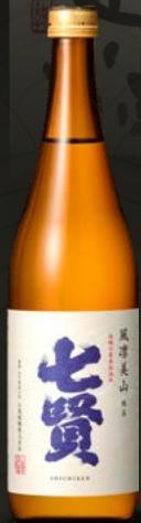
Shichiken Furinbizan Junmai