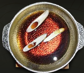
KYOJO SPECIAL SHABU SHABU