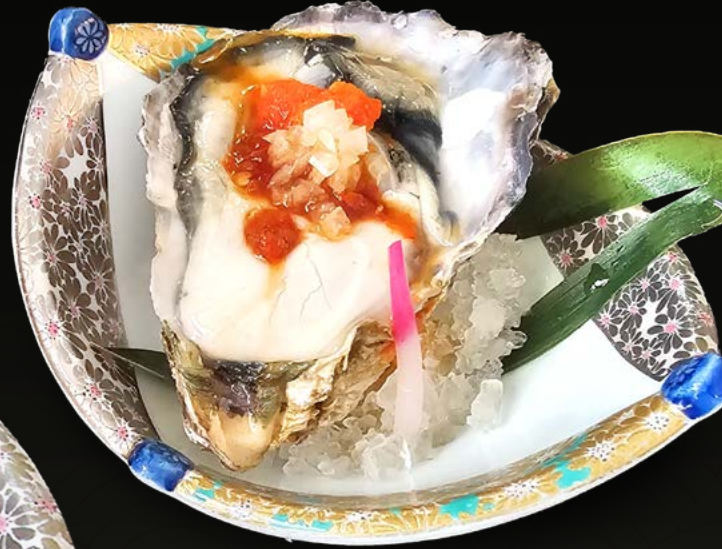
Oroshi Ponzu Nama Kaki Grated Radish Fresh Oyster