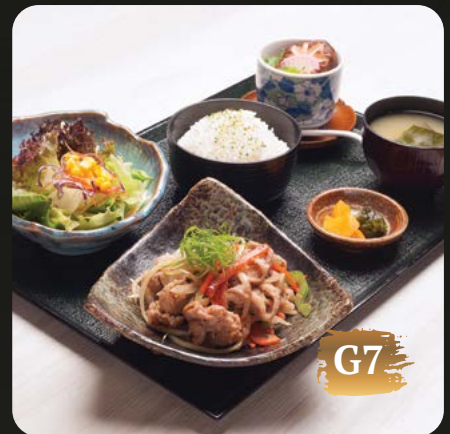
Bara Chirashi Gozen 18.00 Salad, Chawanmushi, Vegetables with Seafood Rice Bowl and Soup