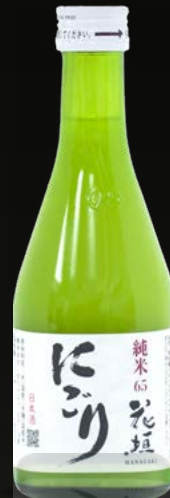
Hanagaki Junmai Nigori