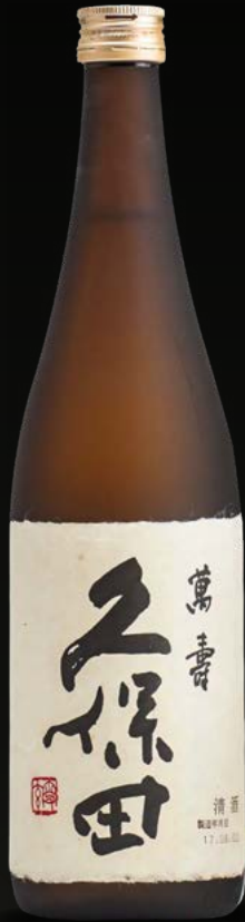
Kubota Manju Junmai Dai Ginjo