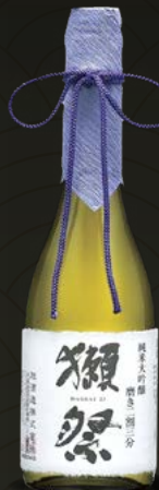
Dassai Junmai Daiginjo Migaki Niwari Sanbu 23