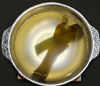
CLEAR KOMBU SHABU SHABU