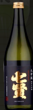
Shichiken Onakaya Junmai Dai Ginjo