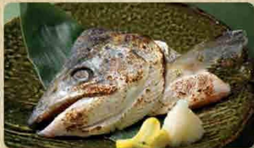
Sake Kabuto Shioyaki / Teriyaki 鮭兜塩焼き/照り焼き Charcoal-grilled salmon head with sea salt or teriyaki sauce 13.6