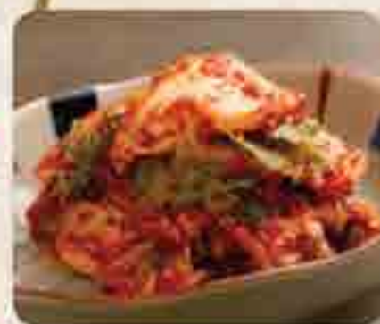
Kimuchi キムチ Spicy pickled Korean cabbage 5.8