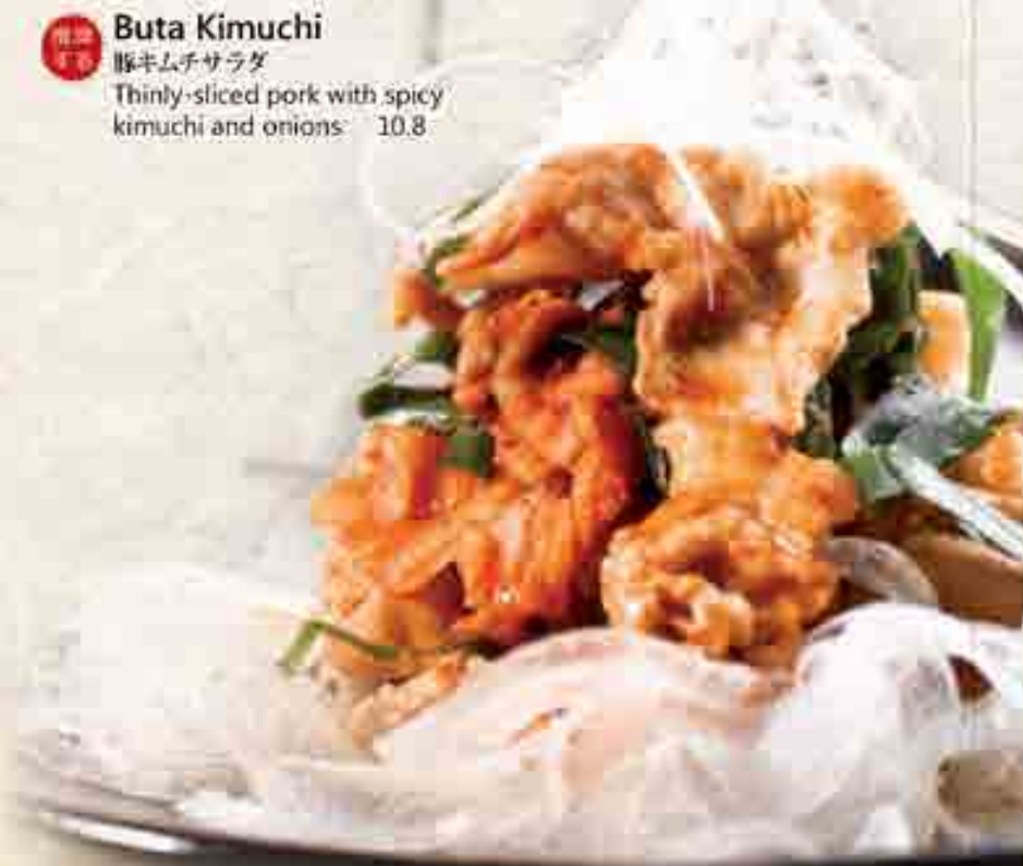
Buta Kimuchi 豚キムチサラダ Thinly-sliced pork with spicy kimuchi and onions 10.8