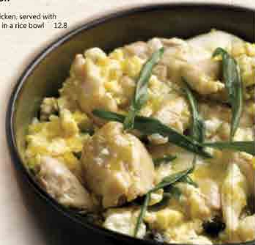
Oyako Don 親子丼 Pan-fried chicken, served with savoury egg in a rice bowl 12.8