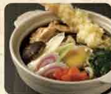
Nabeyaki Udon 鍋焼うどん 鶏 Japanese claypot noodles with prawn tempura, vegetables and chicken 15.8