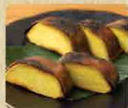
Lamb Persillade ラムチョップパシラ Charcoal-grilled lamb chop with parsley, breadcrumbs and mustard 16.8