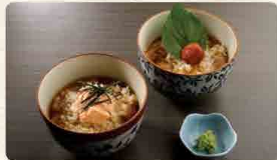
Sake Chazuke 鮭茶漬け Salmon flakes with rice in hot broth 6.6