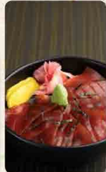
Maguro Zuke Don (Bluefin) 鮪漬け丼 Marinated bluefin tuna sashimi in a sushi rice bowl 17.8