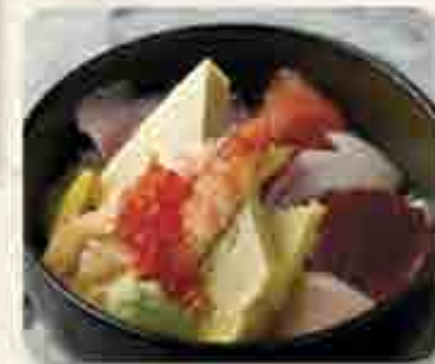
Shin Chirashi 心散し寿司 Premium sashimi selection in a sushi rice bowl 23.8