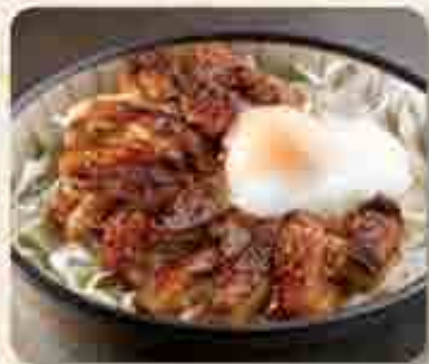
Tori Shogayaki Don 鶏生姜焼き丼 Pan-fried chicken thigh, soft egg with soy-ginger sauce, in a rice bowl 13.8