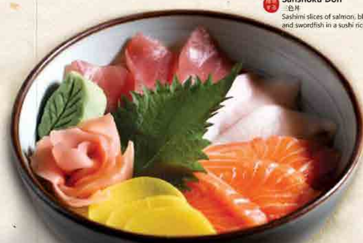
Sanshoku Don 三色丼 Sashimi slices of salmon, bluefin tuna and swordfish in a sushi rice bowl 17.8