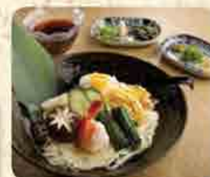
Cold Somen 冷しそうめん Chilled ultra-thin noodles, prawn, shiitake and dipping sauce 14.2