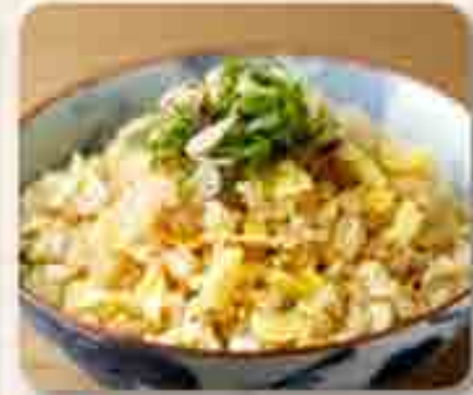
Garlic Fried Rice ガーリックライス Fragrant garlic fried rice with spring onions 4.8