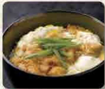
Ton Katsu Don 豚カツ丼 Breaded pork loin, deep-fried with egg, in a rice bowl 14.8