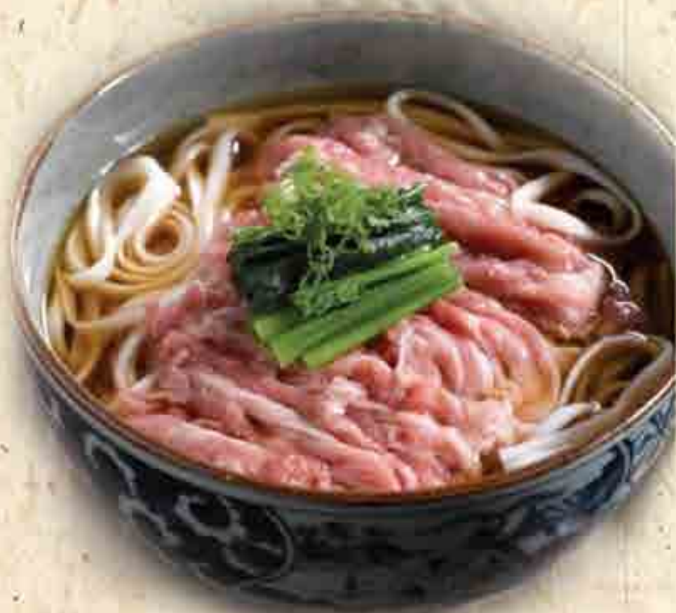
Beef Inaniwa Udon 牛稲庭うどん Thinly-sliced beef with premium hand-cut thin udon, in a rich broth 17.8