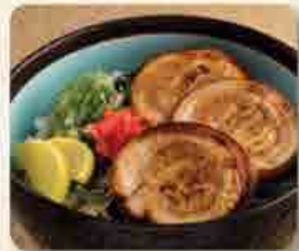
Chashu Kabayaki Don チャーシュー丼 Charcoal-grilled pork loin with kabayaki sauce, in a rice bowl 14.2