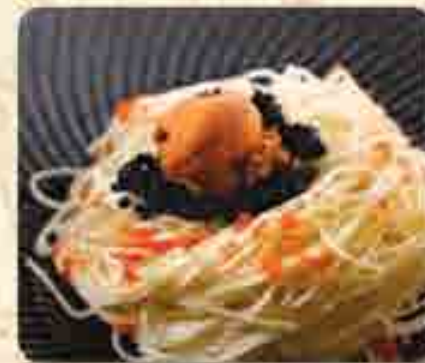
Shin Truffle-infused Uni Pasta トリュフ風味の雲丹パスタ 心スタイル Chilled angel hair pasta with truffle oil (Limited orders) 12.8 with Scallop sashimi 20.8 with Uni sashimi 26.8

Somen - Very thin silky white noodles best enjoyed chilled.