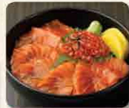
Salmon Ikura Don サーモンいくら丼 Salmon sashimi and salmon roe in a sushi rice bowl 17.8