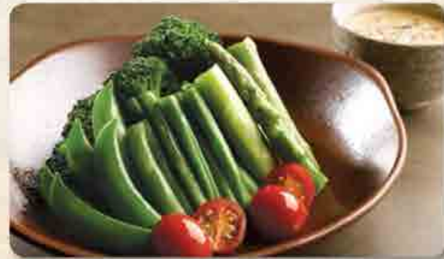
Shin Goma Salad 心ごまサラダ Broccoli, asparagus, french beans, sweet peas, tomatoes with sesame dressing, served chilled 12.8