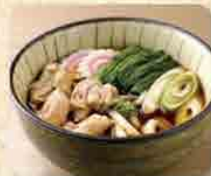
Tori Nanban Udon / Soba 鶏南蛮うどん/蕎麦 Japanese noodles with chicken and vegetables 13.8