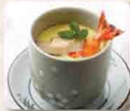
Shin Chawanmushi 心茶碗蒸し Japanese-style egg custard 4.8