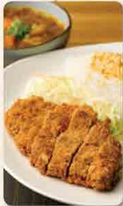
Ton Katsu Curry Don 豚カツカレーライス Deep-fried pork loin with Japanese curry, rice and cabbage salad 16.8