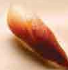
Hotate 生帆立 Hokkaido scallop 4.6