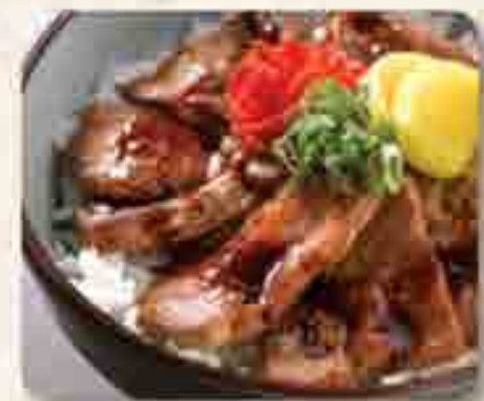
Buta Don 豚丼 Pan-seared pork fillet with kabayaki sauce in a rice bowl 14.8