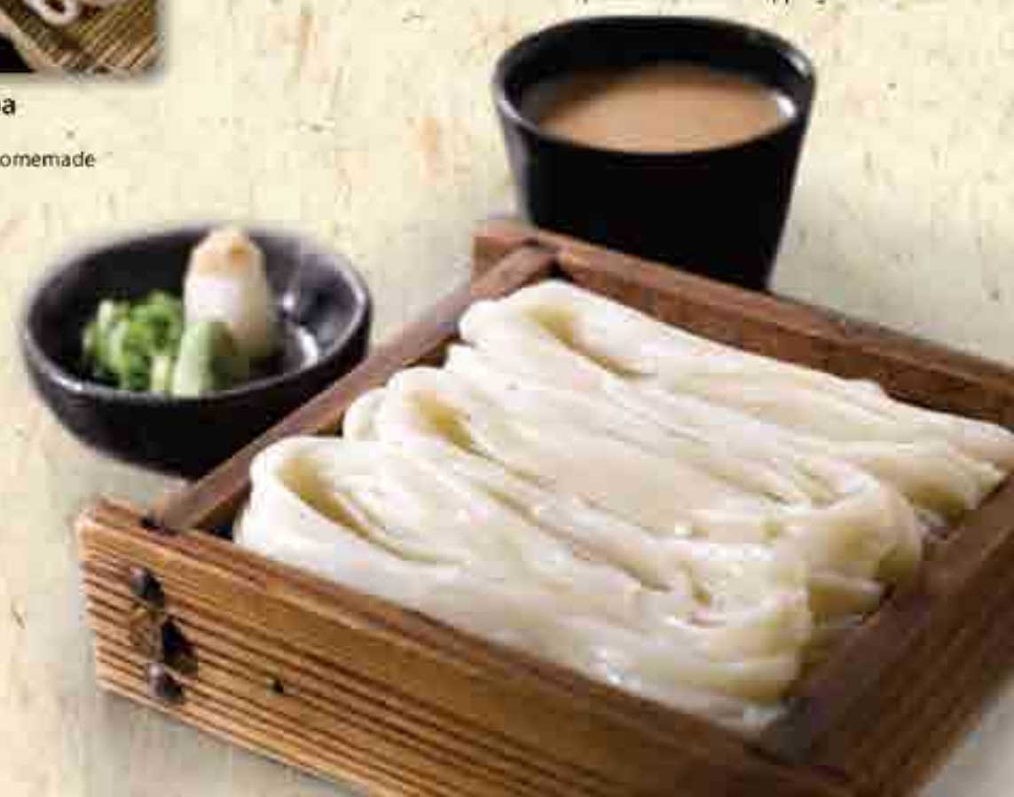
Tosei Inaniwa Udon 渡世稲庭うどん Premium hand-cut thin udon served chilled, with special duck broth dipping sauce 13.8