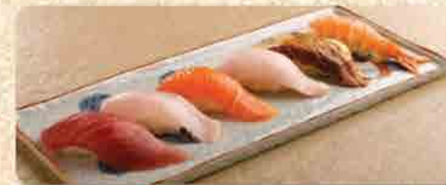
Sushi Favourites 寿司盛合せ Selection of bluefin tuna, yellowtail, salmon, swordfish, grilled eel and cooked prawn (1 pc each) 17.2