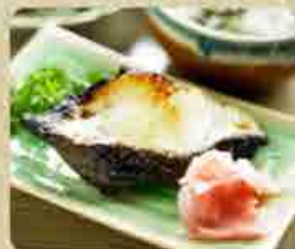
Gindara Teriyaki ぎんだら照り焼き Charcoal-grilled Atlantic cod with homemade teriyaki sauce 19.8