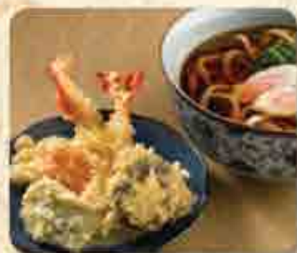
Tempura Udon 天婦羅うどん Assorted tempura with Japanese noodles in a light broth 17.8

Our noodles are imported directly from Japan