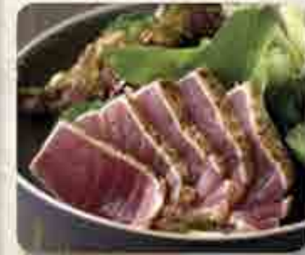
Black Pepper Maguro Salad 黒胡椒マグロの焼たたきサラダ Seared tuna sashimi, black pepper, greens with ponzu dressing 17.6