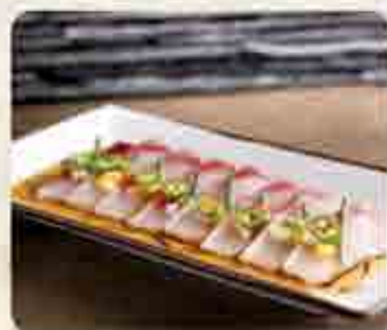
Hamachi Carpaccio はまちカルパッチョ Yellowtail sashimi with homemade yuzu dressing 17.8