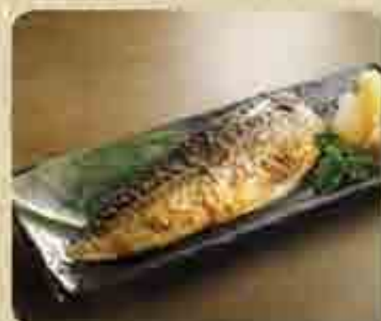
Tosei Saba Yaki 銚子鯖焼き Charcoal-grilled lightly marinated Japanese mackerel 12.8