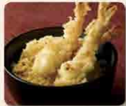
Ebi Tamago Don 海老玉丼 Tempura prawns with savoury egg, in a rice bowl 15.8