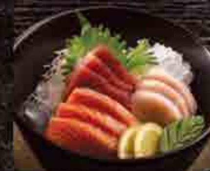
Trio of Sashimi Favourites 鮮魚刺身本盛合せ Platter of salmon, bluefin tuna and swordfish (3 slices each) 24.6