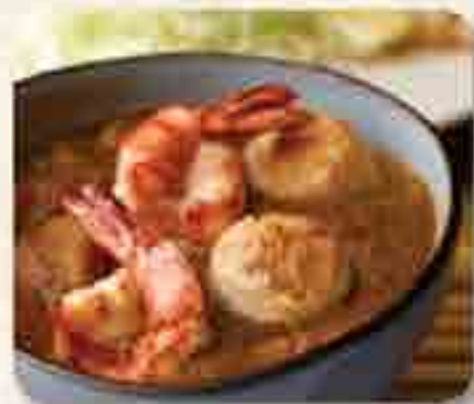
Seafood Curry Don シーフードカレーライス Homemade Japanese seafood curry with rice and salad 18.6