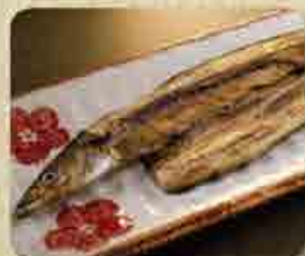
Sanma Hiraki 秋刀魚ひらき Charcoal-grilled air-dried Pacific saury from Japan (slightly salty) 15.6