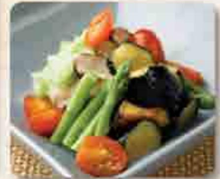
Warm Mixed Salad 温野菜サラダ Warm vegetable salad with ponzu dressing 12.2