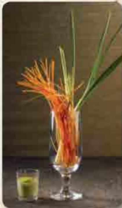
Inaniwa Sticks 稲庭うどんスティック Savoury deep-fried thin udon with wasabi mayonnaise 6.6

"Food from the Heart" is what our chefs sincerely believe.