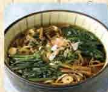
Sansai Udon / Soba 山菜うどん/蕎麦 Japanese noodles with wild vegetables in broth 12.8