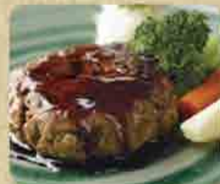
Wagyu Hamburg 和風ハンバーグ Charcoal-grilled wagyu patty with wafu sauce and vegetables 19.6