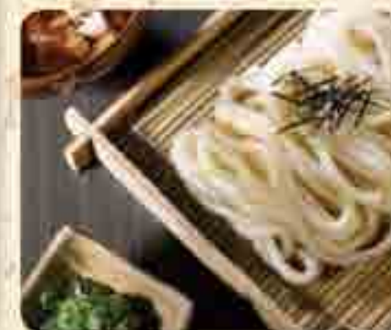
Zaru Udon / Soba ざるうどん/蕎麦 Chilled noodles with homemade dipping sauce 8.8