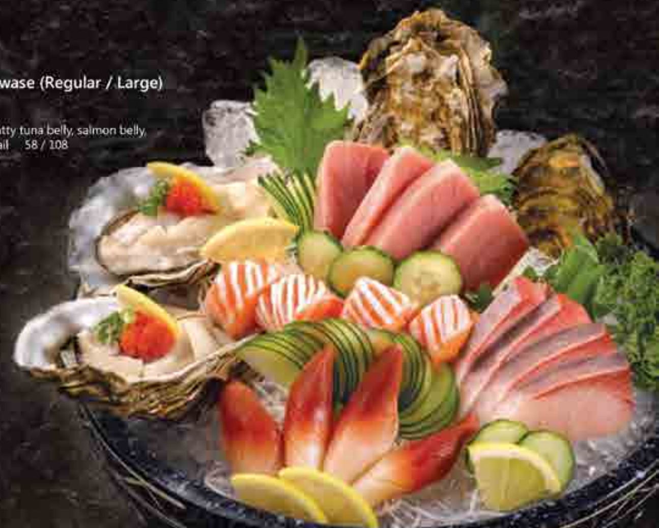
Premium Sashimi Moriawase (Regular / Large) (5 premium types) スペシャル刺身盛合せ Premium selection of premium fatty tuna belly, salmon belly, live oyster, surf clam and yellowtail 58 / 108