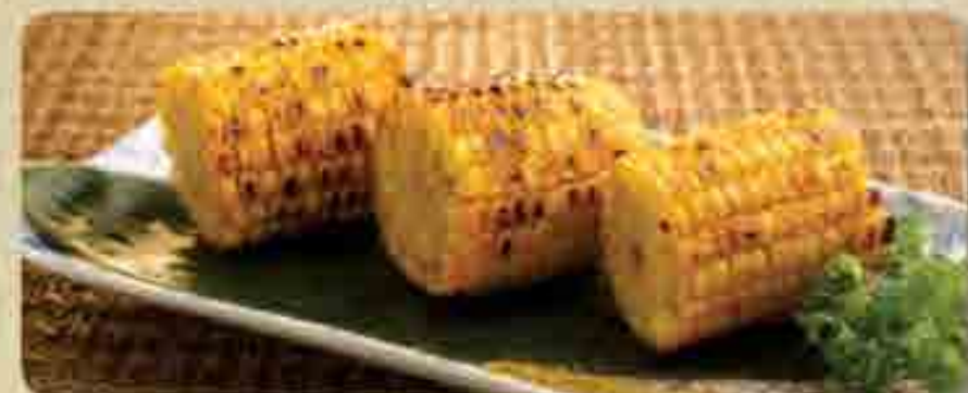
Toumorokoshi Shoyu Yaki トウモロコシ醤油焼き Charcoal-grilled corn on the cob with soy dressing 6.8