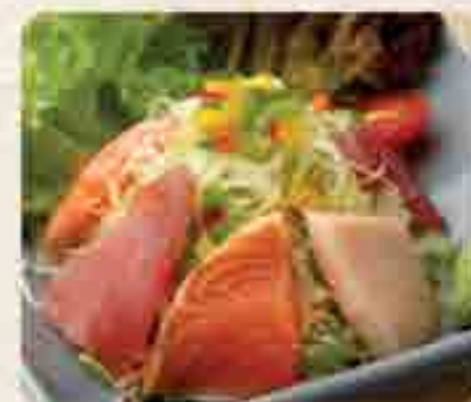
Sashimi Salad 刺身サラダ Assorted sashimi on fresh salad greens with ponzu dressing 17.8