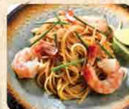
Spicy Prawn Pasta スパイシー海老パスタ Fresh sea prawns pasta infused with spicy prawn stock 15.4