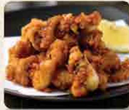
Tako Fry 蛸フライ Deep-fried tasty octopus and squid with mayonnaise 10.8