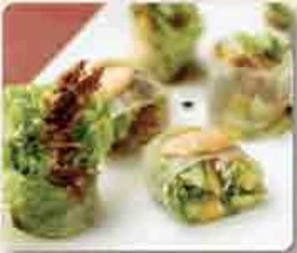
Soft Shell Crab Salad Roll ソフトシェルクラブとサラダの生春巻き Deep-fried soft-shell crab, avocado, asparagus and mango in a roll 12.8