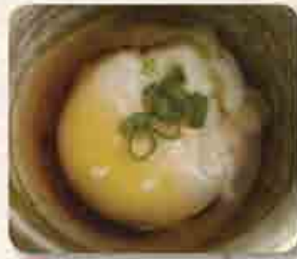
Onsen Tamago 温泉玉子 Lightly poached egg served chilled in a light broth 3.8