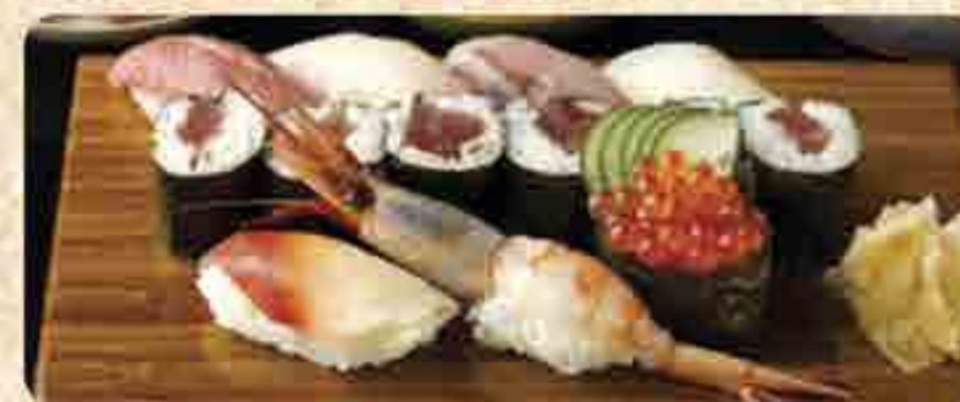
Premium Sushi Selection プレミアム寿司セット Premium sushi selection of premium bluefin tuna belly, yellowtail, salmon belly, sweet prawn, surf clam, salmon roe, swordfish and tuna roll 34.2