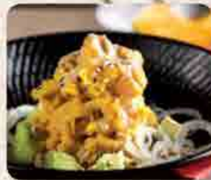
Roast Pumpkin ローストパンプキンサラダ Roasted pumpkin with avocado and sesame dressing 6.8