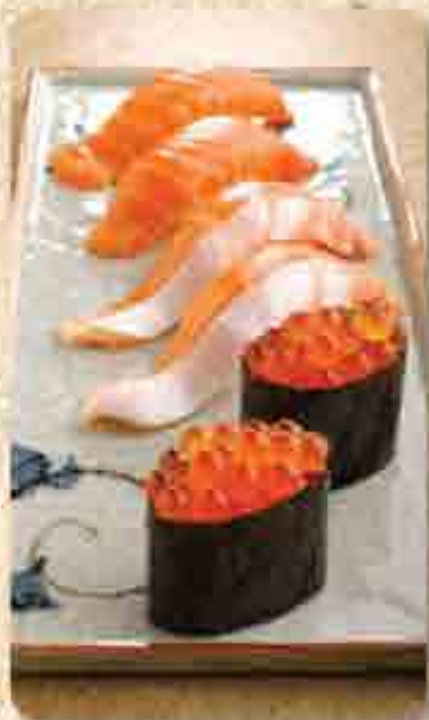
Salmon Sushi Overload 鮭寿司セレクション Selection of salmon, salmon belly, and salmon roe sushi (2 pcs each) 18.8

Our sushi rice is made from Japanese grains, and flavoured with our special blend of vinegar, seaweed, sour plum, salt and sugar.