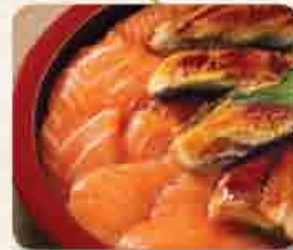
Unagi and Salmon Don 鮭炙り鰻丼 Salmon and sea eel with kabayaki sauce in a sushi rice bowl 19.2