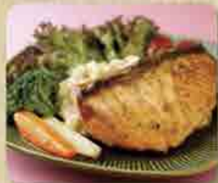
Sake Butteryaki 鮭バター焼き Norwegian salmon fillet with butter sauce, served with potato salad 17.2