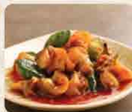
Spicy Tsubugai 辛いつぶ貝 Japanese top-shell in spicy sauce 9.6