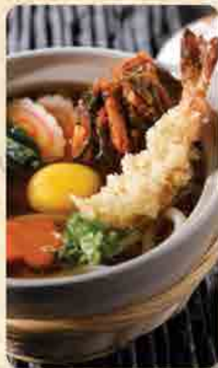
Kimuchi Nabe Udon キムチ鍋焼うどん Japanese claypot noodles in a spicy kimuchi stock 17.6