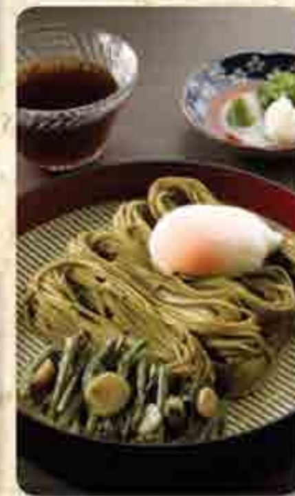
Hiyashi Onsen Cha Soba 冷し温泉玉子茶蕎麦 Green-tea noodles with wild vegetables and egg in a cold broth 13.6