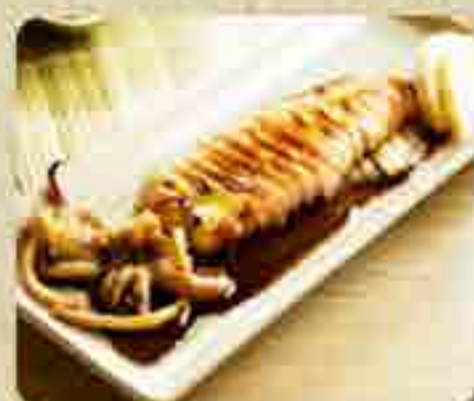
Ika Sugatayaki いか姿焼き Charcoal-grilled whole squid with teriyaki sauce 14.8