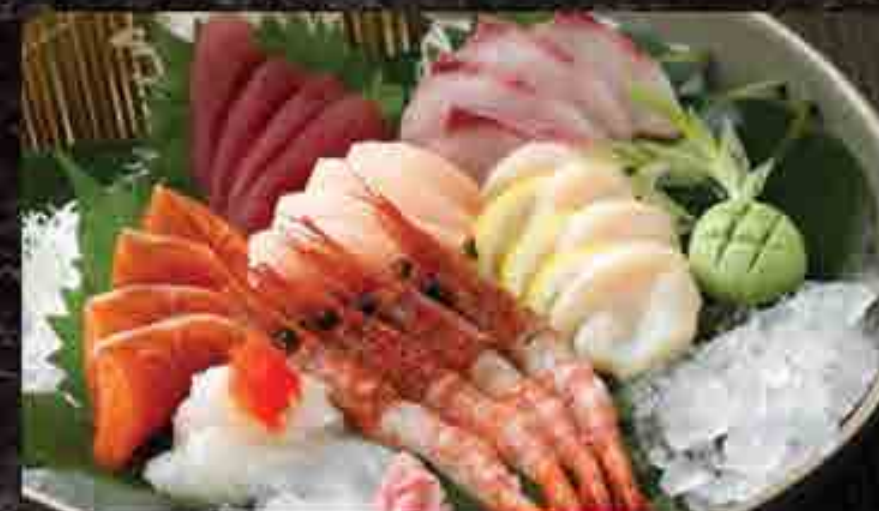
Sashimi Moriawase Large (7 types) 刺身盛合せ(大) Assorted sashimi platter of salmon, bluefin tuna, swordfish, yellowtail, Hokkaido squid, sweet prawn and Hokkaido scallop 86