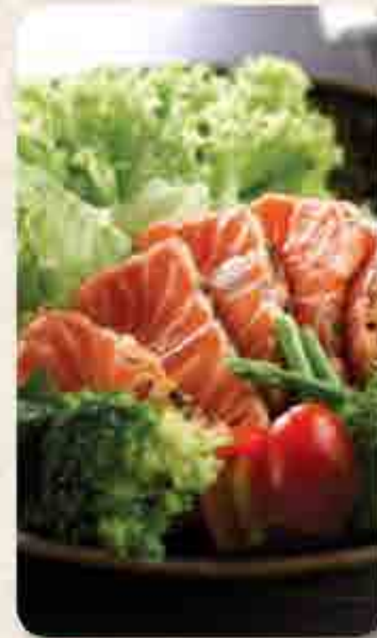
Flamed Salmon Salad 焼き鮭サラダ Seared salmon sashimi, greens with ponzu dressing 16.8