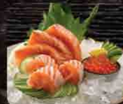
Sake Overload 鮭セレクション Platter of salmon belly, salmon and salmon roe (3 slices each) 22.6