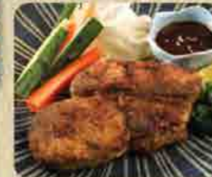
U.S. Kurobuta Pork Chop U.S. 黒豚ポークチョップ Charcoal-grilled U.S. Kurobuta pork chop with citrus ponzu and mustard sauces 26.6