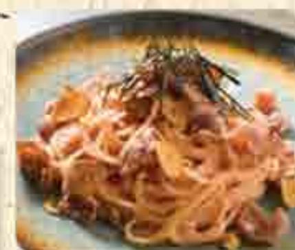
Mentaiko Pasta 明太子パスタ Pasta tossed with codfish roe, bacon and seaweed 16.6