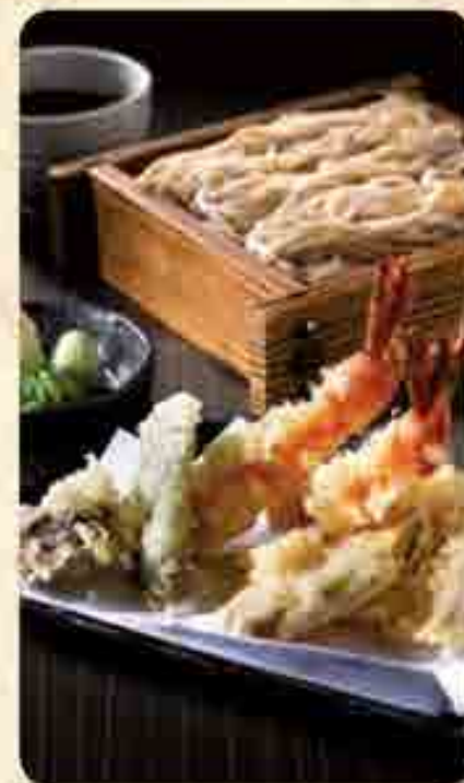
Tenzaru 天ざる Assorted tempura served with chilled buckwheat noodles 17.8