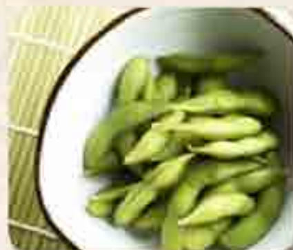
Edamame 枝豆 Soybeans in their pods 4.8