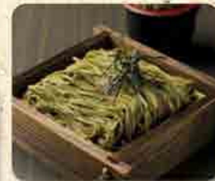
Cha Soba 茶蕎麦 Chilled green tea noodles with wild vegetables and egg in a cold broth 10.8