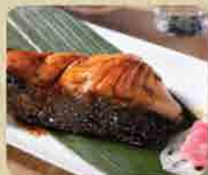
Sake Teriyaki 鮭照り焼き Charcoal-grilled salmon fillet with teriyaki sauce 14.8