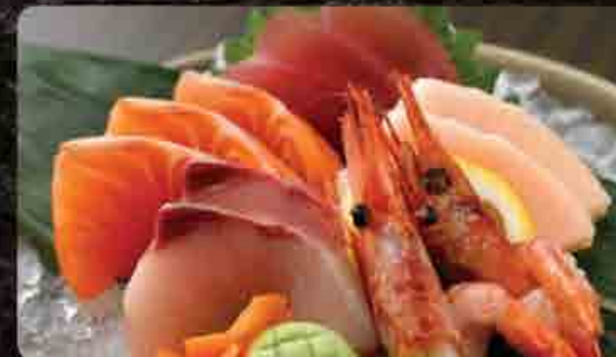
Sashimi Moriawase Regular (5 types) 刺身盛合せ(小) Sashimi platter of salmon, bluefin tuna, swordfish, yellowtail and sweet prawn 34.8