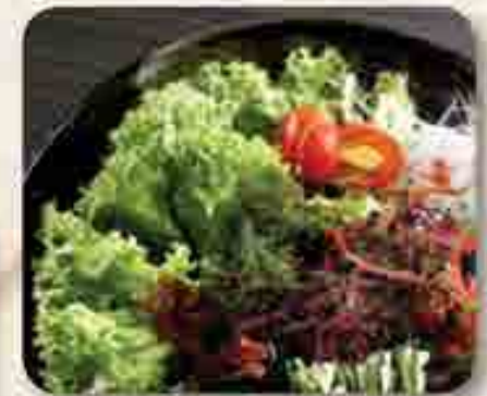
Kaiso Salad 海草サラダ Fresh greens and Japanese seaweed with soy dressing 10.8