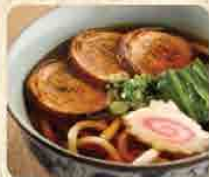
Chashu Udon / Soba チャーシューうどん/蕎麦 Japanese noodles with grilled pork loin in a rich broth 14.6