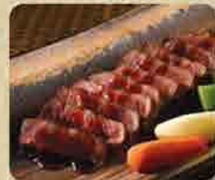
Chashu チャーシュー Charcoal-grilled pork fillet with mustard and sliced leek 15.8