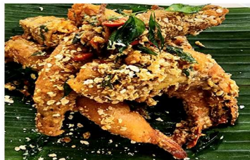
CEREAL PRAWN (5 PCS) $25.90