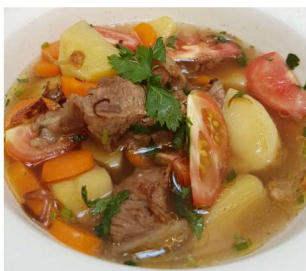
BEEF SOUP $14.90