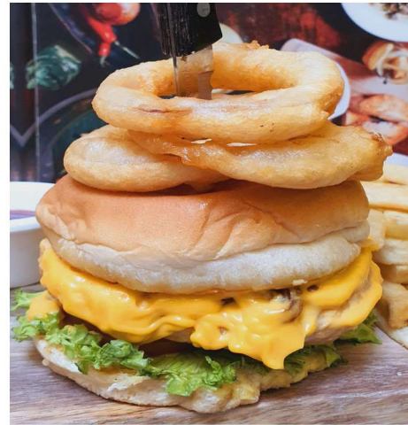
Bussorah Chicken Burger $16.90

160gm mouth-watering juicy beef patty topped with lettuce, tomato, caramelized onion & cheese in a brioche bun served with crispy fries/onion rings and chilli sauce