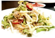
MIXED VEGETABLES $4.50