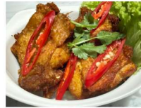
AYAM GORENG $6.50