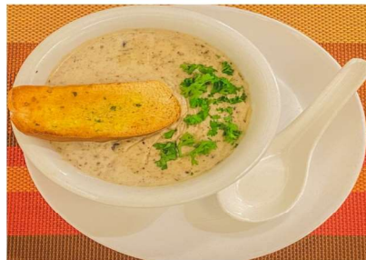
MUSHROOM SOUP $10.90