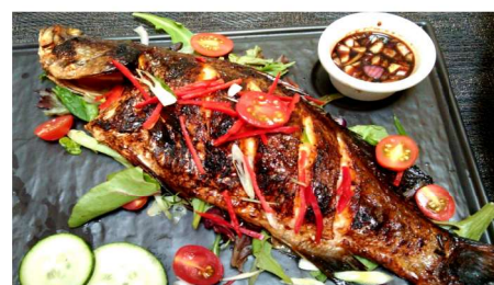
GRILLED SEABASS $35.90