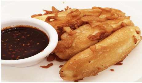
PISANG GORENG $5.50 with kicap cili api