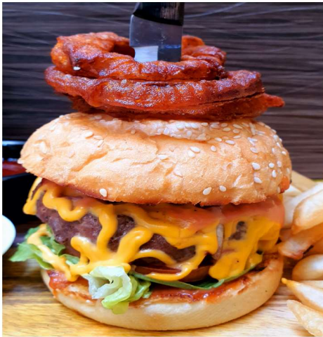
Classic Temasek Burger $18.90

Slices of beef pepperoni topped onto mozzarella and pizza sauce