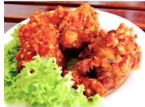
AYAM BELADO $6.90