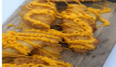
PISANG GORENG CHEESE $8.50