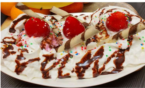
PISANG GORENG SPLIT $17.90 with vanilla ice cream topped with whipped cream, chocolate syrup and cherries