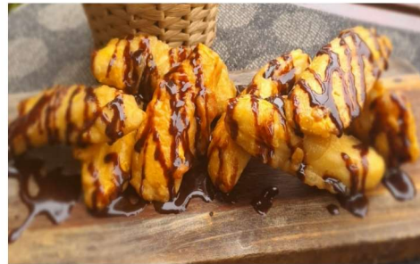
PISANG GORENG CHOCOLATE $8.50