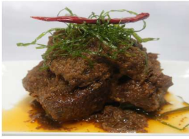
BEEF RENDANG $7.90