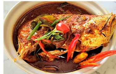
ASAM PEDAS CLAYPOT $38.90