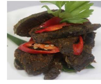
PARU BEREMPAH $4.50