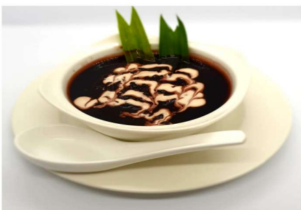
BUBUR PULUT HITAM $6.50