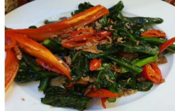
KAILAN SALTED FISH $14.90