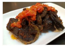
PARU BELADO $6.90