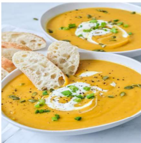
PUMPKIN SOUP $10.90

Served with mixed green salad, arugula, onions, cherry tomatoes & olives with vinaigrette