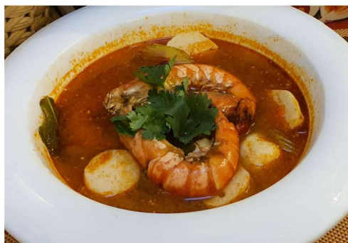
TOMYAM PRAWN $17.90