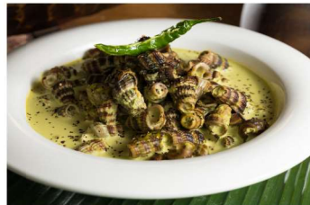
SIPUT SEDUT $8.90(S) $12.90(M) $18.90(L)