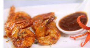
SAMBAL UDANG $7.90(S) $11.90(M) $14.90(L)