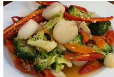
SCALLOP BROCCOLI $16.90