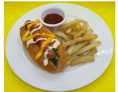
Glizzy Bun $11.90

served with roasted minced beef, rich tomato gravy, garnished with parmesan cheese & iced lemon tea