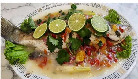
STEAM FISH A-LA THAI $35.90