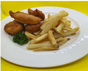
Mini Fish & Chips $12.90

golden brown fillet served with crispy fries, tartar sauce & iced lemon tea