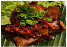
SAMBAL SOTONG $6.90