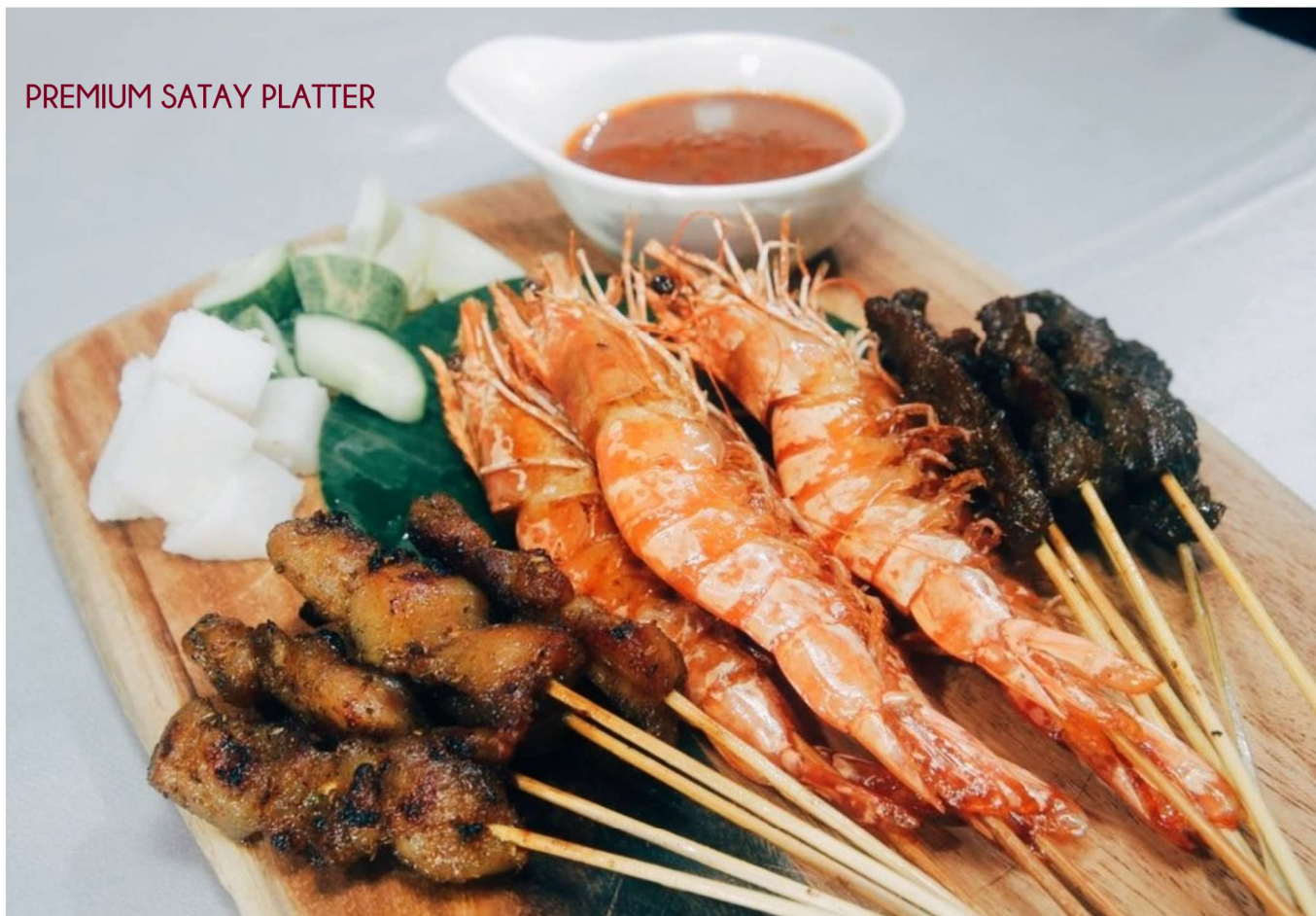
PREMIUM SATAY PLATTER