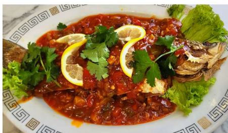
IKAN TIGA RASA $35.90