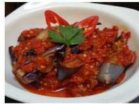
TERONG BELADO $5.90