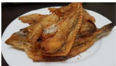
SALTED FISH $5.50