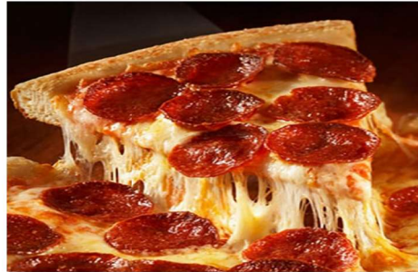
Pepperoni Pizza $17.90

Pizza topped with tomato sauce, cheese, pineapple and ham