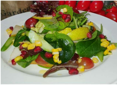
PADI GARDEN SALAD