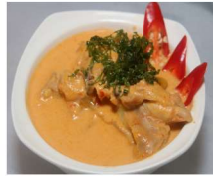
AYAM LEMAK $6.90