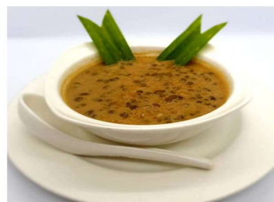
BUBUR KACANG $6.50