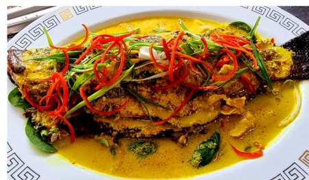
IKAN SALAI LEMAK API $35.90