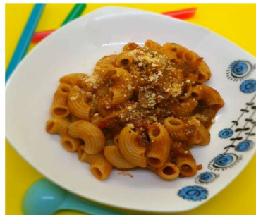
Kids Mac Bolognese $10.90

golden brown fillet served with crispy fries, tartar sauce & iced lemon tea