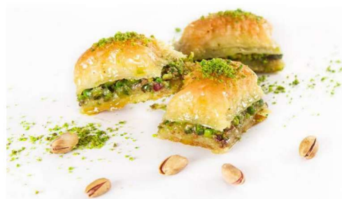
BAKLAVA (3PCS) $11.90