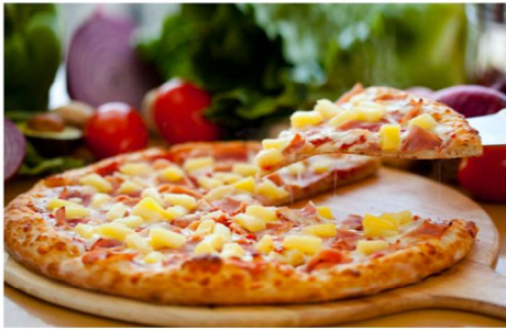
Hawaiian Pizza $17.90

Pizza topped with tomato sauce, cheese, pineapple and ham