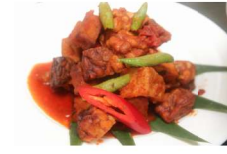
SAMBAL GORENG $4.00