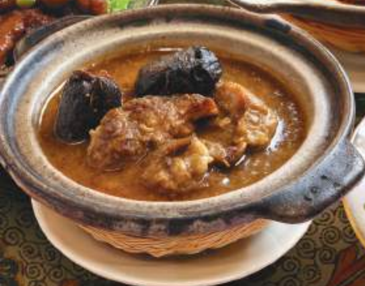
AYAM BUAH KELUAK