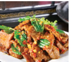
BF01 Stir Fry Basil Sliced Beef 泰式罗勒叶牛肉片 $10.90