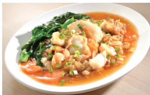
ND06 Seafood Hor Fun 泰式海鲜河粉 $7.90