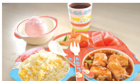
KM04 Set D - Fried Rice, Tofu with Minced Chicken, Mix Vegetables, Fruits, Drinks, Ice Cream 炒饭、鸡肉碎豆腐、杂锦蔬菜、水果、饮料、雪糕 $8.50