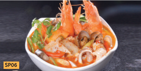
SP06 TOM YUM SOUP 东炎汤