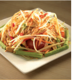
SL02 Thai Papaya Salad 泰式青木瓜沙律 $5.90