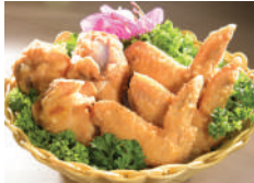
AP02 Prawn Paste Chicken (2pcs) 酥炸虾酱鸡翅 $4.90