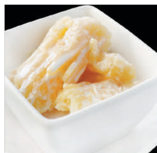
DS05 Tapioca with Coconut Sauce 椰奶木薯糕 $3.20