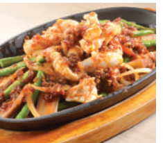
SE01 Hotplate Sambal Squid 铁板叁巴炒鲜鱿 $11.90