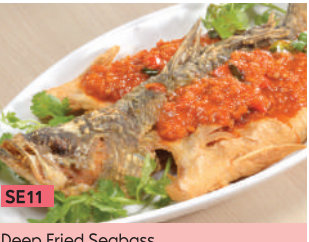
SE11 Deep Fried Seabass 酥炸金目鲈 $24.90