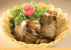
AP03 Pandan Chicken (2pcs) 泰式香兰鸡块 $4.90