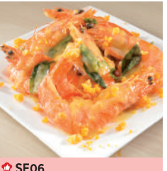
SE06 Salted Egg Butter Cream Prawn 咸蛋奶油柠檬虾 $11.90