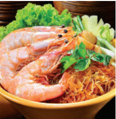
SE07 Glass Noodle Prawn 冬粉虾 $11.90