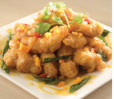
CK05 Salted Egg Butter Cream Chicken 咸蛋奶油柠檬鸡丁 $8.50