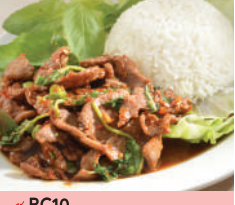
RC10 Hot Basil Beef Rice 罗勒叶炒牛肉片饭 $7.90