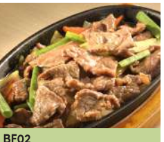
BF02 Hotplate Spring Onion & Ginger Beef 铁板姜葱牛肉片 $10.90