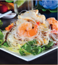
SL03 Seafood Glass Noodle Salad 泰式海鲜冬粉沙律 $7.50