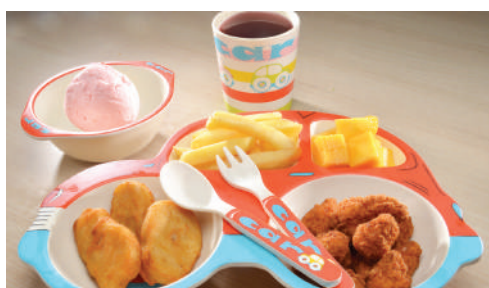
KM01 Set A - Chicken Nugget, Chicken Popcorn, Fries, Fruits, Drinks, Ice Cream 酥炸鸡肉块、鸡肉爆米花、炸薯条、水果、饮料、雪糕 $8.50