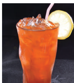
BV03 Thai Lemon Tea 泰式柠檬茶 $4.40