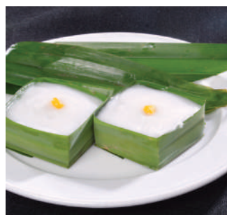
DS02 Tako (2pcs) 泰式椰子糕 (2粒) $3.20