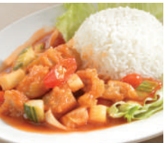
RC06 Sweet & Sour Chicken Rice 酸甜鸡丁饭 $7.20