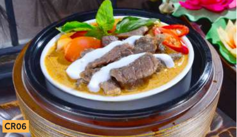
CR05 RED CURRY 泰式红咖喱