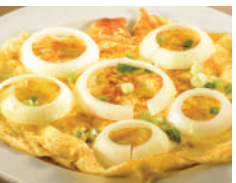
OM02 Onion Omelette 洋葱煎蛋 $7.20