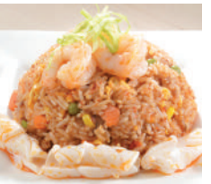
RC04 Sambal Seafood Fried Rice 海鲜叁巴炒饭 $7.50