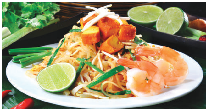
ND01 Phad Thai with Prawn 泰式传统鲜虾炒粿条 $7.90