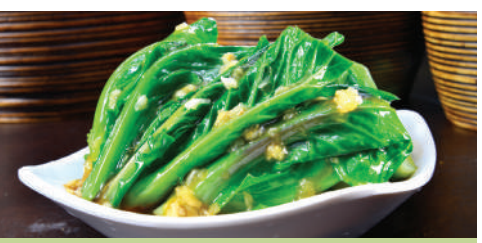
VG01 Baby Kailan with Oyster Sauce 泰国小芥兰 $7.20