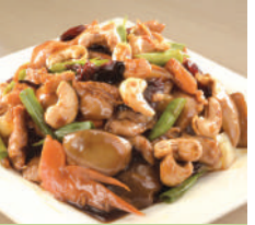
CK02 Stir Fry Cashew Nut Chicken 爆炒腰豆宫保鸡丁 $8.20