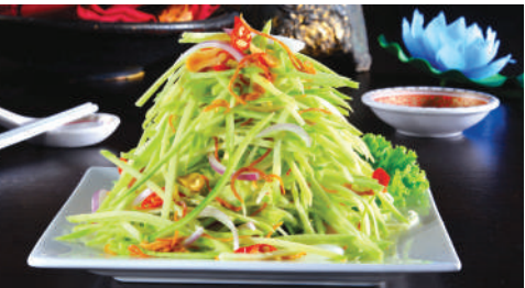
SL01 Thai Mango Salad 泰式青芒果沙律 $5.90