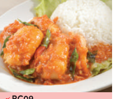
RC09 Thai Chilli Fish Rice 泰式三味鱼片饭 $7.90