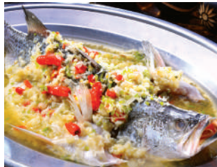
SE13 Steamed Seabass with Spicy Lemon Sauce 泰式香辣柠檬蒸金目鲈 $24.90