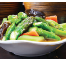
VG04 Stir Fry Mixed Vegetables 杂锦炒蔬菜 $7.20