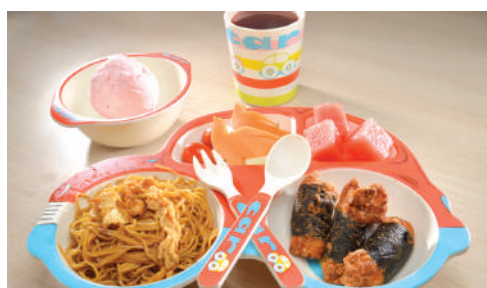
KM02 Set B - Fried Egg Noodle, Seaweed Chicken, Mix Vegetables, Fruits, Drinks, Ice Cream 香炒鸡蛋面、紫菜鸡肉块、杂锦蔬菜、水果、饮料、雪糕 $8.50