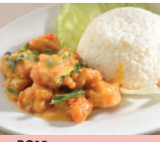
RC05 Salted Egg Butter Cream Chicken Rice 咸蛋奶油柠檬鸡丁饭 $7.50