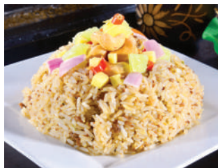
RC02 Thai Olive Fried Rice 泰式橄榄炒饭 $7.20