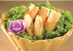
AP01 Deep Fried Spring Roll (4pcs) 泰式素菜卷 $3.20