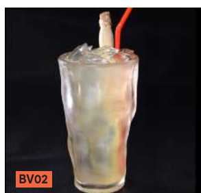
BV02 Thai Lemongrass 泰式香茅茶 $4.40