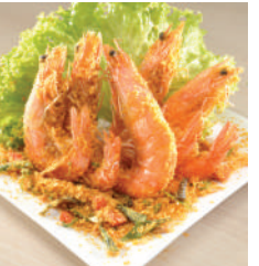
SE05 Cereal Prawn 黄金麦片虾 $11.90