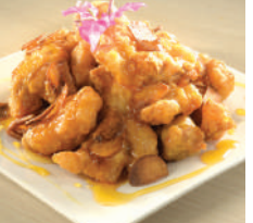
CK04 Honey Chicken 泰式蜜汁鸡丁 $8.20