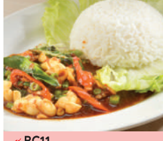
RC11 Hot Basil Squid Rice 罗勒叶炒鲜鱿饭 $7.90