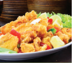
CK03 Sweet & Sour Chicken 酸甜鸡丁 $8.20