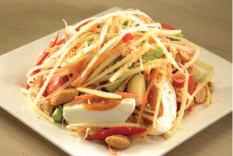
SL04 Papaya Salad with Salted Egg 泰式咸蛋青木瓜沙律 $7.50