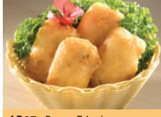
AP07 Deep Fried Seafood Tofu (3pcs) 招牌酥炸海鲜豆腐 $4.90