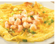
OM01 Prawn Omelette 鲜虾煎蛋 $7.90