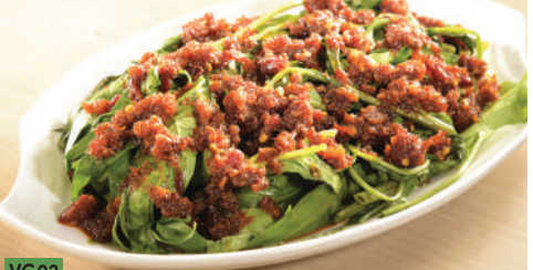
VG02 Stir Fry Sambal 马来风光 $7.20