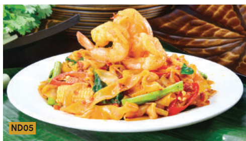
ND05 Jungle Kway Teow 泰式炒粿条 $7.90