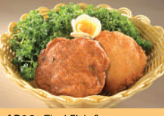
AP06 Thai Fish & Prawn Cake (2pcs) 泰式炸鱼和虾饼 $4.90