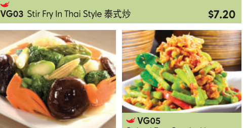
VG03 Stir Fry In Thai Style 泰式炒 $7.20