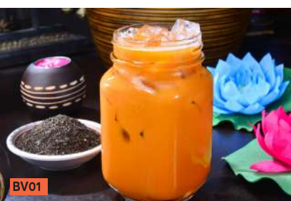
BV01 Thai Milk Tea 泰式奶茶 $4.40