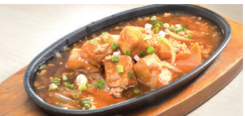
TF02 Hotplate Tofu with Minced Chicken 铁板鸡肉碎招牌豆腐 $7.90