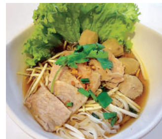
ND08 Rice Noodle 泰国糯米条 $7.90