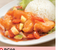
RC08 Sweet & Sour Fish Rice 酸甜鱼片饭 $7.90