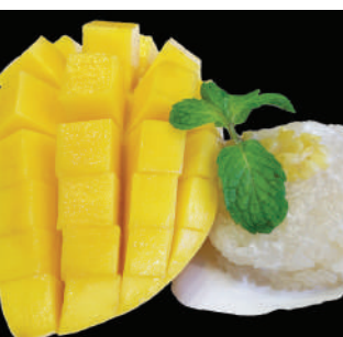
DS01 Mango Sticky Rice (per portion) 芒果糯米饭 (每份) $5.50