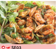
SE03 Stir Fry Flower Clam with Sweet Basil Leaves 泰式罗勒叶炒啦啦 $11.90