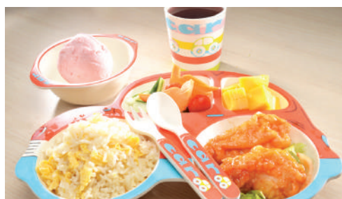
KM03 Set C - Fried Rice, Sweet & Sour Fish, Mix Vegetables, Fruits, Drinks, Ice Cream 炒饭、酸甜鱼、杂锦蔬菜、水果、饮料、雪糕 $8.50