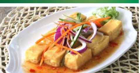
TF01 Deep Fried Tofu with Thai Salad 酥炸泰式沙律招牌豆腐 $7.90