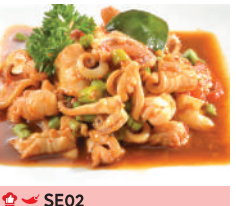
SE02 Stir Fry Squid with Hot Basil Leaves 泰式罗勒叶炒鲜鱿 $11.90