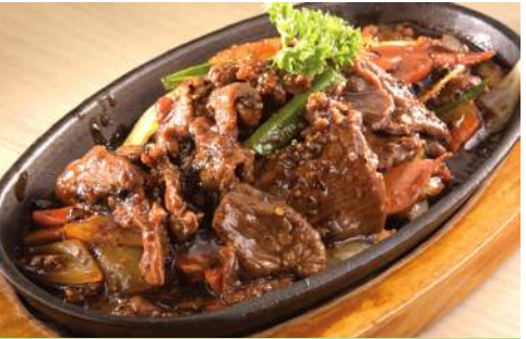
BF03 Hotplate Black Pepper Beef 铁板黑椒炒牛肉片 $10.90