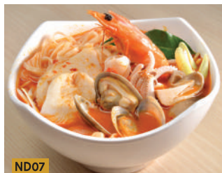
ND07 Tom Yum Seafood Noodle Soup 泰式海鲜东炎汤面 $7.90