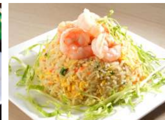
RC03 Prawn Fried Rice 鲜虾黄金炒饭 $7.50