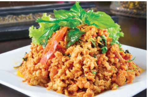
CK01 Stir Fry Hot Basil Minced Chicken 泰式罗勒叶鸡肉碎 $8.50