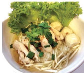
ND09 Fishball Beef Noodles 鱼丸牛肉面 $7.90