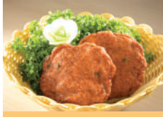
AP04 Thai Fish Cake (2pcs) 泰式炸鱼饼 $4.90