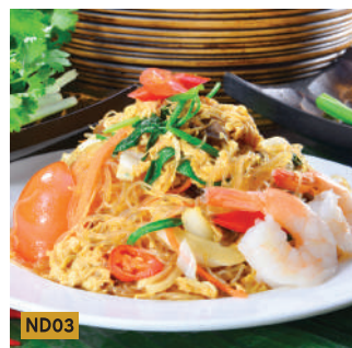
ND03 Stir Fry Glass Noodle 泰式炒冬粉 $7.90