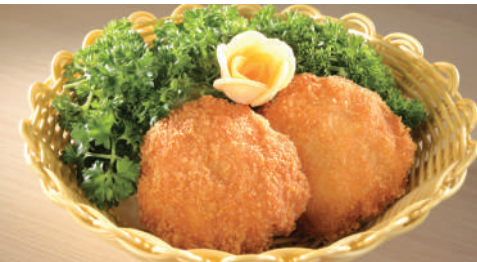
AP05 Thai Prawn Cake (2pcs) 泰式炸虾饼 $4.90