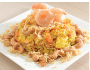
RC01 Pineapple Fried Rice 泰式黄梨炒饭 $7.50