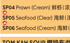
SP08 TOM YUM SOUP 东炎汤