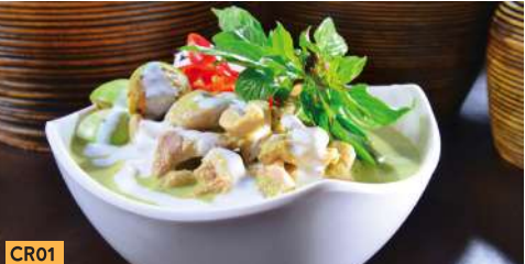
CR01 GREEN CURRY 泰式青咖喱