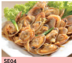
SE04 Stir Fry Spring Onion & Ginger Flower Clam 泰式爆炒姜葱啦啦 $11.90