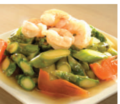
VG05 Salted Egg Sambal Long Bean with Chicken 泰式金沙香辣菜豆丁 $8.20