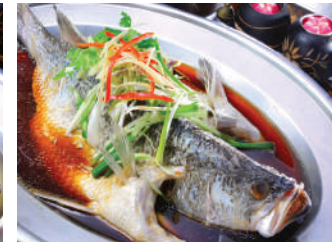
SE14 Steamed Seabass with Hong Kong Style 港式清蒸金目鲈 $24.90