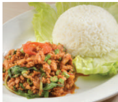
RC07 Hot Basil Chicken Rice 罗勒叶炒鸡肉碎饭 $7.20