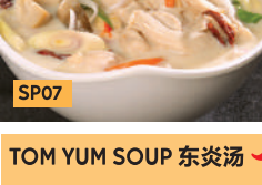
SP07 TOM KAH SOUP 椰奶东炎汤