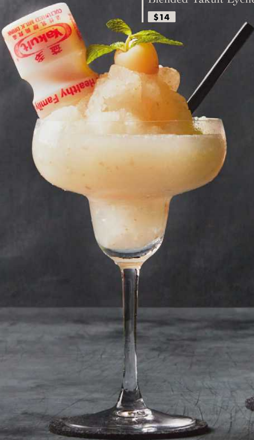
Blended Yakult Lychee