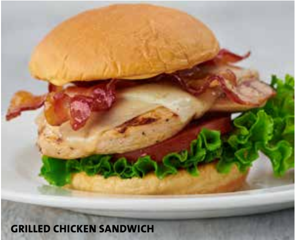
GRILLED CHICKEN SANDWICH