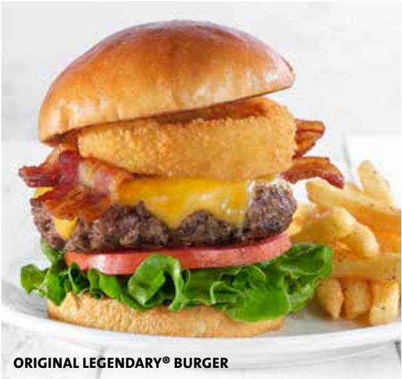
ORIGINAL LEGENDARY® BURGER

Two smashed & stacked burgers seasoned and seared to medium-well, with Monterey Jack cheese, pickled jalapeños, leaf lettuce, vine-ripened tomato and spicy mayonnaise (2,3,5,10,11) . *Δ €20.95