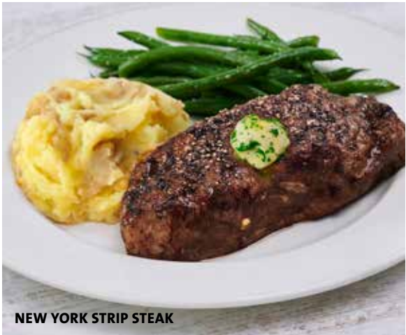
NEW YORK STRIP STEAK