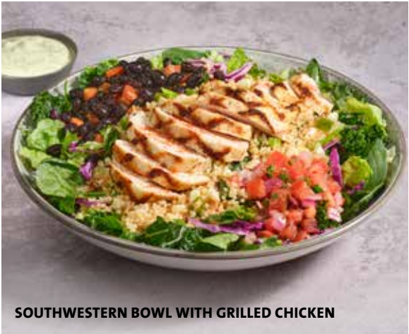
SOUTHWESTERN BOWL WITH GRILLED CHICKEN

Fresh romaine tossed in a classic Caesar dressing, topped with Parmesan crisps, croutons (5,6,11) and shaved Parmesan cheese.Δ €14.95