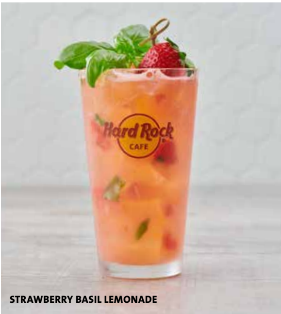
STRAWBERRY BASIL LEMONADE

A tropical blend of mangos, strawberries, pineapple juice, orange juice and house-made sour mix (8) topped with Sprite (2,6,8,10) . €10.35