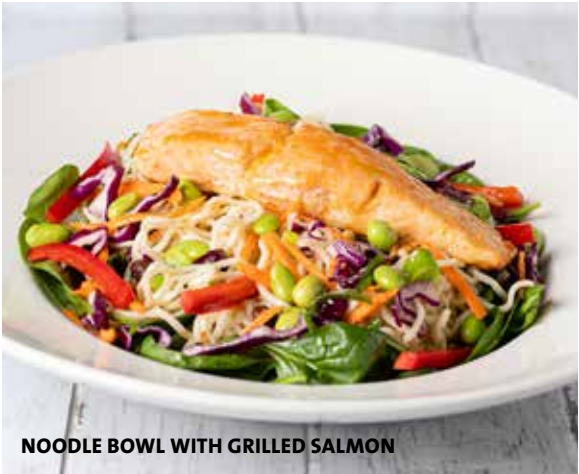
NOODLE BOWL WITH GRILLED SALMON