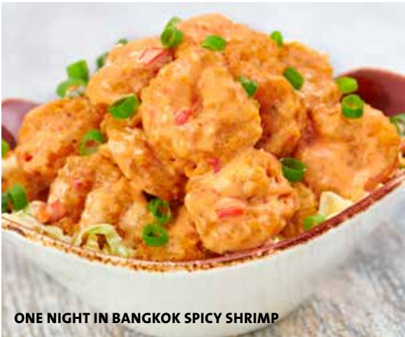
ONE NIGHT IN BANGKOK SPICY SHRIMP

Our signature slow-roasted wings finished either grilled or fried tossed in your choice of sauce and served with celery and blue cheese dressing (3,11) . Δ (GF-A) €14.95