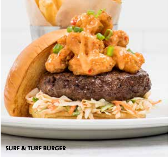
SURF & TURF BURGER