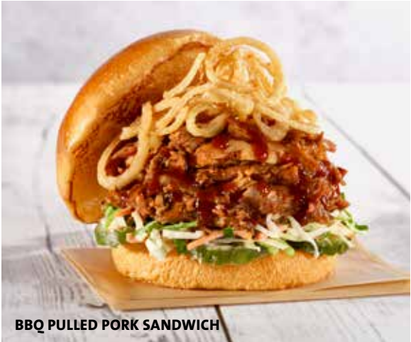
BBQ PULLED PORK SANDWICH

Grilled fresh chicken with melted Monterey Jack cheese, smoked bacon (2,3) , leaf lettuce and vine-ripened tomato, served on a fresh toasted bun with honey mustard (3,11) sauce.Δ €19.95