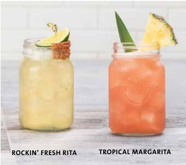
ROCKIN' FRESH RITA

A NYC classic originating in the 1800s. Bulleit Bourbon, sweet vermouth (3) , cherry bitters (19) and finished with a cherry garnish (2,5) . €11.95