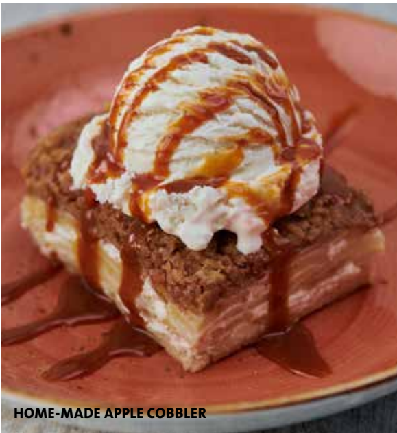
HOME-MADE APPLE COBBLER

Choose from Madagascar vanilla bean or rich chocolate. # €7.95