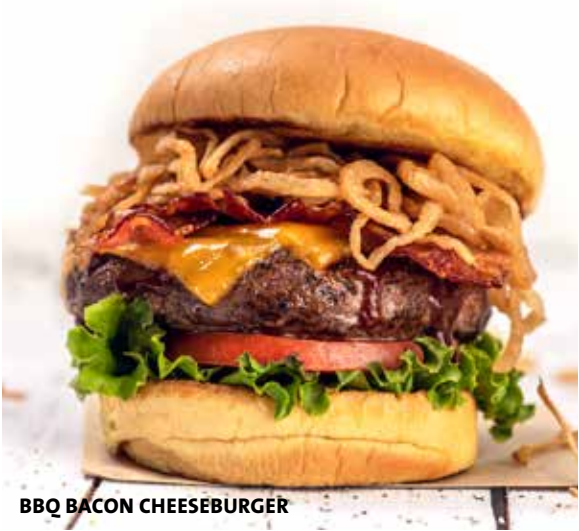
BBQ BACON CHEESEBURGER