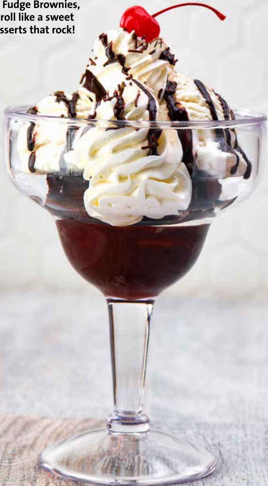
HOT FUDGE BROWNIE

From Cobbler to Hot Fudge Brownies, nothing says rock n' roll like a sweet encore. Cheers to desserts that rock!