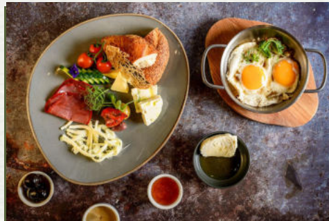
112-MADA TURKISH BREAKFAST

THREE JAMS, HONEY AND KAYMAK, ONE MADA BOREK AND CHIPS, TURKISH SAUSAGE MENEMEN OR SCRABLED EGGS, CHEESE, TOMATO, CUCUMBER, OLIVE, TAHINI WITH MOLASSES, SIMIT, BREAD, UNLIMITED TEA AND COFFEE.