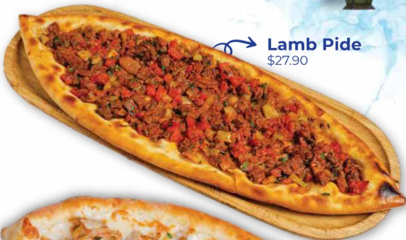
Lamb Pide $27.90