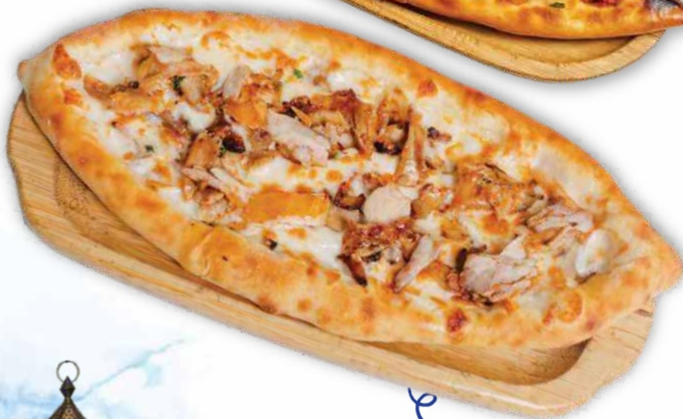
Chicken Pide $26.90