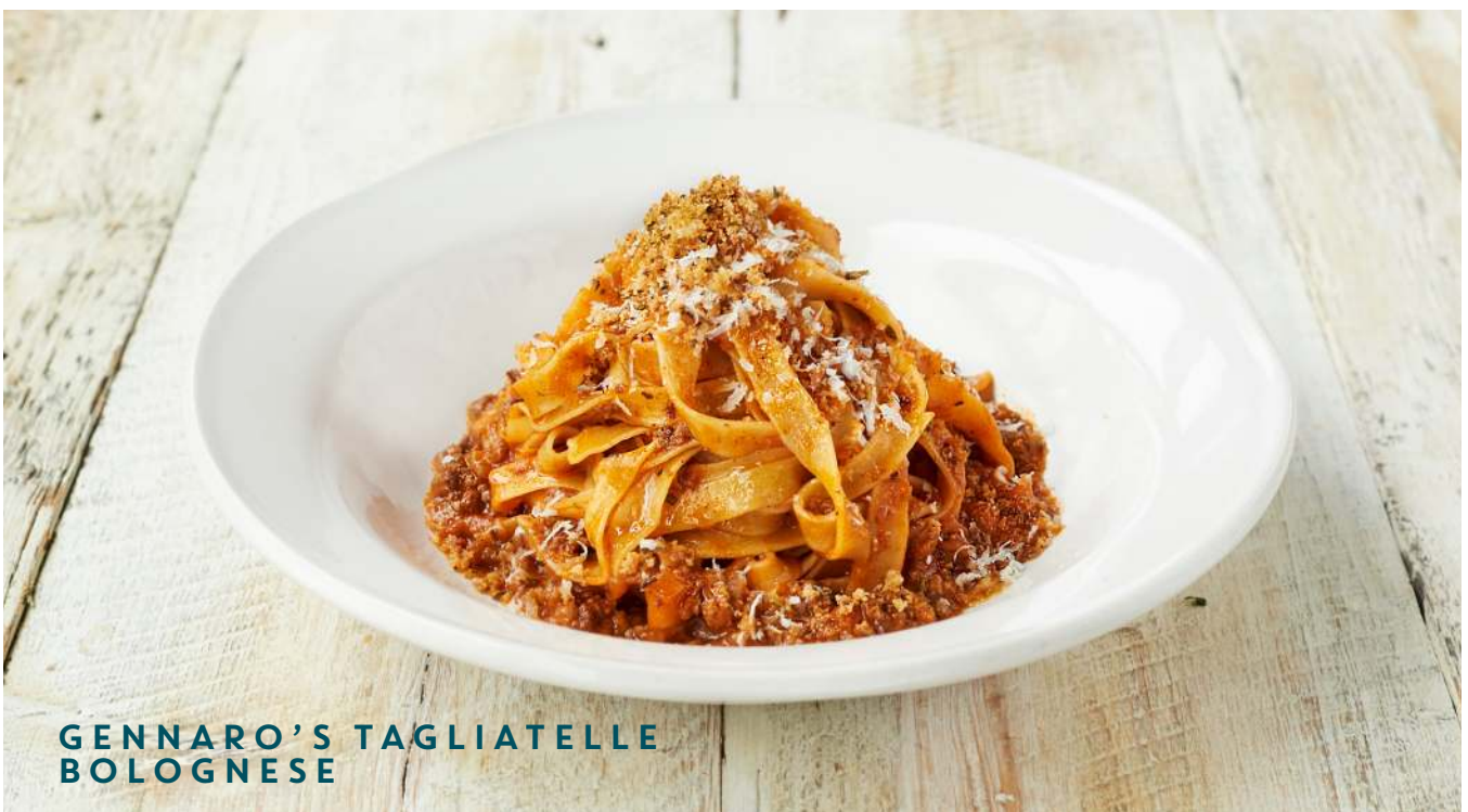
GENNARO'S TAGLIATELLE BOLOGNESE

OUR PASTA IS SIMPLY MADE WITH TIPO 'OO' FLOUR, SEMOLINA, FREE-RANGE EGGS & A LITTLE WATER