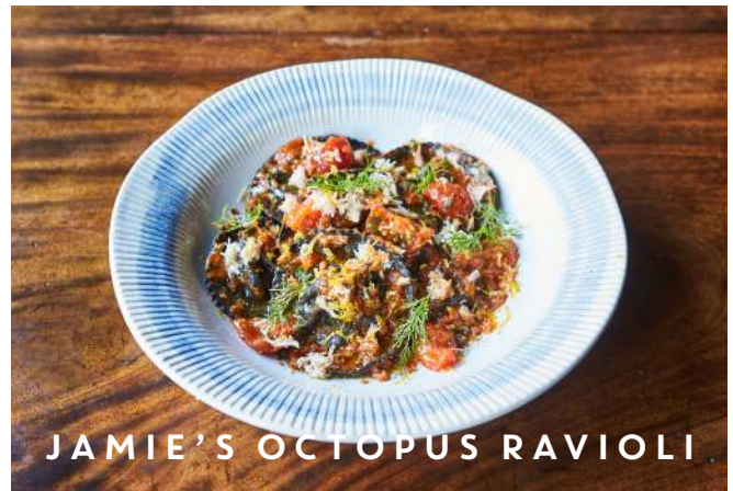
JAMIE'S OCTOPUS RAVIOLI

OUR PASTA IS SIMPLY MADE WITH TIPO 'OO' FLOUR, SEMOLINA, FREE-RANGE EGGS & A LITTLE WATER