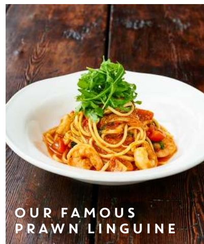
OUR FAMOUS PRAWN LINGUINE