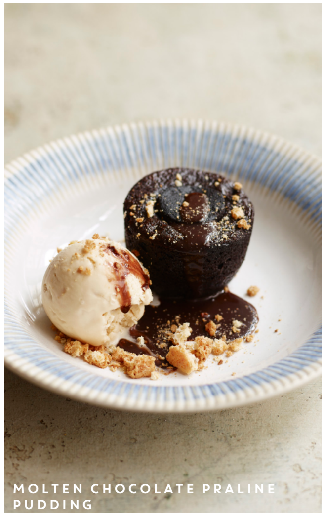
MOLTEN CHOCOLATE PRALINE PUDDING