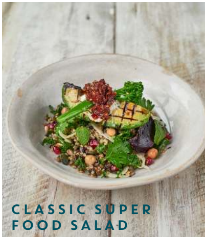
CLASSIC SUPER FOOD SALAD