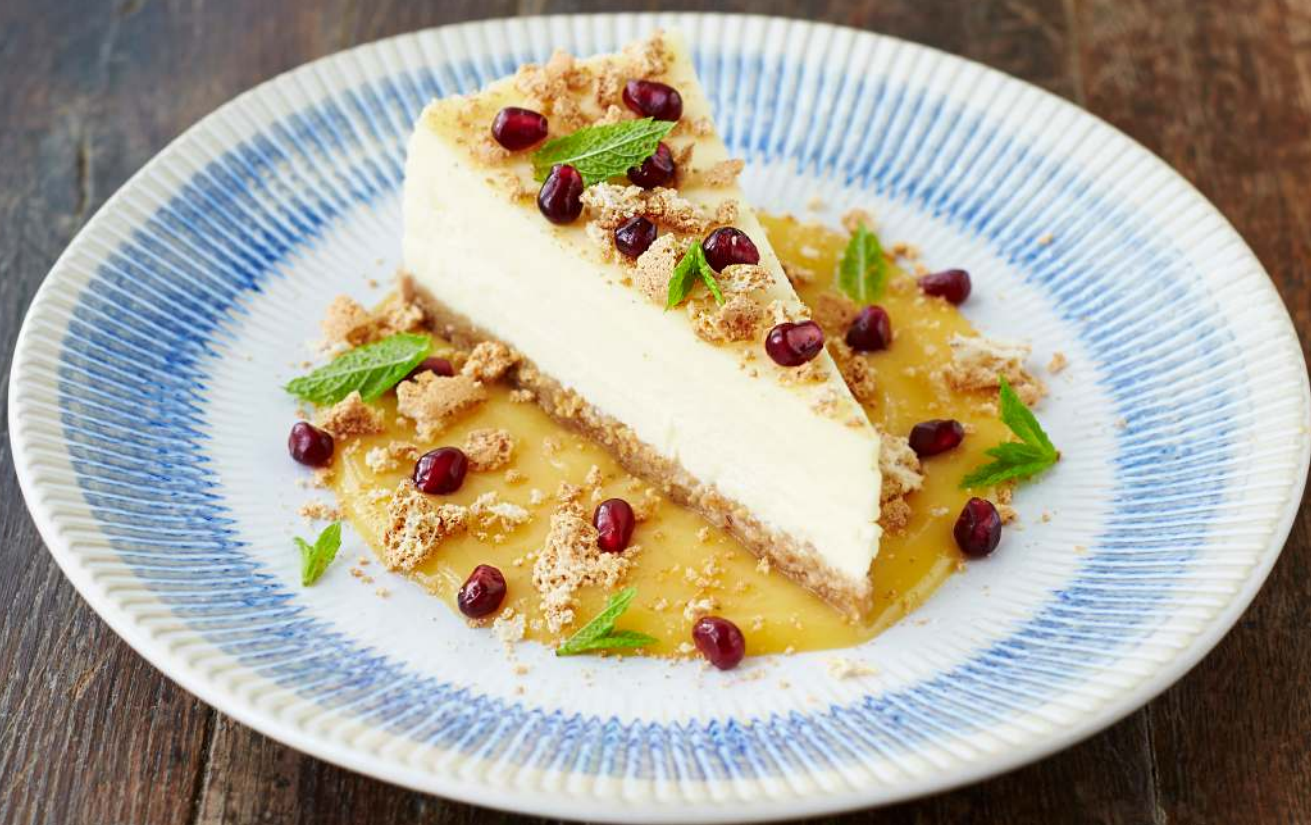
INDULGENT WHITE CHOCOLATE CHEESECAKE