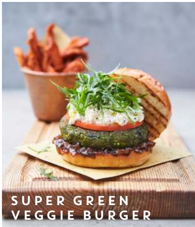
SUPER GREEN VEGGIE BURGER