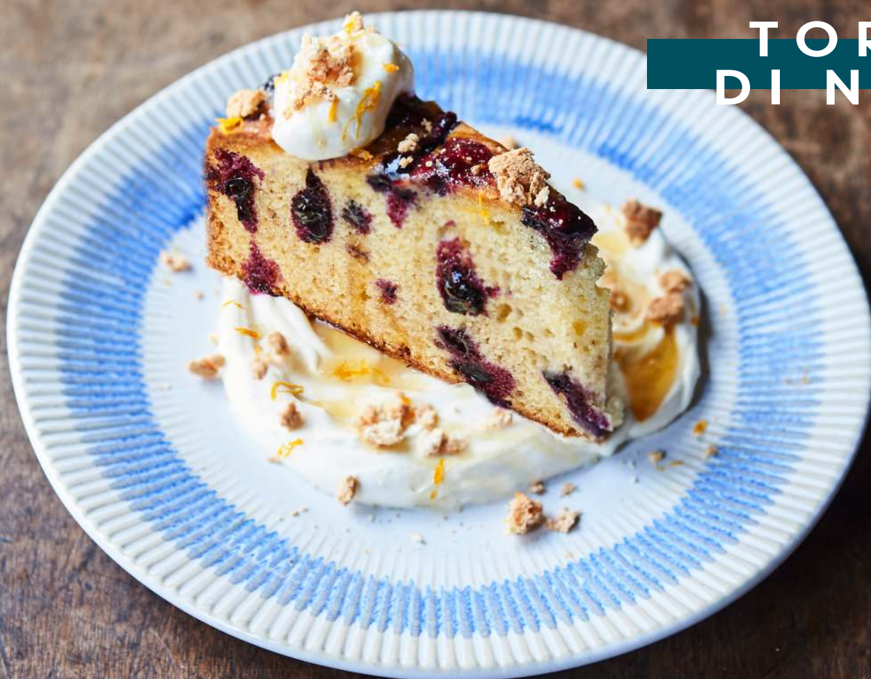
TORTA DI NADA