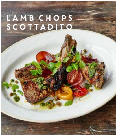
LAMB CHOPS SCOTTADITO