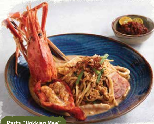
Pasta "Hokkien Mee"