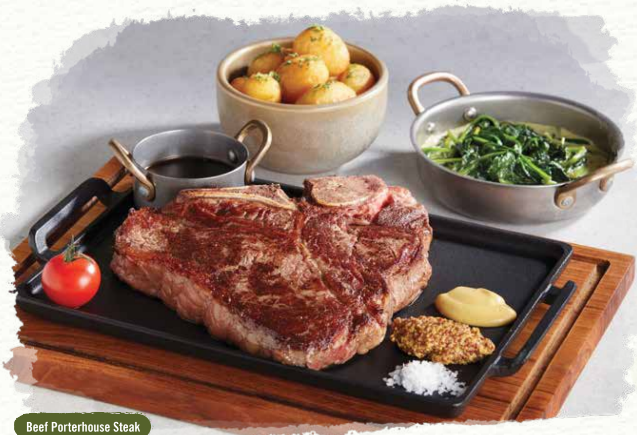
Beef Porterhouse Steak