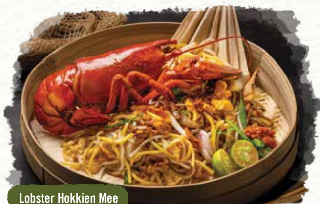
Lobster Hokkien Mee