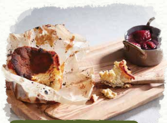
Basque Cheesecake with Poached Mixed Berries