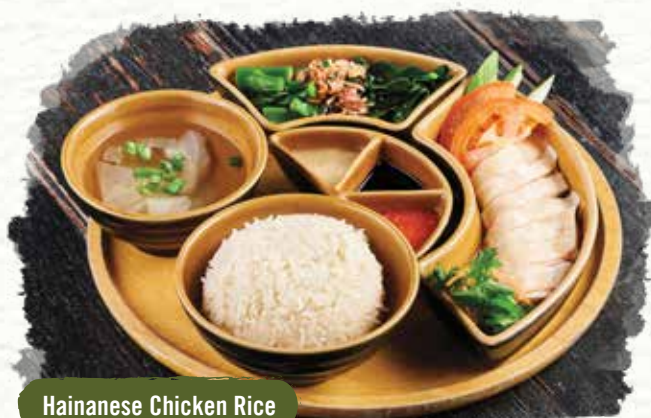
Hainanese Chicken Rice

Please inform our staff if you have any food allergies or dietary requirements.