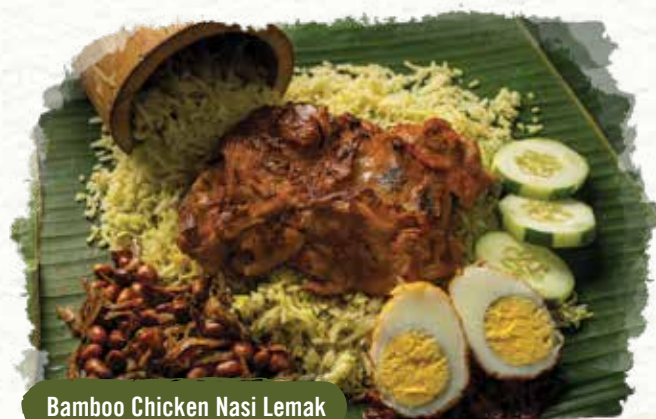
Bamboo Chicken Nasi Lemak