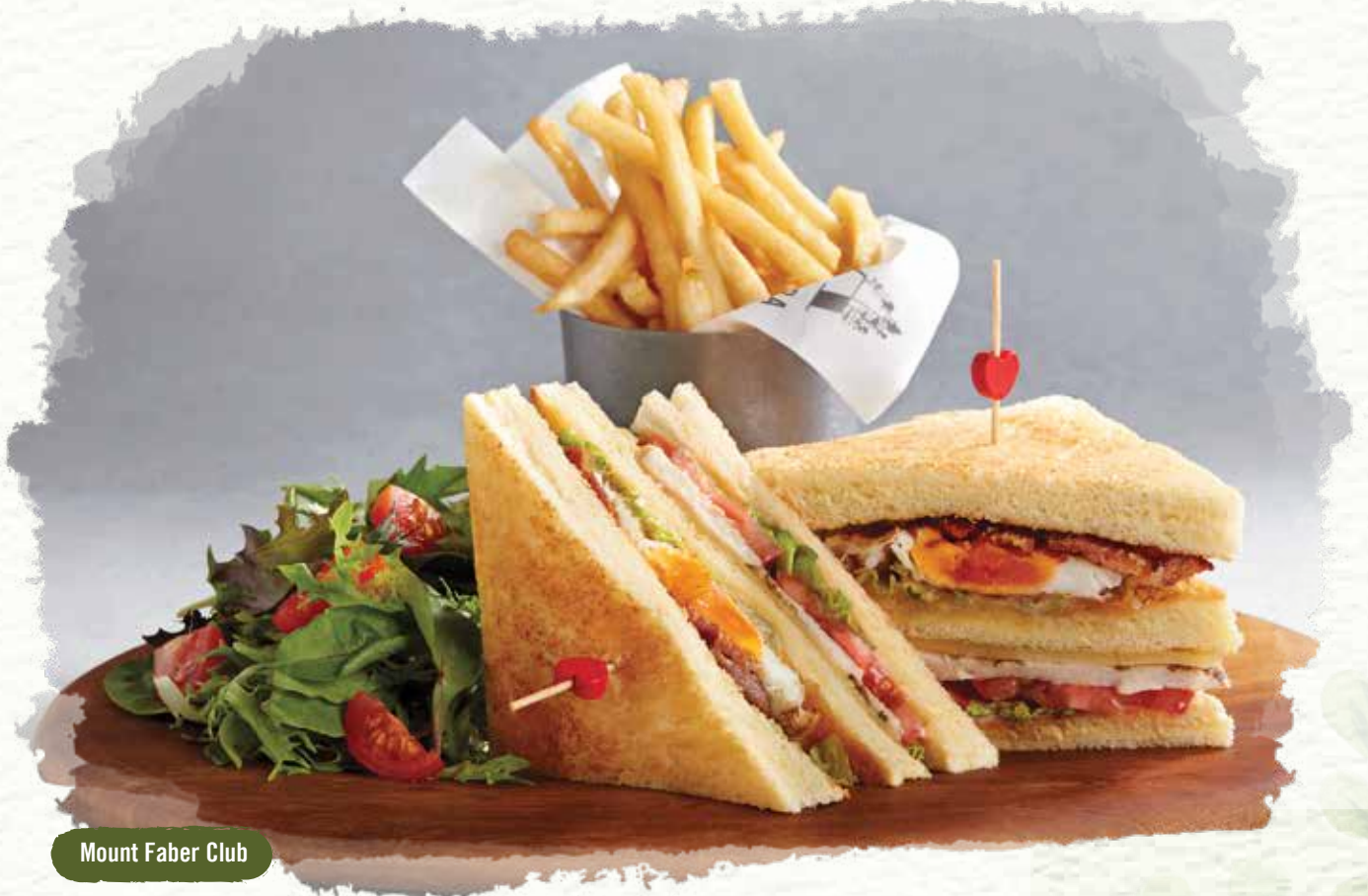
Mount Faber Club