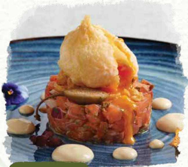
Smoked Salmon Tartare