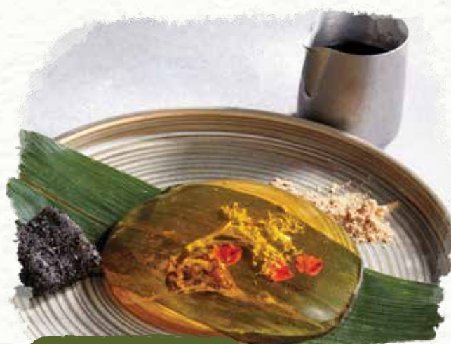
Oolong & Honey Pearl Drop