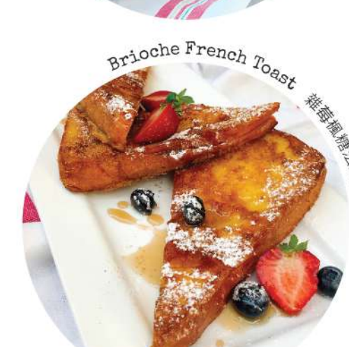
Brioche French Toast 雜莓楓糖法式吐司

thesaltedpighk THE SALTED PIG EST. 2013 @thesaltedpighk