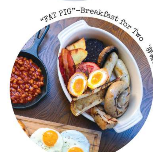
"FAT PIG"-Breakfast for Two '胖豬豬'二人分享早餐