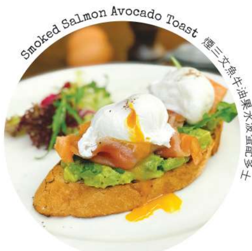
Smoked Salmon Avocado Toast 煙三文魚牛油果水波蛋配多士