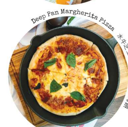
Deep Pan Margherita Pizza 水牛芝士蕃茄烤盤意大利薄餅