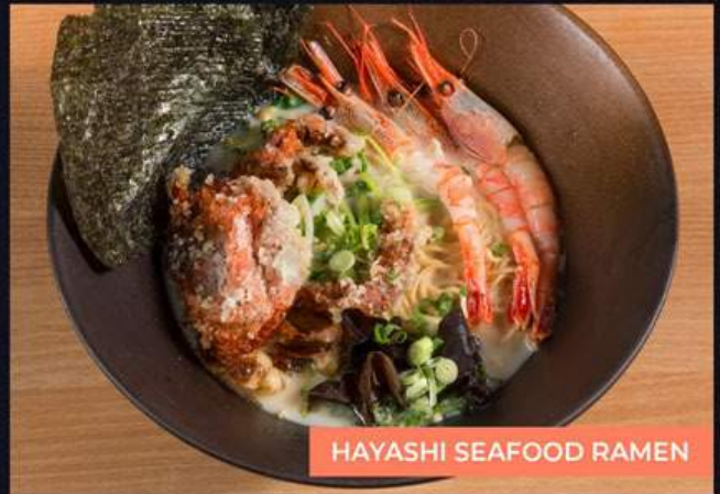
HAYASHI SEAFOOD RAMEN

3pc Chicken, 1 Egg, Bean Sprouts, Spring Onions, Shredded Nori