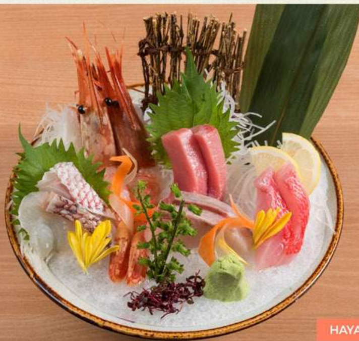
HAYASHI PREMIUM SASHIMI PLATTER