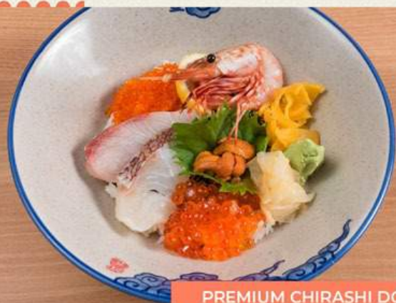
PREMIUM CHIRASHI DON