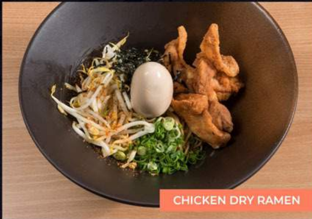
CHICKEN DRY RAMEN