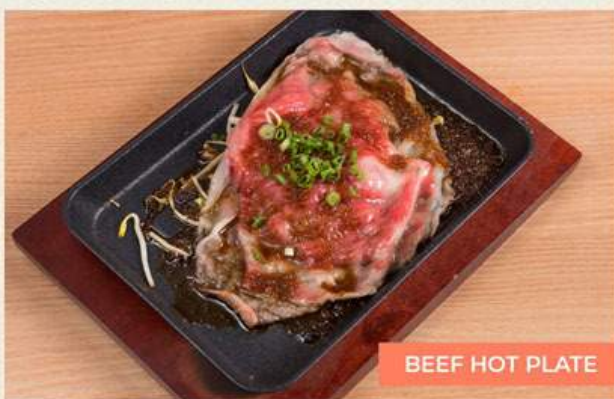
BEEF HOT PLATE