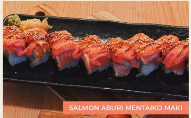
SALMON ABURI MENTAICO MAKI