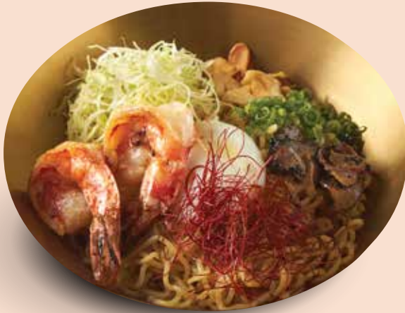
Dry Truffle Onsen Ramen ( Prawn | Wagyu )