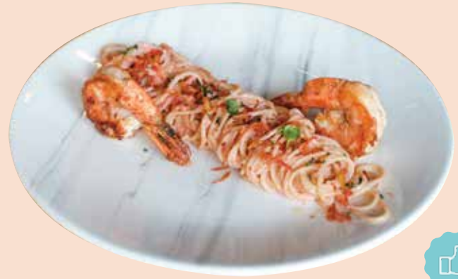
Everyday Mentaiko Pasta ( Prawn | Scallop )