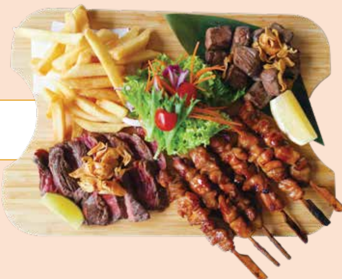
Wagyu Tori Platter