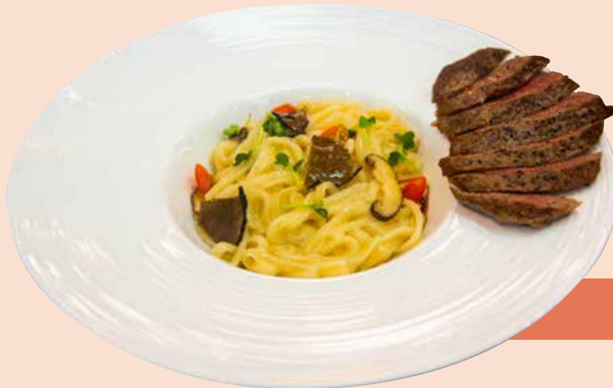
Savoury Truffle Wagyu Inaniwa Udon