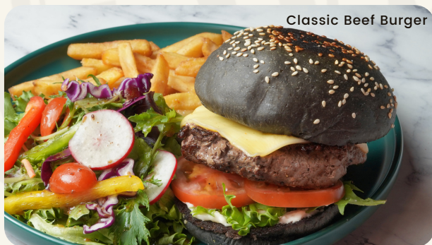
Classic Beef Burger