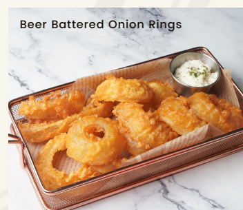
Beer Battered Onion Rings