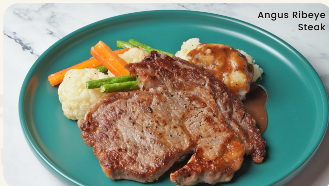
Angus Ribeye Steak

Sauce: Mushroom, Black pepper, Gravy, Asian Buttermilk, Truffle +$2