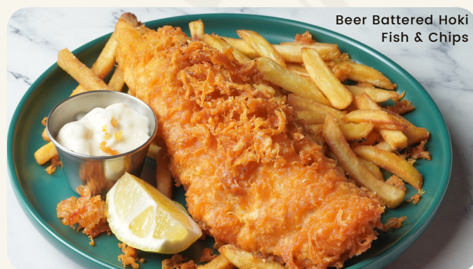
Beer Battered Hoki Fish & Chips