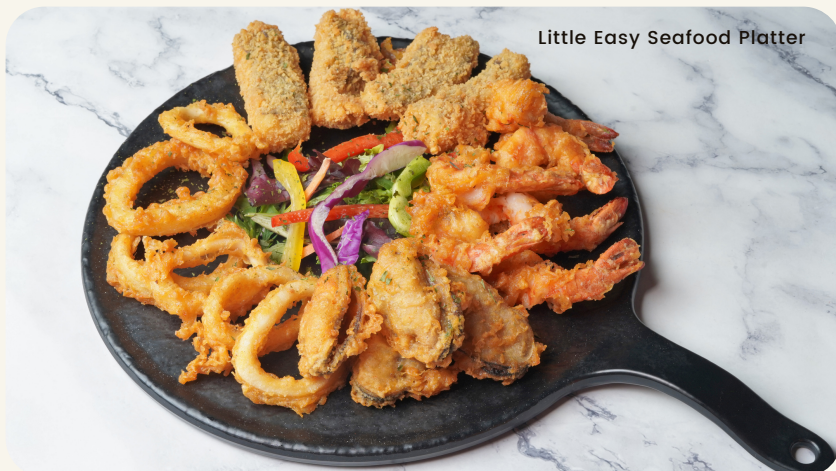
Little Easy Seafood Platter

● Nothing brings people together like good food