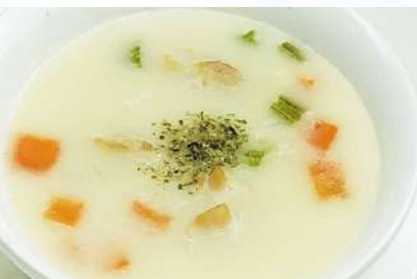
Creamy Chicken & Vegetable Soup