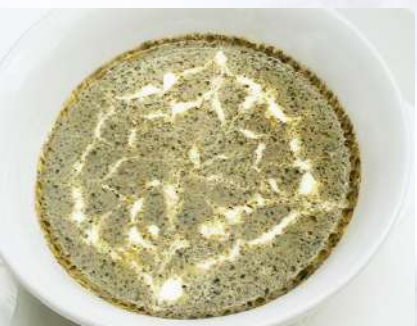
Cream of Mushroom