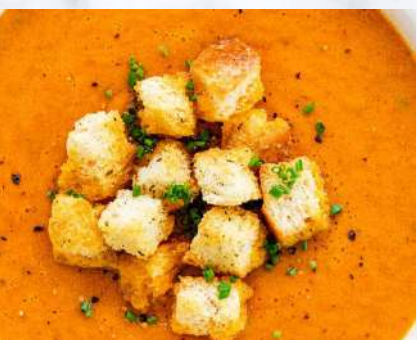
Tomato Basil Soup