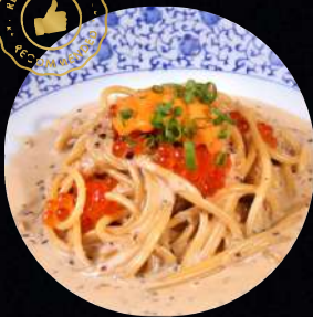
UNI SPAGHETTI uni, uni emulsion, salmon roe