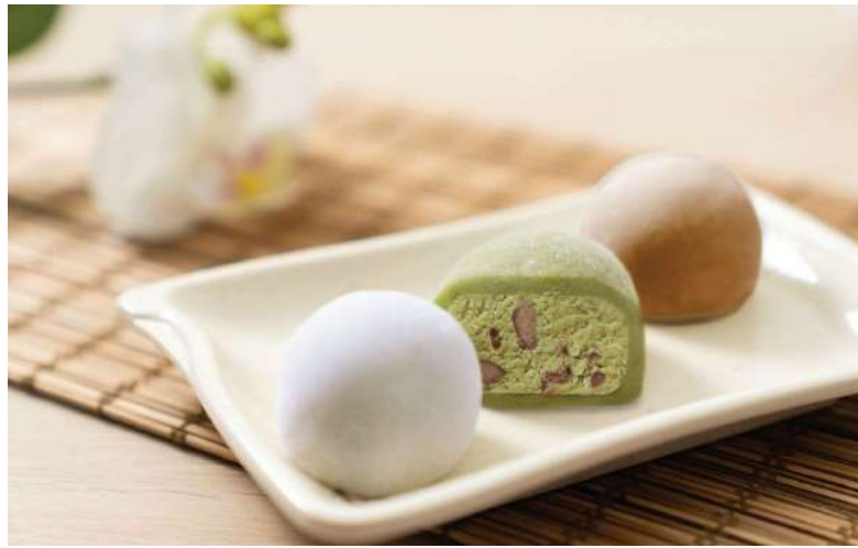
DAIFUKU MOCHI matcha azuki | tiramisu | durian