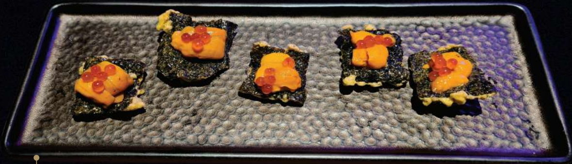
UNI AND IKURA ON NORI TEMPURA

Indulge in some of our delectable starters