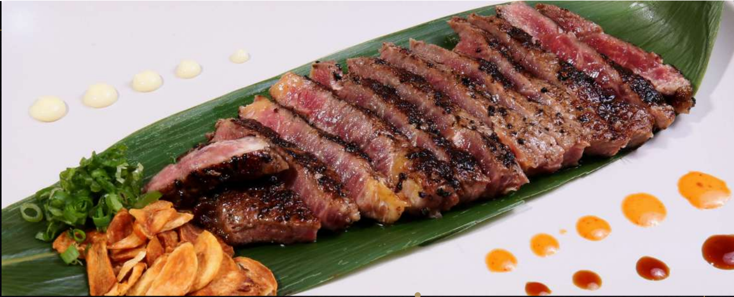
JAPANESE TRUFFLE BEEF with wasabi shoyu and truffle oil