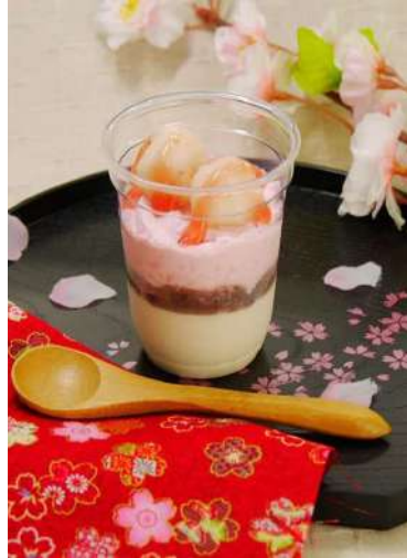
AMAOU MOCHI PARFAIT amaou strawberry mochi parfait with hokkaido milk