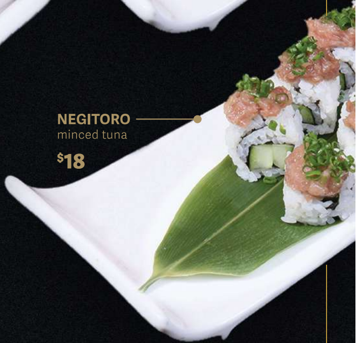
NEGITORO minced tuna $18