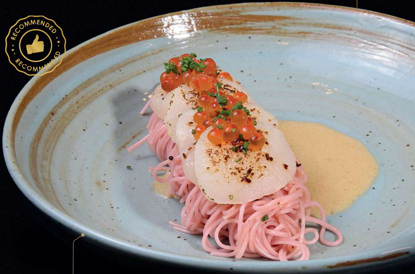
HOTATE UME SOMEN (cold) hokkaido scallop, ikura, shio kombu, truffle oil