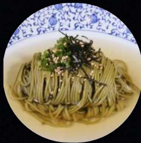
CHA SOBA hot | cold