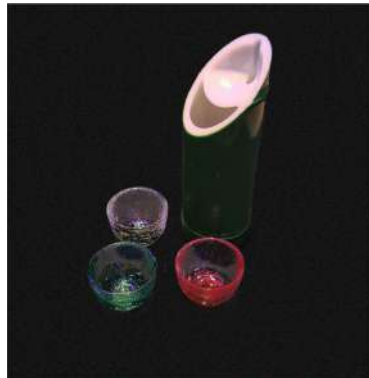
COLD SAKE 300ml