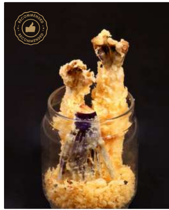
JUMBO EBI TEMPURA