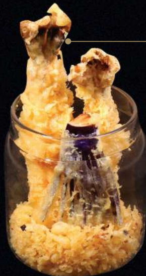
JUMBO EBI TEMPURA