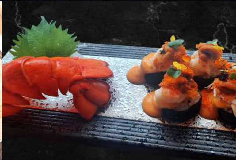
APPLEWOOD SMOKED UNI TRUFFLE TART (4 PIECES)