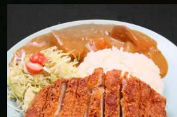
KUROBUTA PORK KATSU