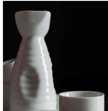
HOT SAKE 120ml