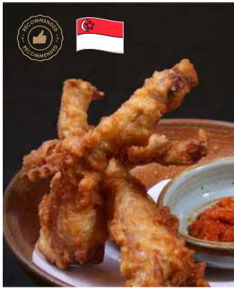
FROG LEG TEMPURA