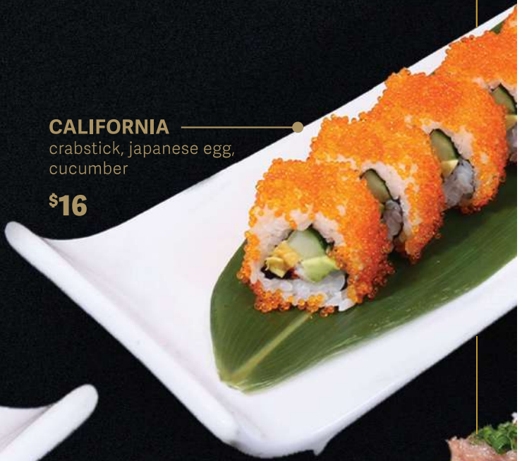
CALIFORNIA crabstick, japanese egg, cucumber $16