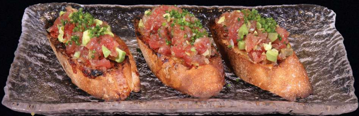
NEGITORO ON GARLIC TOAST

minced fatty tuna with avocado, wasabi dressing