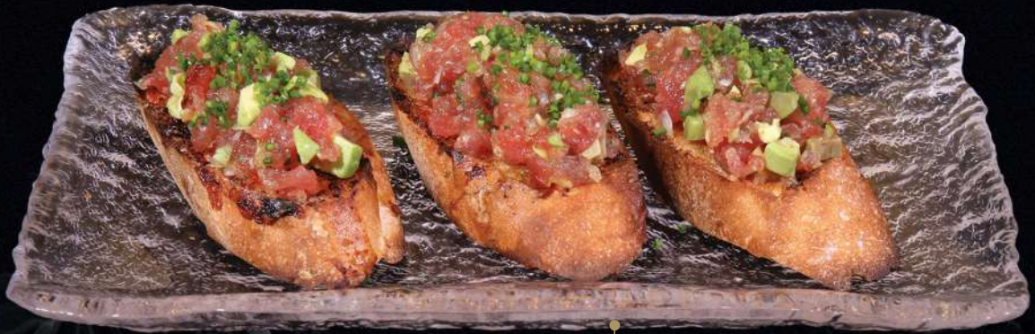
NEGITORO ON GARLIC TOAST minced fatty tuna with avocado, wasabi dressing