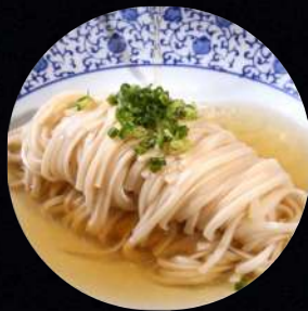
INANIWA UDON hot | cold