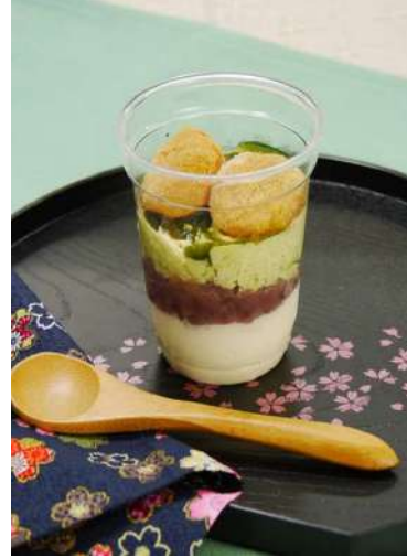
UJI MATCHA MOCHI PARFAIT uji matcha mochi parfait with hokkaido milk