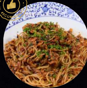
SAKURA EBI CAPELLINI japanese shrimp, shio kombu