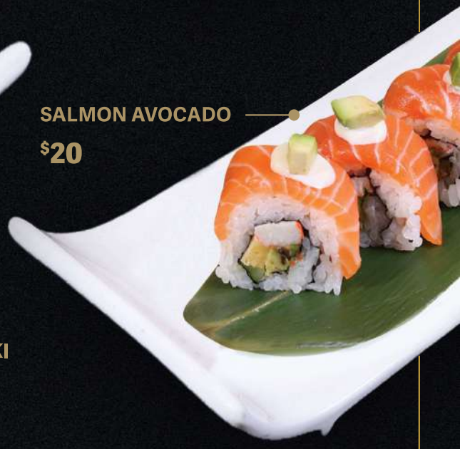
SALMON AVOCADO $20