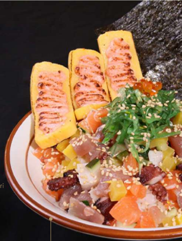
AJI ICHI BARA CHIRASHI $22