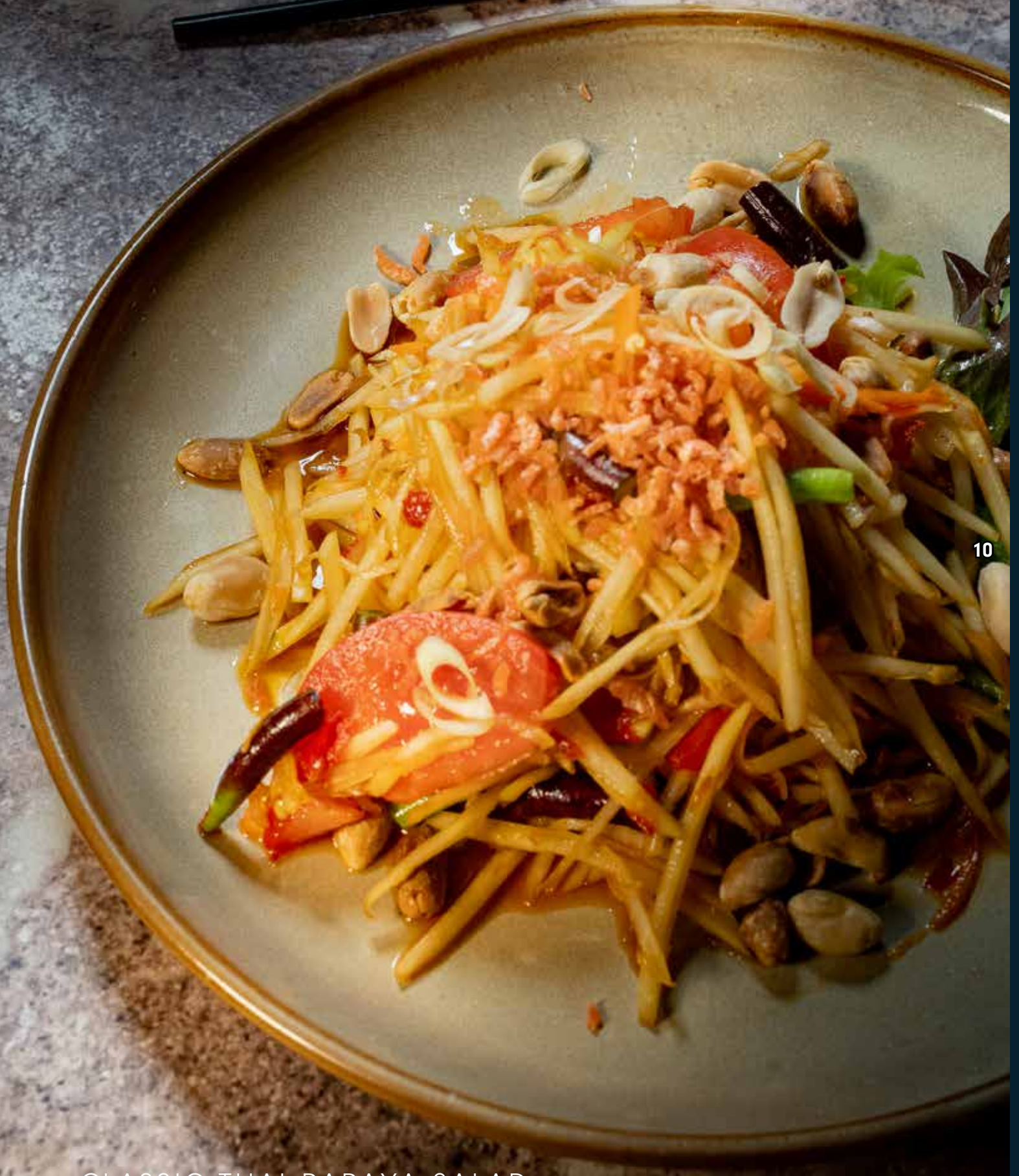
CLASSIC THAI PAPAYA SALAD