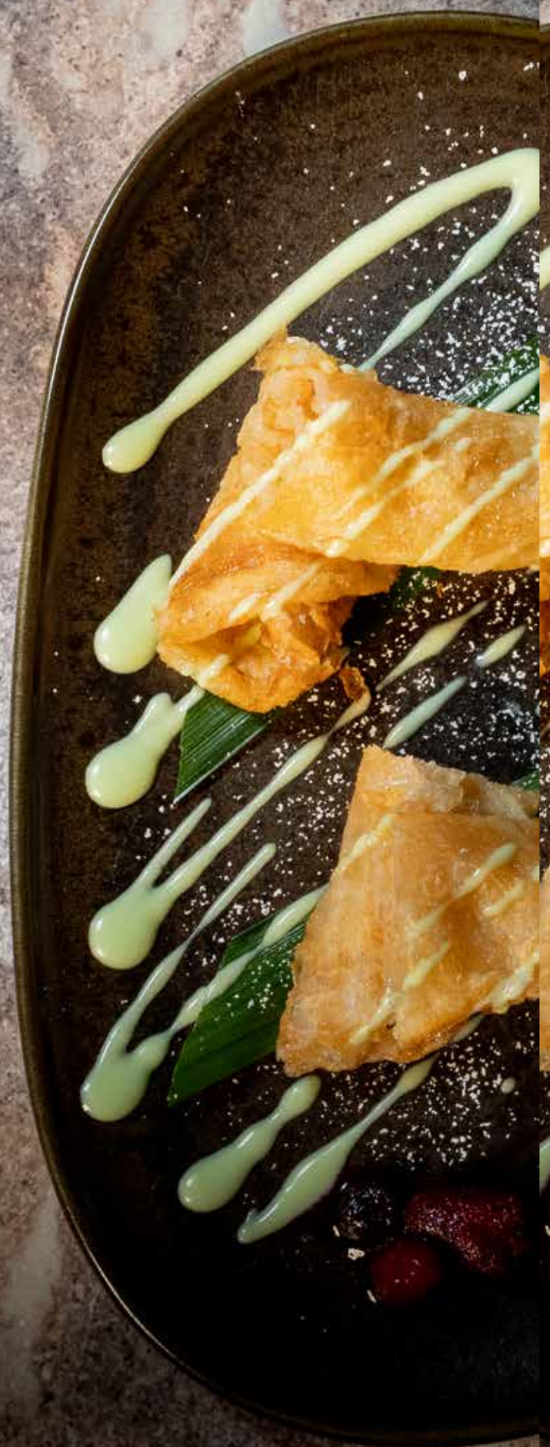
ROTI ROLL W/ PANDAN