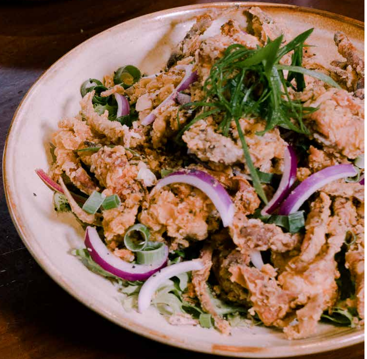
SOFT SHELL CRAB