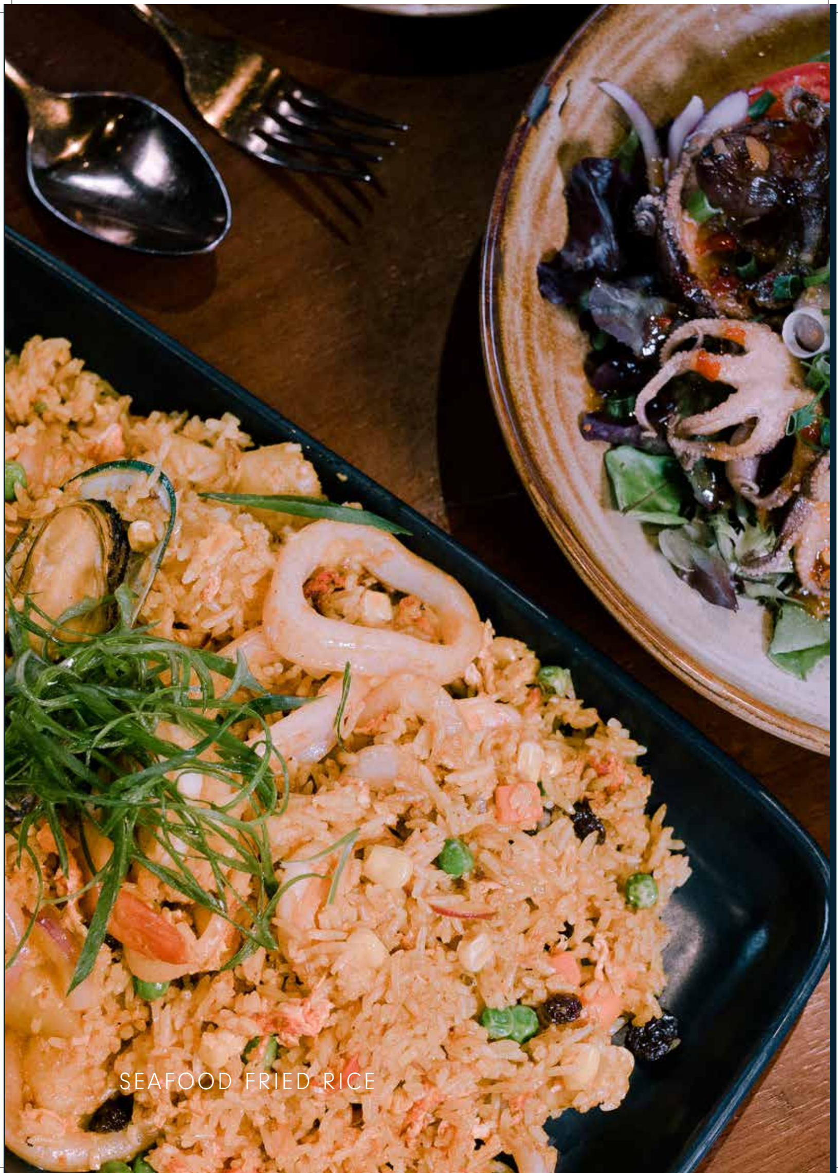
SEAFOOD FRIED RICE