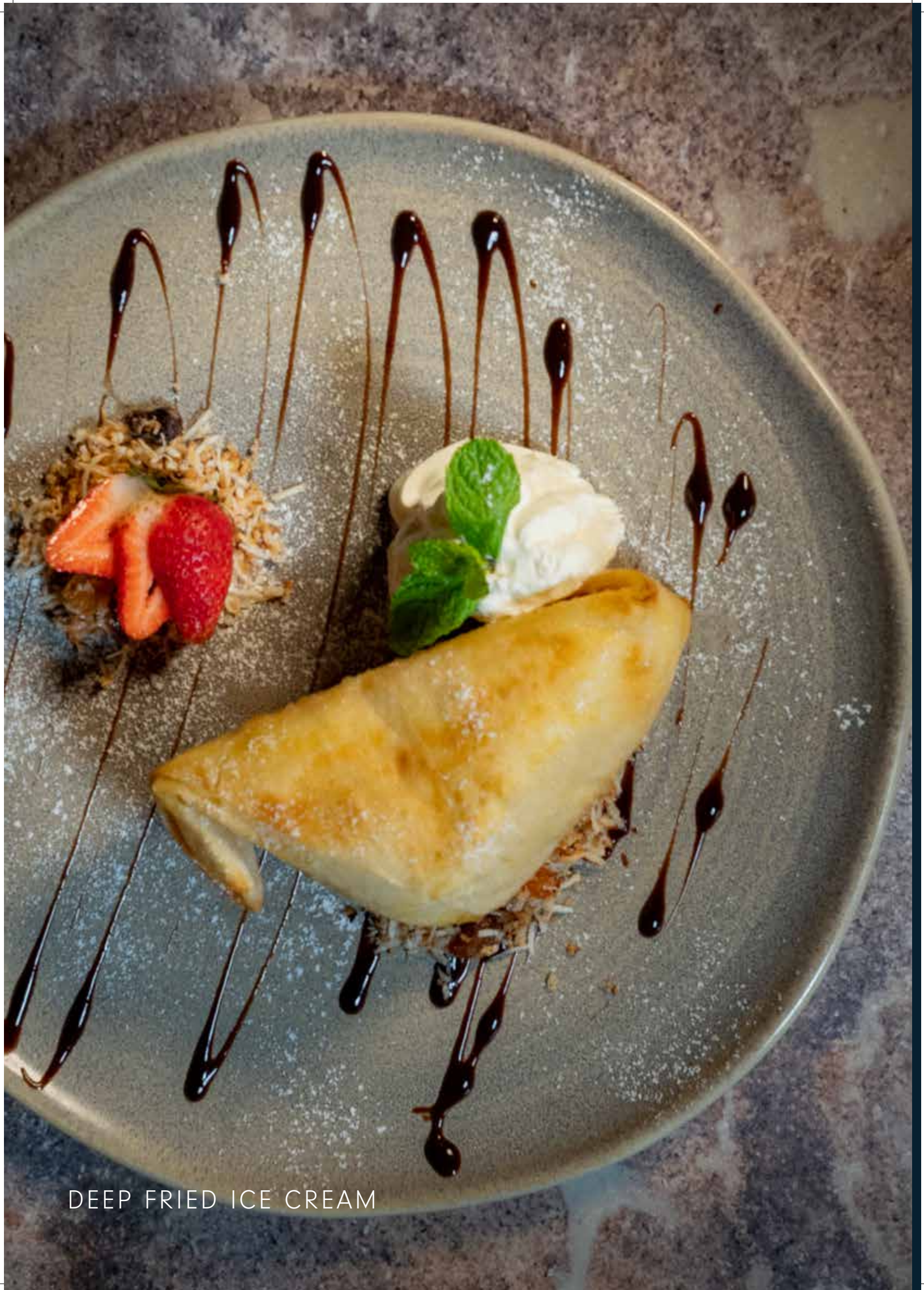
DEEP FRIED ICE CREAM