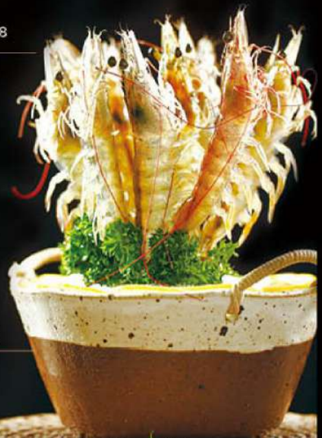
Fraun 活虾 $12 (100gram) (Minimum 200gram)