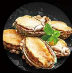
Abalone 活鲍鱼 M$22 L$28 (Minimum 20 piece)