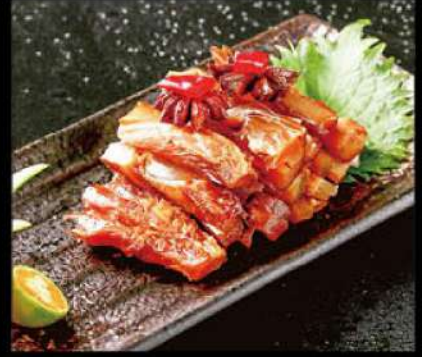
Braised Beef Tendon 招牌牛蹄筋 $18