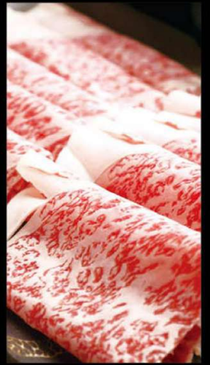
Japanese Wagyu Beef Shank 日本A5和牛腿肉 $78