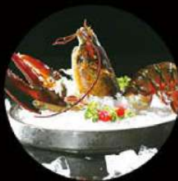
Boston Lobster 波士顿龙虾 Market Price (per piece)