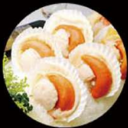
Scallop 扇贝 $12 (per piece) (Minimum 20 piece)