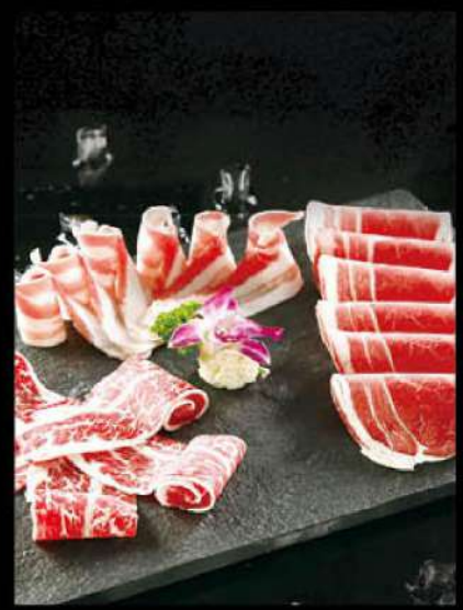
Japanese A5 Wagyu 日本A5和牛 $158