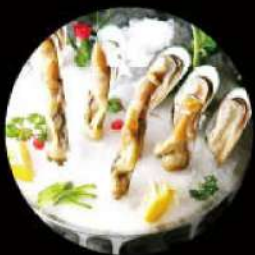
Bamboo Clam 鲜竹蚌 $18 (per piece) (Minimum 20 piece)