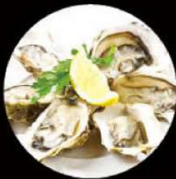
Oyster 生蚝 $60 (per dozen)