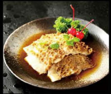
Braised Pig Ears 招牌猪耳朵 $18