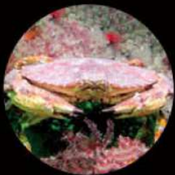
Dungeness Crab 珍宝蟹 Market Price (per piece)