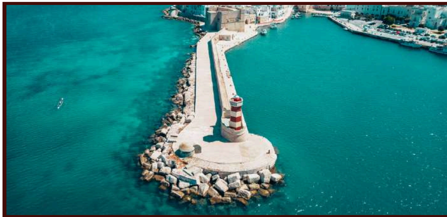
The Red Lighthouse of Monopoli, immersed in the chaotic life of the fishermen and the pier, is low and squat; only 15 meters high and has performed a signaling function since 1878

A new place with ancient flavors and values. The Cantinale is conviviality, love for good wine and good food. A place in the heart of the historic center of Monopoli, where history and tradition intertwine with modernity and innovation in order to restore a new time to the past.