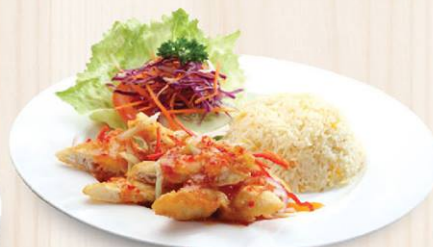
832B Thai Sweet Chilli Chicken w/ Egg Fried Rice 泰式鸡丁+蛋炒饭 $11.8