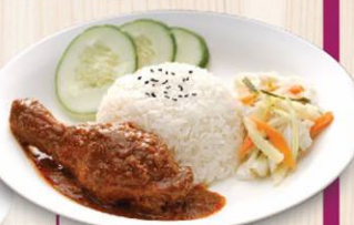
823 Rendang Chicken w/ Rice 仁当鸡饭 $10.8