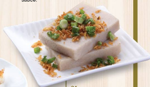
21 Steamed Yam Cake 蒸芋头糕 $5.8