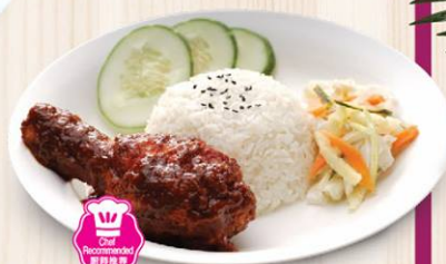
378 Ayam Merah Special w/ Rice 特制辣椒鸡腿饭 $11.8