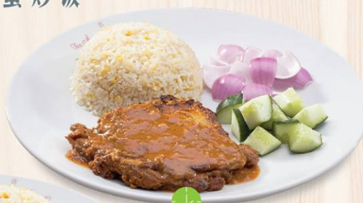
709 Satay Grilled Chicken Chop w/ Egg Fried Rice 沙爹鸡扒+蛋炒饭 $14.8