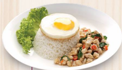
684 Spicy Basil Chicken w/ Rice 九层塔肉碎饭 $10.80