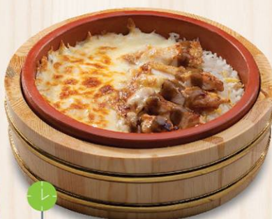
526 Cheese Baked Rice w/ Black Pepper Chicken Chop 芝士黑椒鸡扒烤饭 $15.8