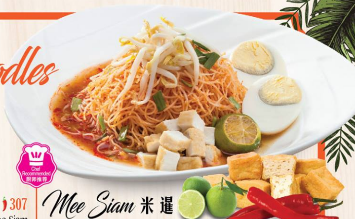
307 Mee Siam 汤汁米暹 $8.0

It contains coconut milk and curry spices, thus creates a richer and smoother texture.