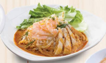
332 Dry Curry Hor Fun 干咖喱河粉 $11.8