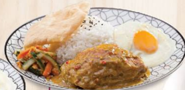
871 Nyonya Chicken w/ Rice 娘惹鸡饭 $11.8