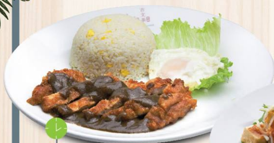
811 Black Pepper Fried Chicken Chop w/ Egg Fried Rice 黑椒鸡扒+蛋炒饭 $14.8

All chicken chop is served with egg fried rice, side dish and our homemade sauce.