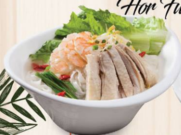
331 Hor Fun Soup 河粉汤 $11.8