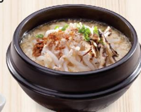
369 Claypot Lou Shu Fen 沙煲老鼠粉 $8.0