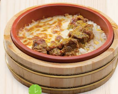
523 Cheese Baked Rice w/ Nyonya Lamb 芝士娘惹羊肉烤饭 $14.8