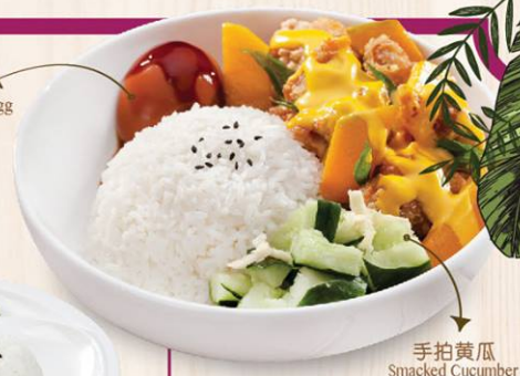
卤蛋 Braised Egg