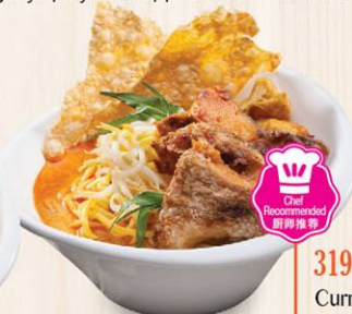
319 A B C Curry Laksa w/ Fish Wings 辣沙 (鱼翼) $13.8