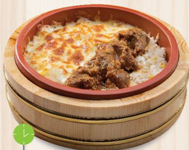
520 Cheese Baked Rice w/ Lamb Rendang 芝士仁当羊肉烤饭 $14.8

Chosen main served with egg fried rice, well covered with our cheese mix, then baked till golden colour.