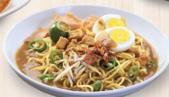
333 Curry Chicken Mee 干咖喱鸡面 $11.8