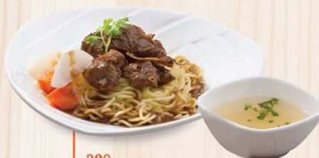
328 Hainanese Braised Beef Noodle 海南焖牛肉面 $13.8