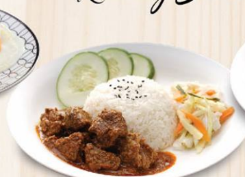
824 Rendang Lamb w/ Rice 仁当羊肉饭 $11.8