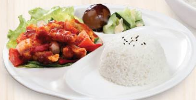
662 Nyonya Sambal Chicken w/ Rice 娘惹叁巴鸡丁饭 $11.8