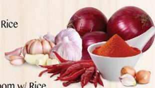
600V Sweet & Sour Mushroom w/ Rice 酸甜杏鲍菇饭 $11.8