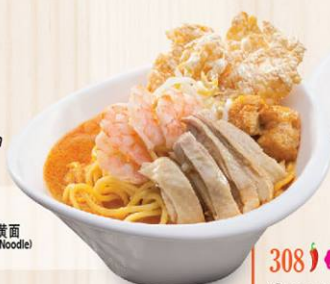
308 A B C Curry Laksa 辣沙 $12.8

A Hor Fun 河粉 (Flat Rice Noodle) B Mee Hoon 幼米粉 (Vermicelli) C Mee 黄面 (Yellow Noodle)