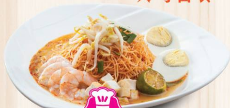
344 Nyonya Mee Siam 娘惹米暹 $10.5

It contains coconut milk and curry spices, thus creates a richer and smoother texture.