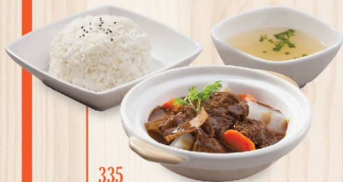
335 Hainanese Braised Beef Rice 海南焖牛肉饭 $13.8

Braised for hours with many kinds of tonic herbs and spices, such as "Bei Qi" (Astragalus root), cinnamon, star anise, ginger etc, the sauce is flavourful and the beef is tender.