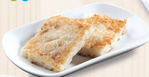
20 Pan Fried Carrot Cake 香煎萝卜糕 $5.8