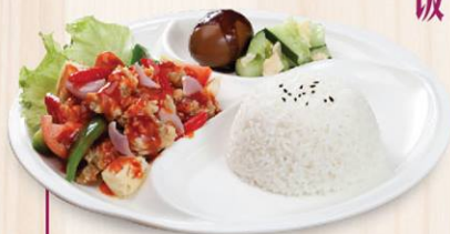
600 Sweet & Sour Chicken w/ Rice 酸甜鸡丁饭 $11.8