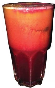
ABC (A blend of Apple, Beetroot and Carrots) $6.00