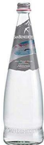
San Benedetto, 750ml Sparkling $6.00 San Benedetto, 750ml Still $6.00