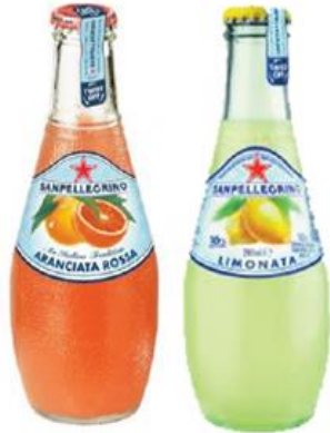
Italian Sparkling Juice, 200ml (Orange or Lemon) $4.00