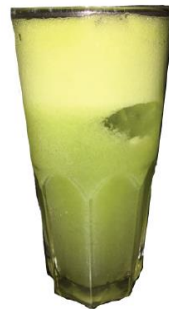
Green Apple Juice $5.00