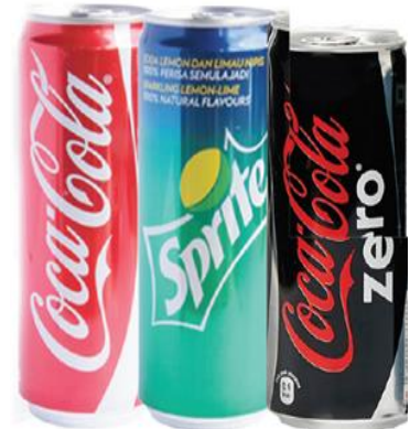
Soda, 325ml (Coke or Sprite or Coke Zero) $4.00