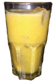
Orange Juice $5.00