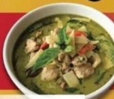
C1. Green Curry

Thai green curry with coconut milk, green beans, bamboo shoots and Thai basil.