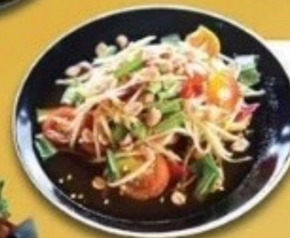
L5. Som Tum Salad