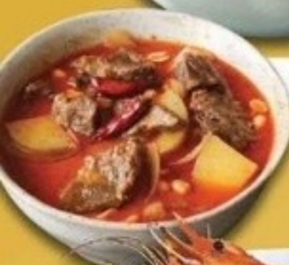
C3. Massaman Beef Curry

Mildly spicy Red curry with coconut milk, green bean, kaffir lime and Thai basil.