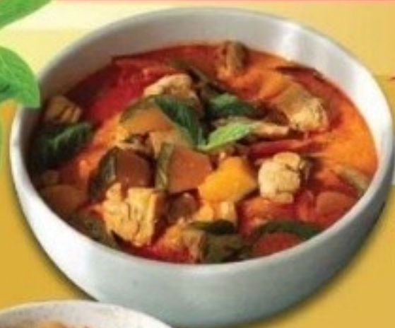
C2. Red Curry

Thai green curry with coconut milk, green beans, bamboo shoots and Thai basil.