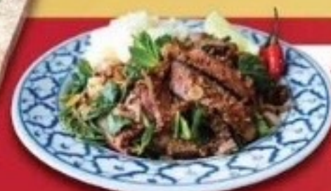
L9. Nam Tok Beef Salad

Grilled pork neck with crispy edges and spicy dipping sauce.