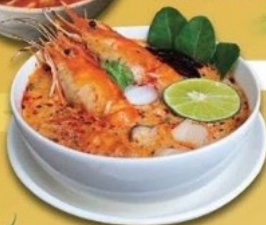
C5. Tom Yum Soup

Red curry with tender roasted duck, pineapple, tomato, lychee and Thai basil.