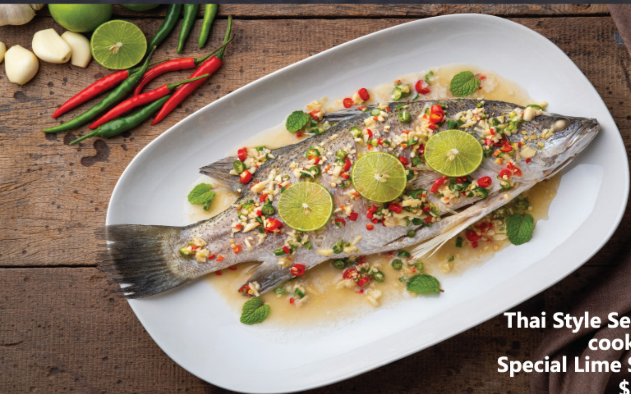
Thai Style Seabass cooked in Special Lime Sauce $29.90