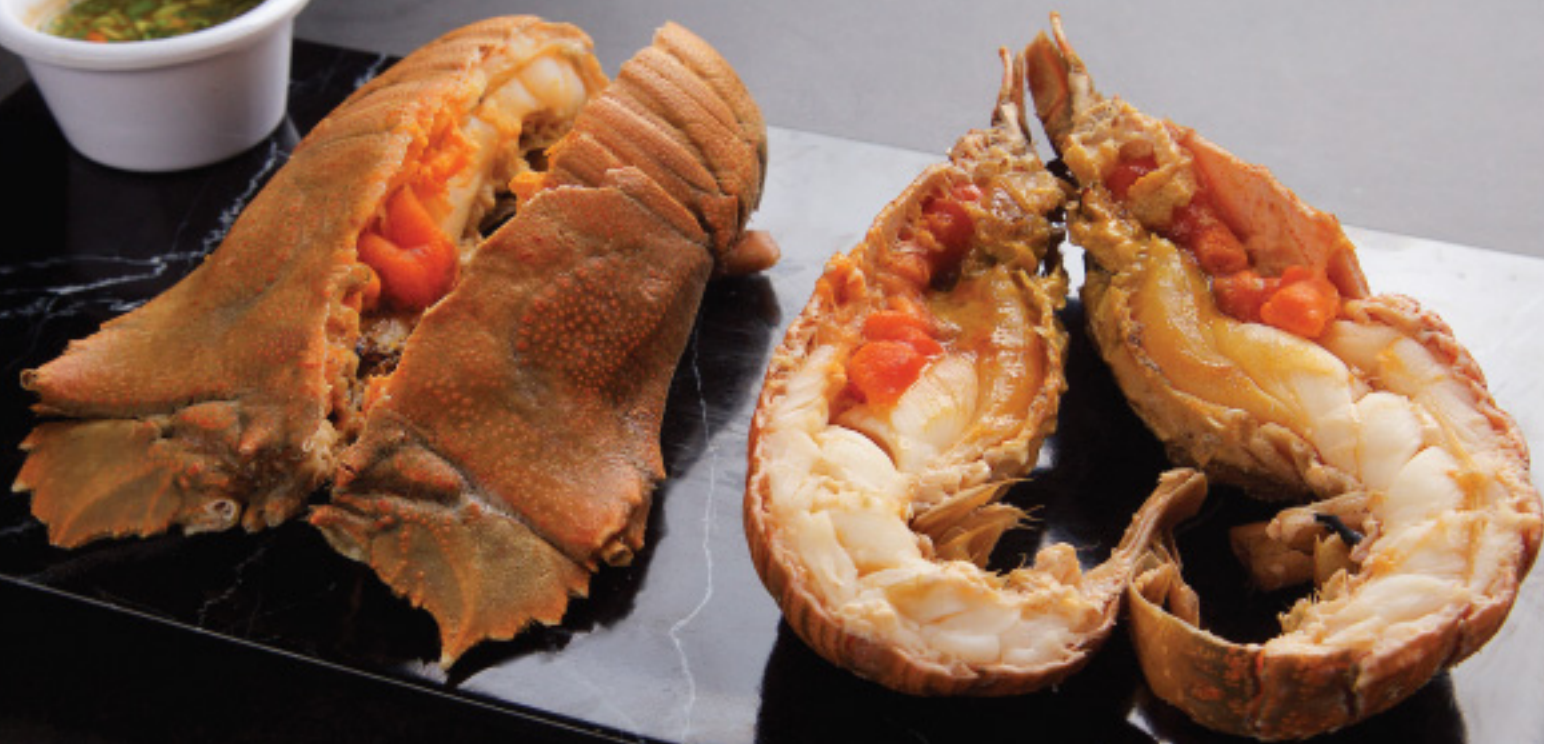
Thai Style Slipper Lobster (Asian Crayfish) paired with Kin Hoi's Signature Chilli Sauce $24.00

Thai Style Grilled Prawns Paired with Kin Hoi's Signature Chilli Sauce $28.80 (5-6 Pieces )