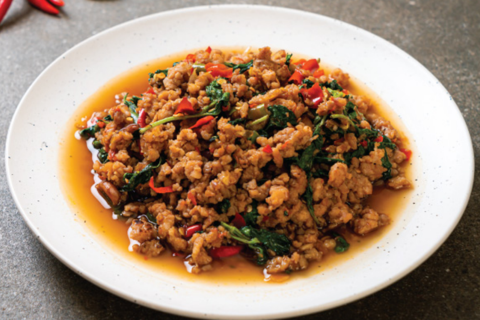
Original Basil Pork or Chicken Ala Carte