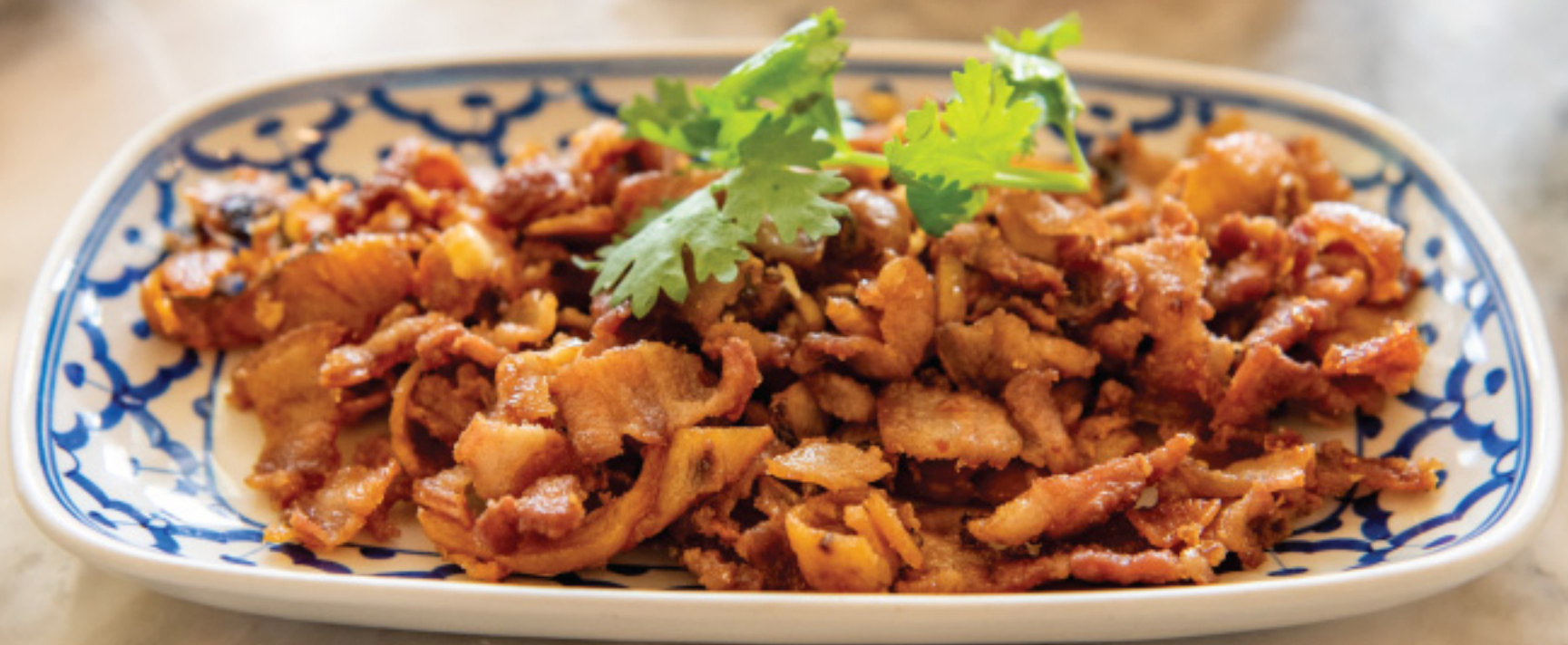
Original Thai Garlic Pork /Chicken $13 Ala Carte

KIN HOI Original Thai Taste, Seafood & more