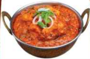
Fish Tikka Masala