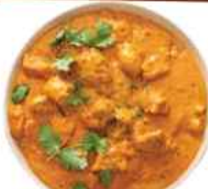
Chicken Tikka Masala