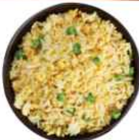
Egg Fried Rice