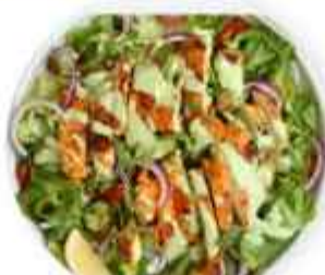
Chicken Tikka Salad