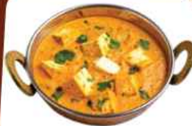
Paneer Tikka Masala