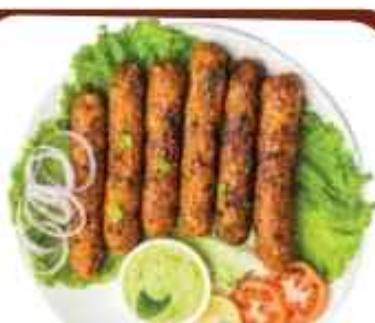
Lamb Seekh kebab