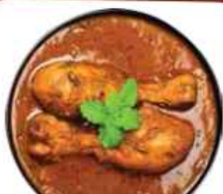
Chicken Do pyaza