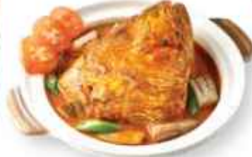
Fish Head Curry