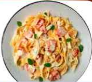
Tagliatelle al Salmone