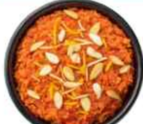
Gajar Ka Halwa