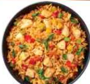
Chicken Fried Rice