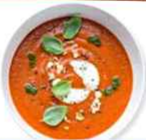
Pappa an Pomodoro