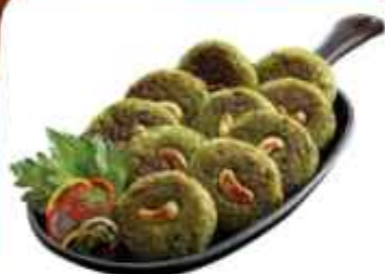
Hara Bhara Kebab