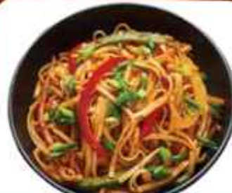
Schezwan Fried Noodles