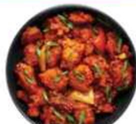
Chilli Fried Fish