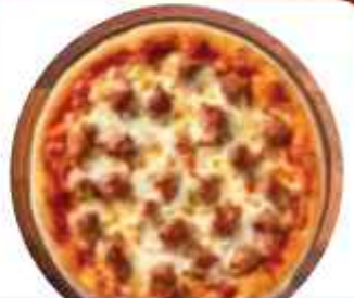
Chilli Chicken Pizza