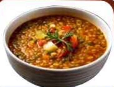
Zuppa DI Lenticchle