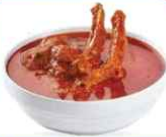
Lamb Chop Masala