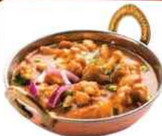
Aloo Matar Ghobi