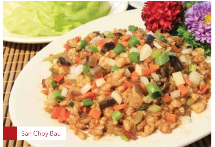
San Choy Bau