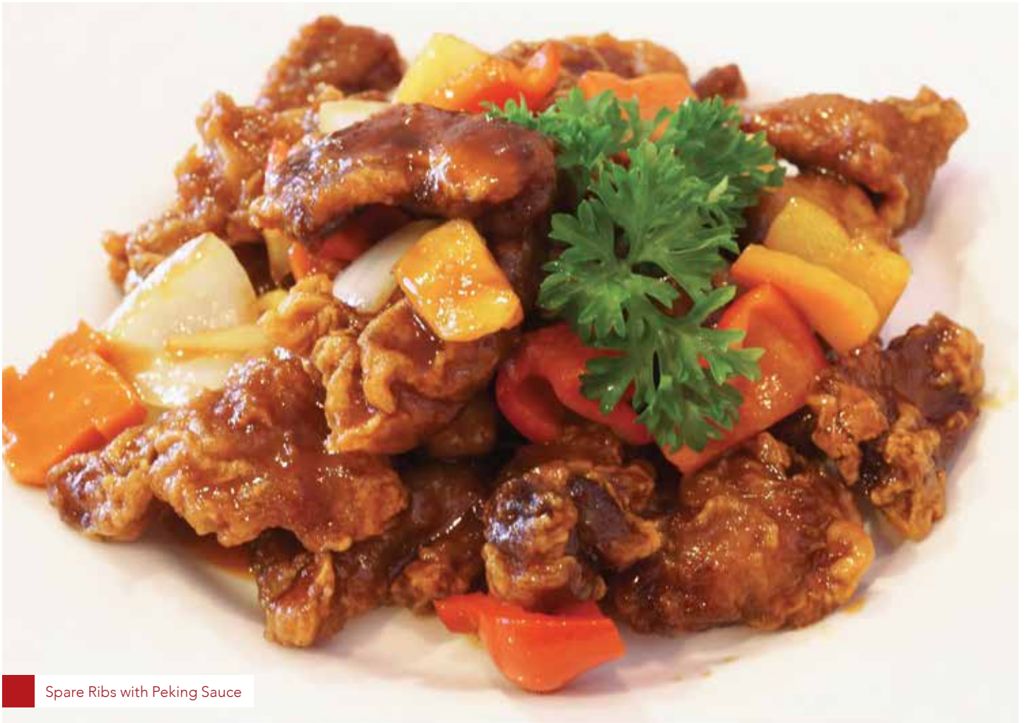
Spare Ribs with Peking Sauce