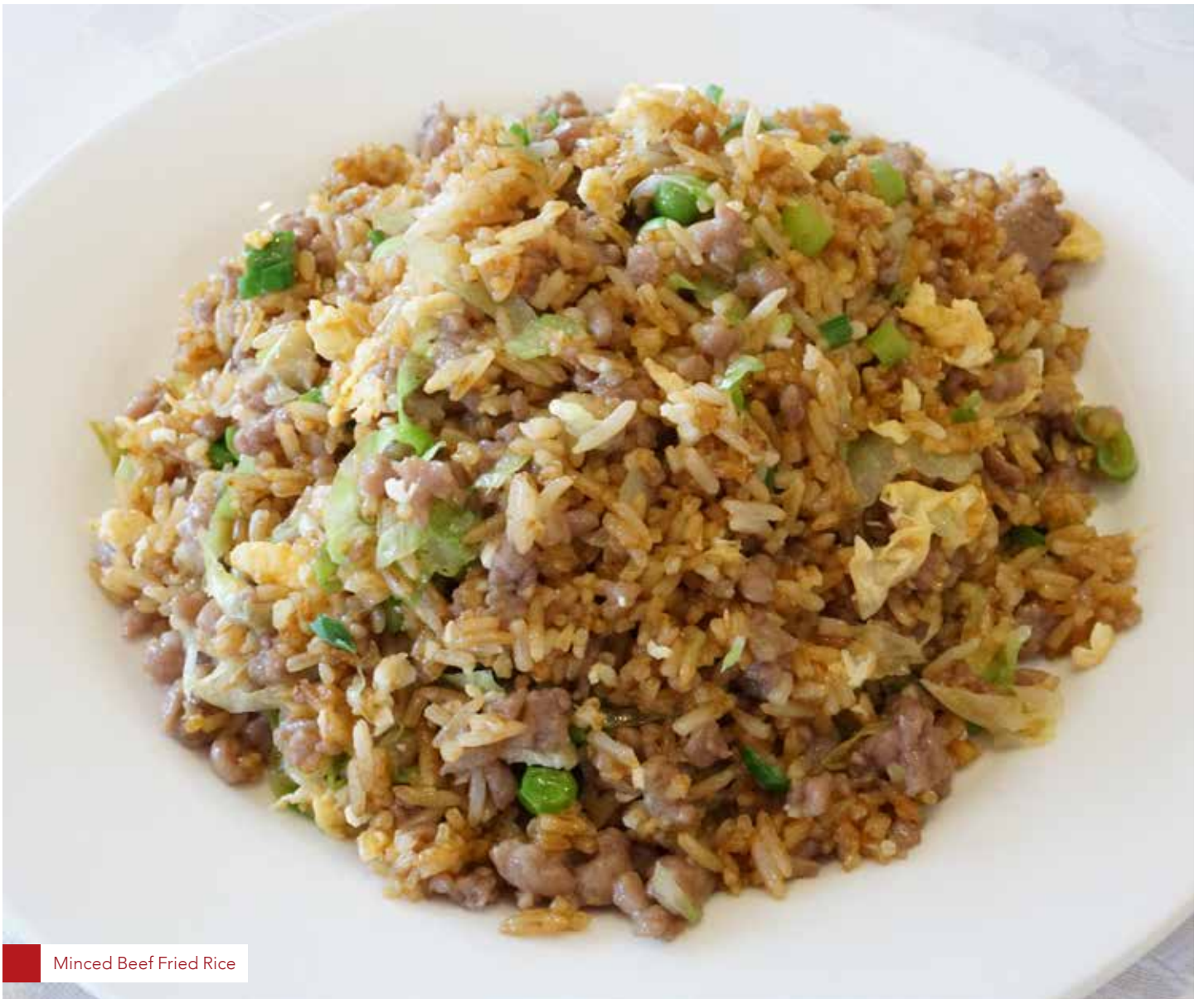
Minced Beef Fried Rice