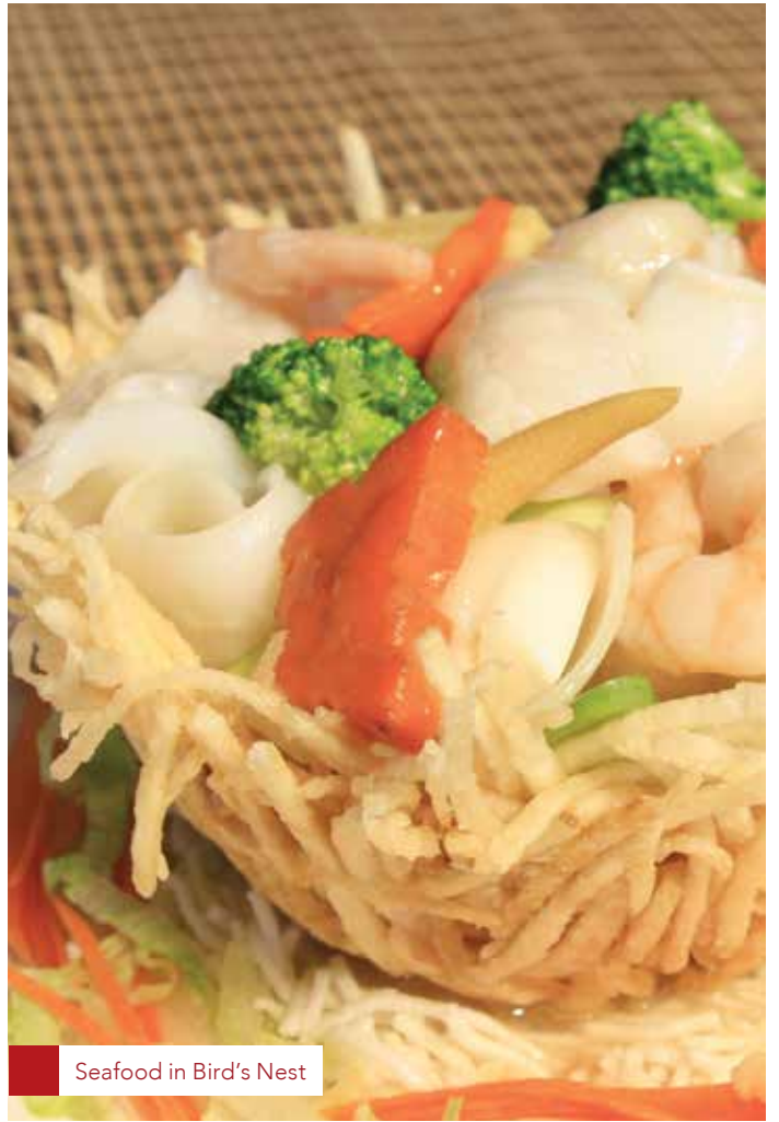
Seafood in Bird's Nest