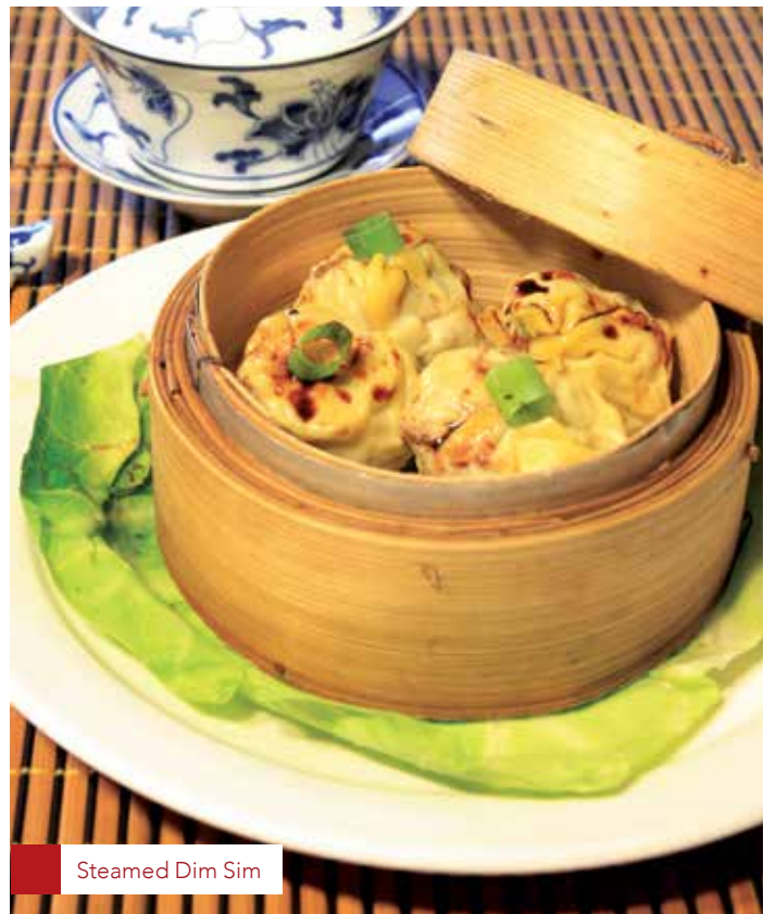
Steamed Dim Sim