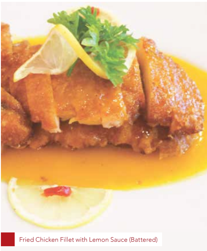
Fried Chicken Fillet with Lemon Sauce (Battered)