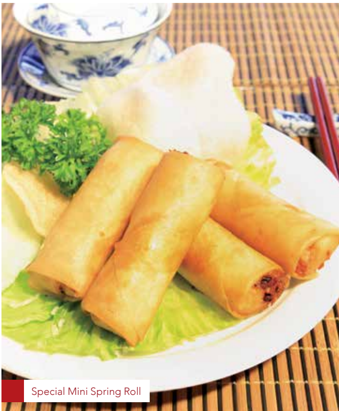
Special Mini Spring Roll