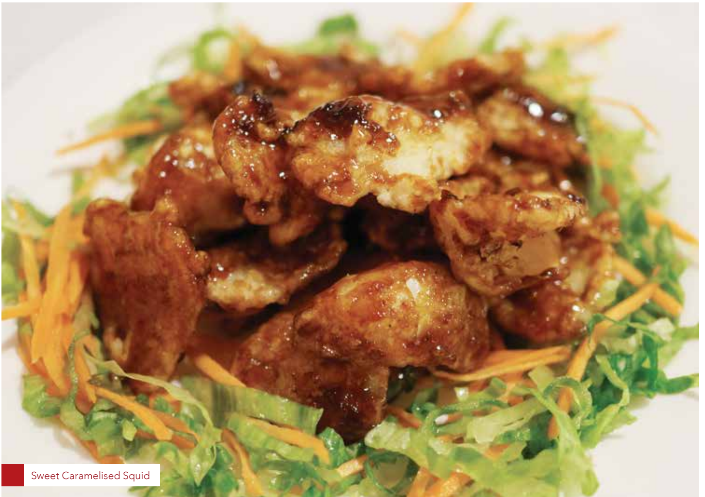
Sweet Caramelised Squid