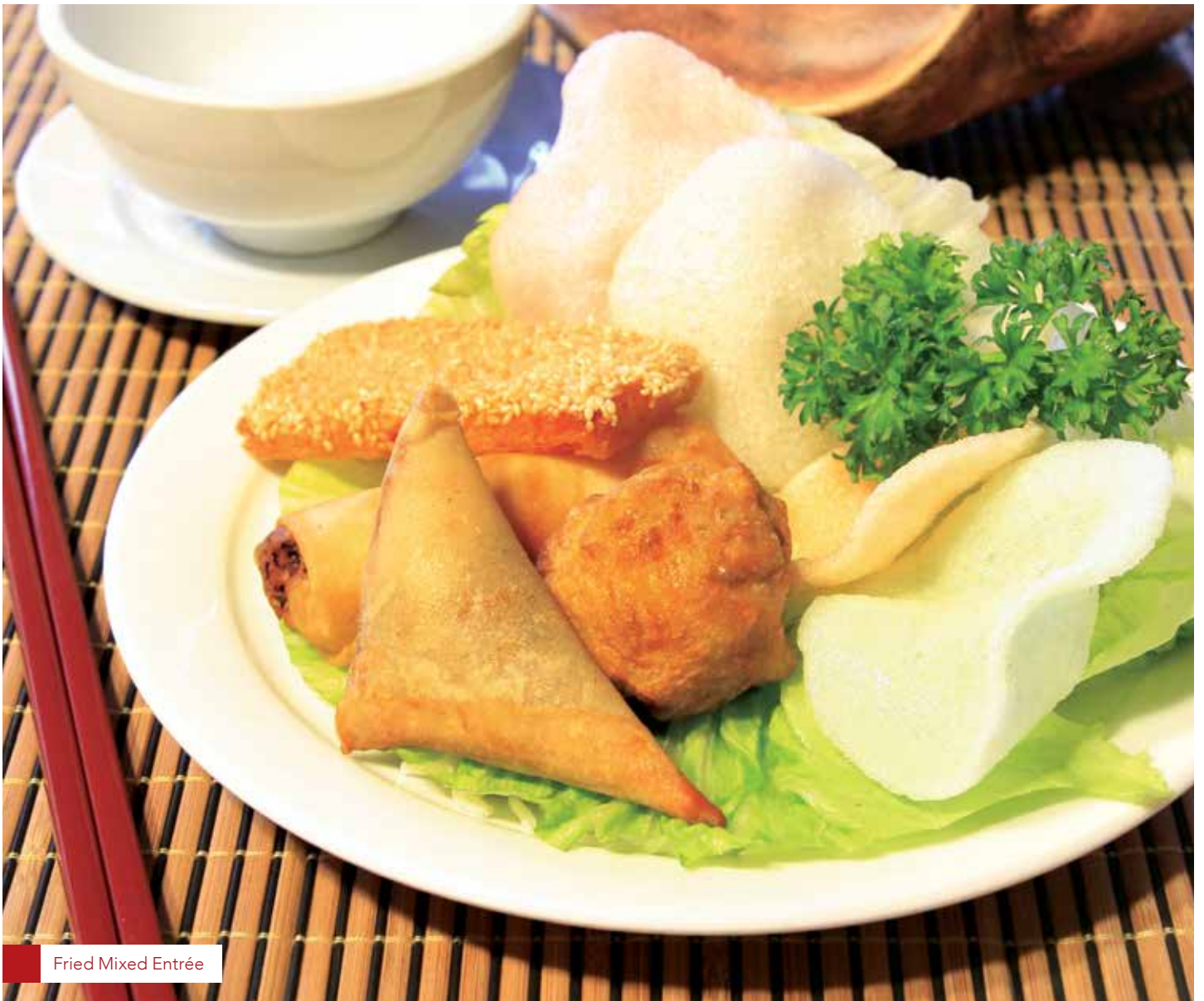
Fried Mixed Entrée