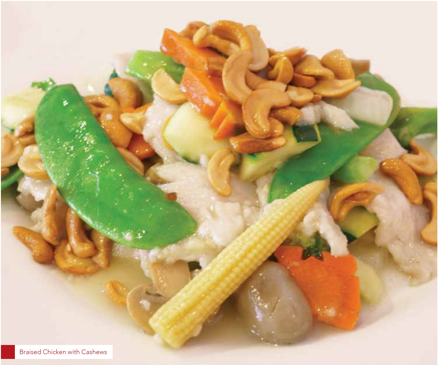
Braised Chicken with Cashews