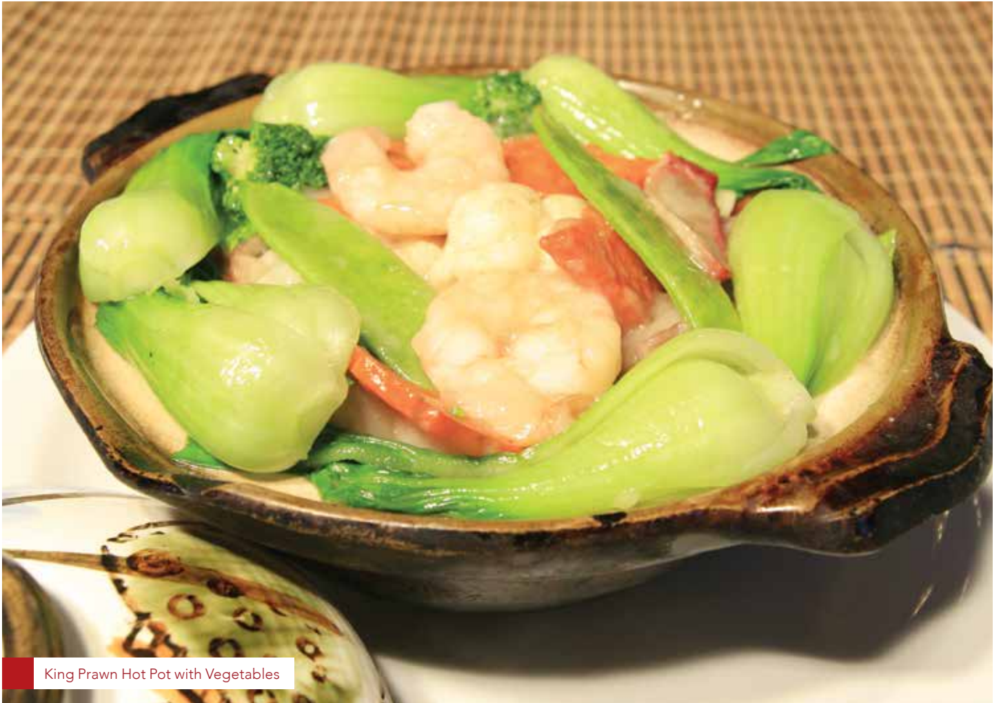
King Prawn Hot Pot with Vegetables