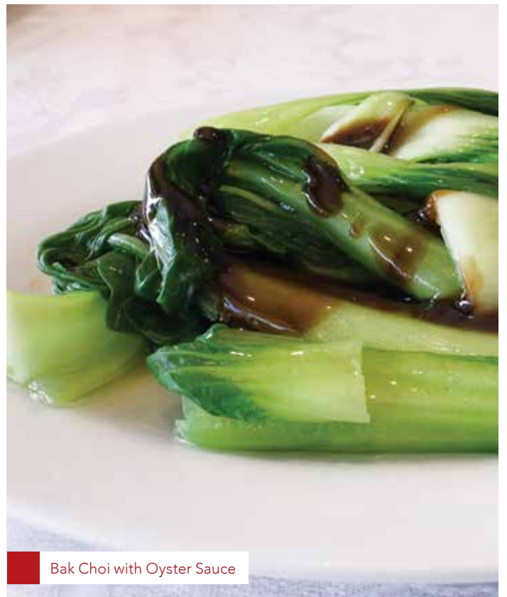
Bak Choi with Oyster Sauce