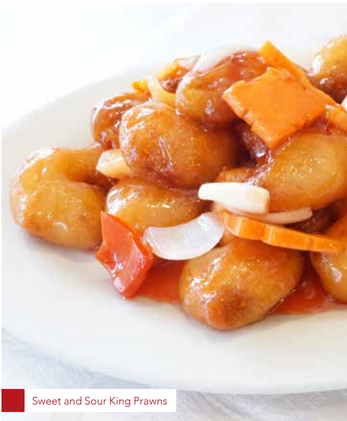
Sweet and Sour King Prawns