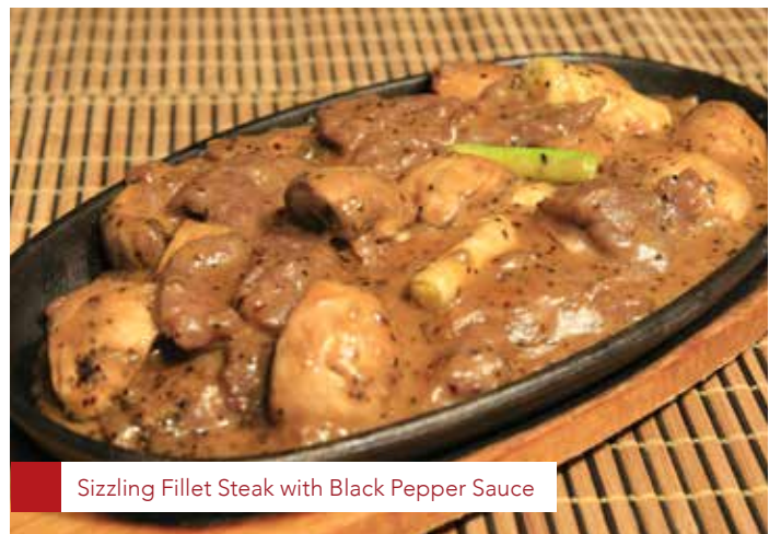
Sizzling Fillet Steak with Black Pepper Sauce