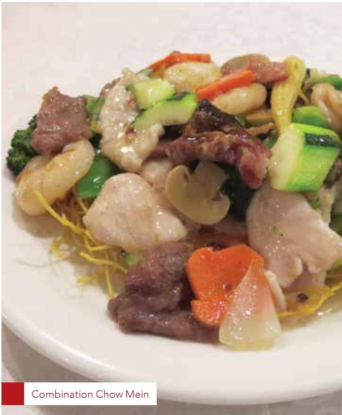
Combination Chow Mein