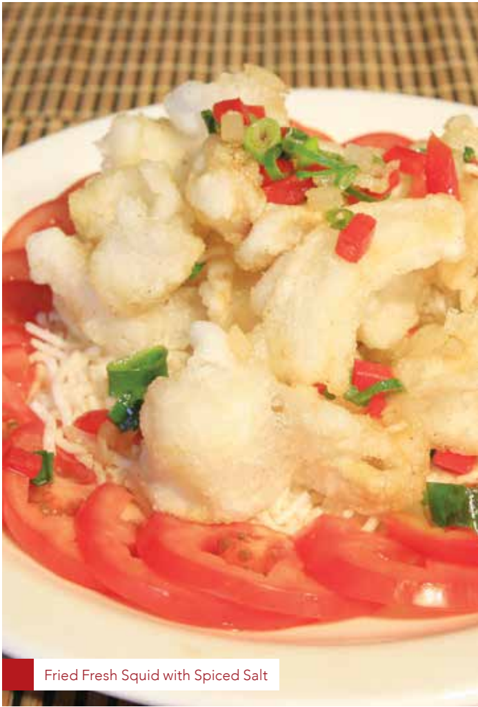
Fried Fresh Squid with Spiced Salt