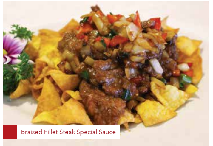
Braised Fillet Steak Special Sauce