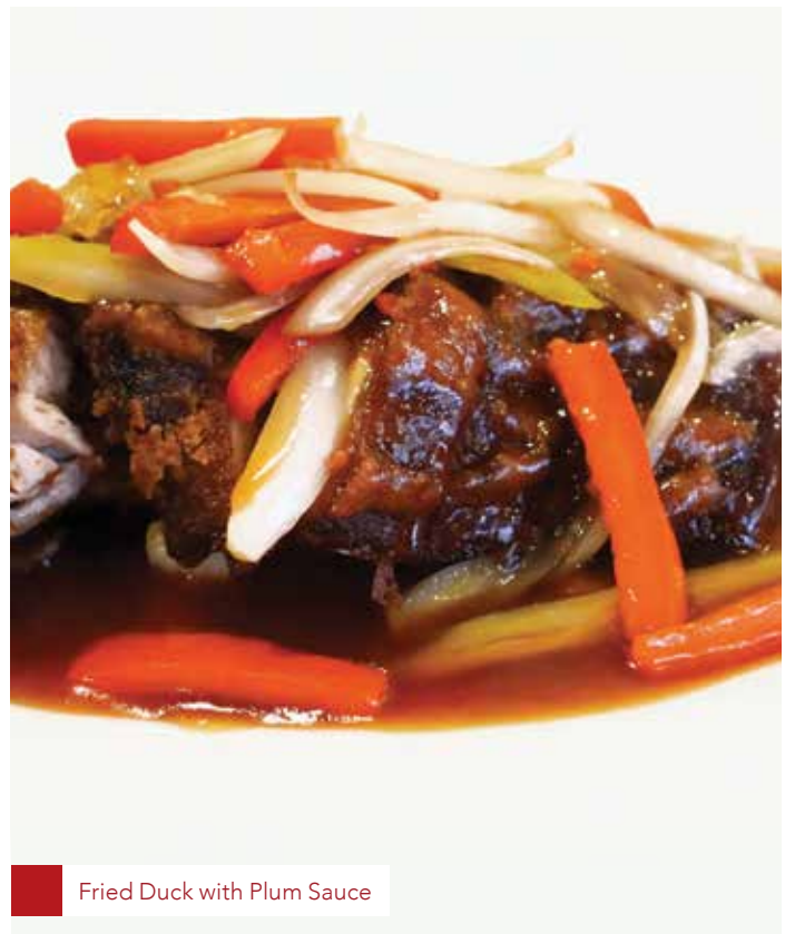
Fried Duck with Plum Sauce