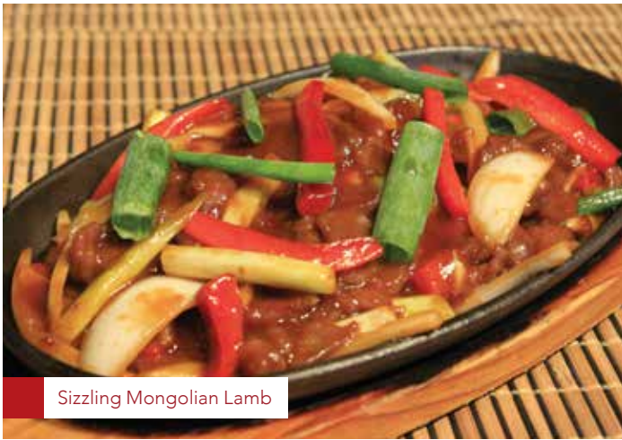
Sizzling Mongolian Lamb