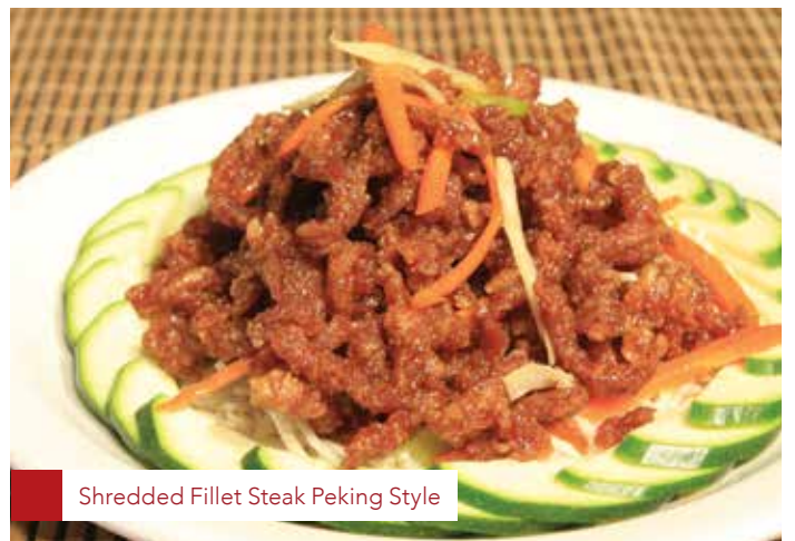
Shredded Fillet Steak Peking Style