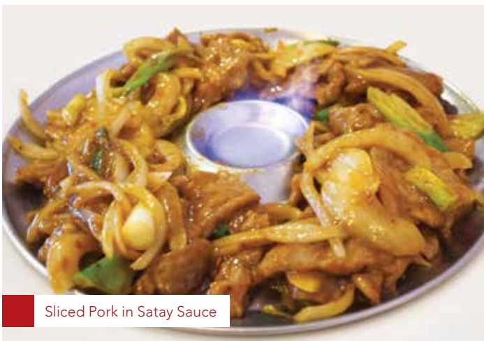
Sliced Pork in Satay Sauce