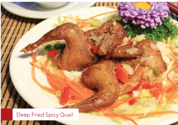
Deep Fried Spicy Quail