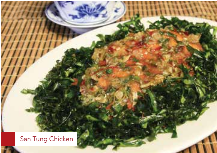
San Tung Chicken