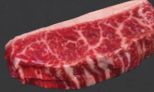
Top Sirloin イチボ