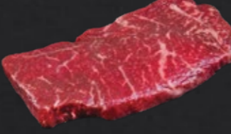
Premium Rump ランプ