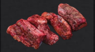
Rib Finger 中落ちカルビ