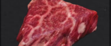
Tri Tip ヒウチ