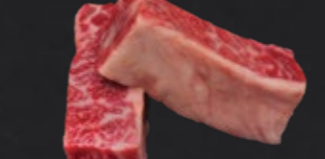
Chuck Short Rib 三角バラ