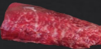
Teres Major ウワミスジ