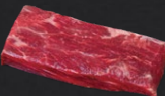
Pope's Eye ネクタイ