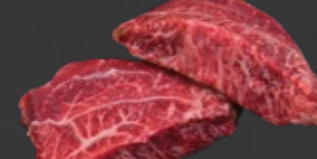
Flat Iron ミスジ