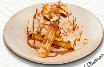
Banana Loaded Churros

Choose from: Banana, Vanilla ice cream and Dulce de Leche; Raspberry Ripple ice cream, Raspberries and Cream; or Chocolate Brownie chunks, Vanilla ice cream, Chocolate Sauce, Strawberries and Cream