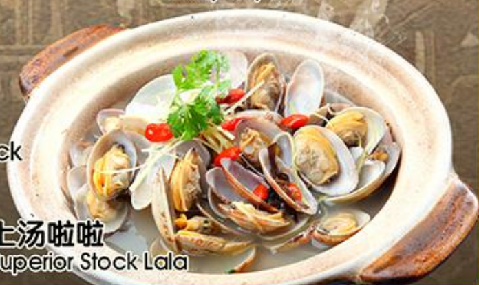
上汤啦啦 Superior Stock Lala