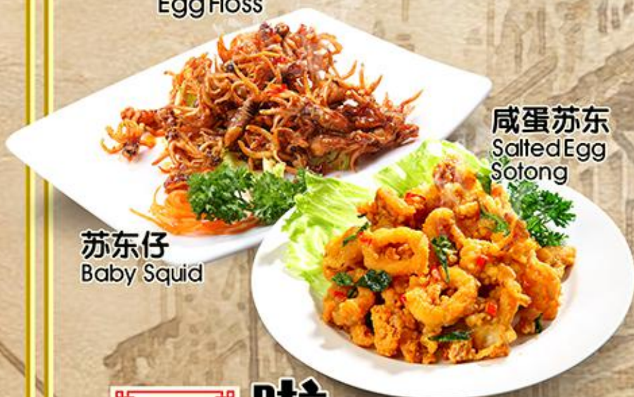
苏东仔 Baby Squid