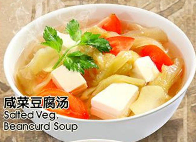
咸菜豆腐汤 Salted Veg. Beancurd Soup