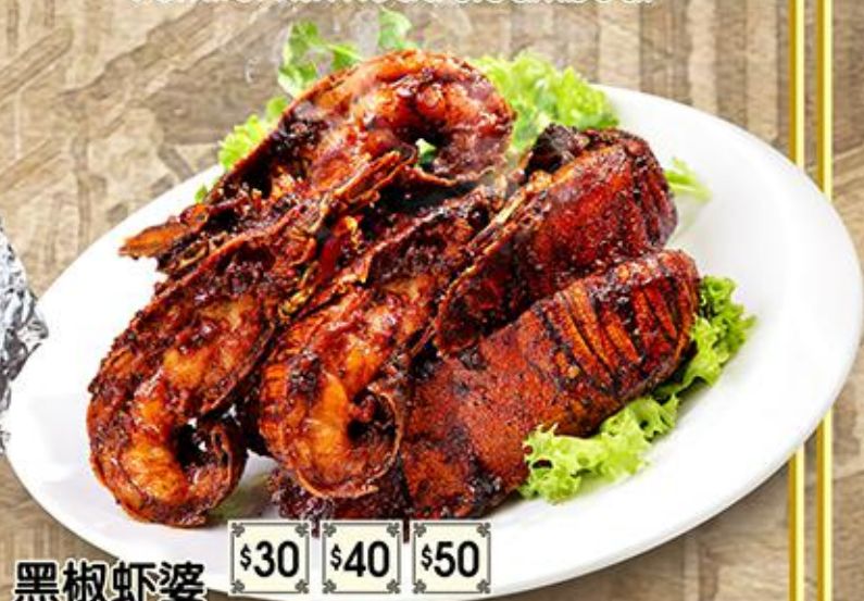
黑椒虾婆 $30 $40 $50 Black Pepper Crayfish