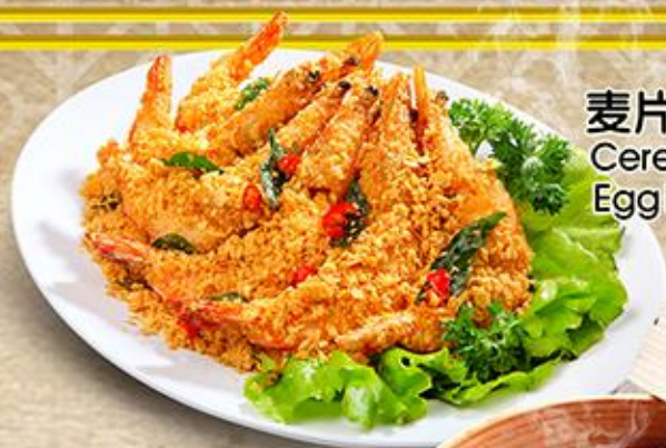
麦片蛋丝虾 Cereal Prawn w/ Egg Floss