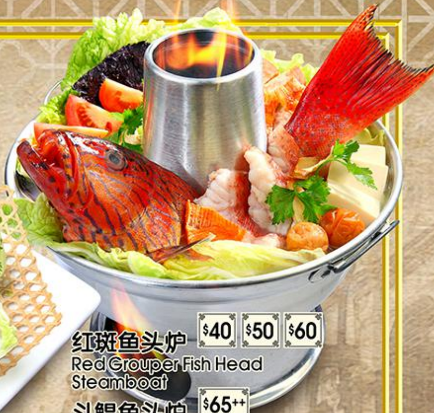
红斑鱼头炉 $40 $50 $60 Red Grouper Fish Head Steamboat