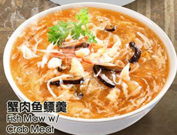
蟹肉鱼鳔羹 Fish Maw w/ Crab Meat