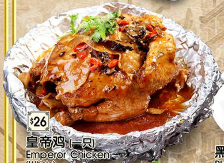
$26 皇帝鸡 (一只) Emperor Chicken (Whole)