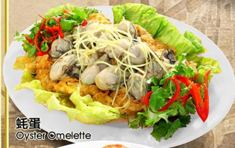
蚝蛋 Oyster Omelette