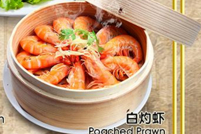
白灼虾 Poached Prawn