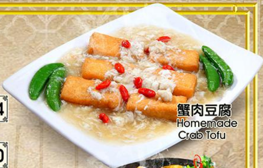
蟹肉豆腐 Homemade Crab Tofu