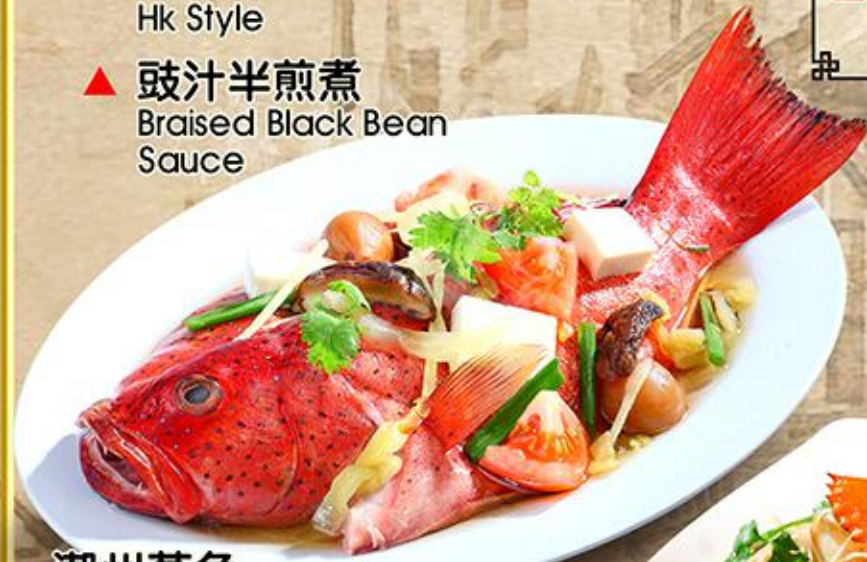
潮州蒸鱼 Teochew Style Steamed Fish