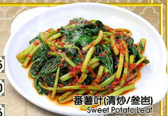
番薯叶(清炒/叁岬) Sweet Potato Leaf (Stir-Fried/ Sambal)