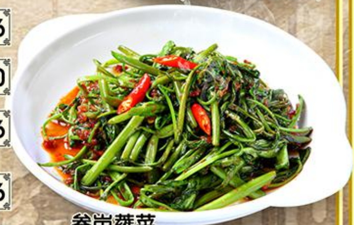
叁岬蕪菜 Sambal Kang Kong