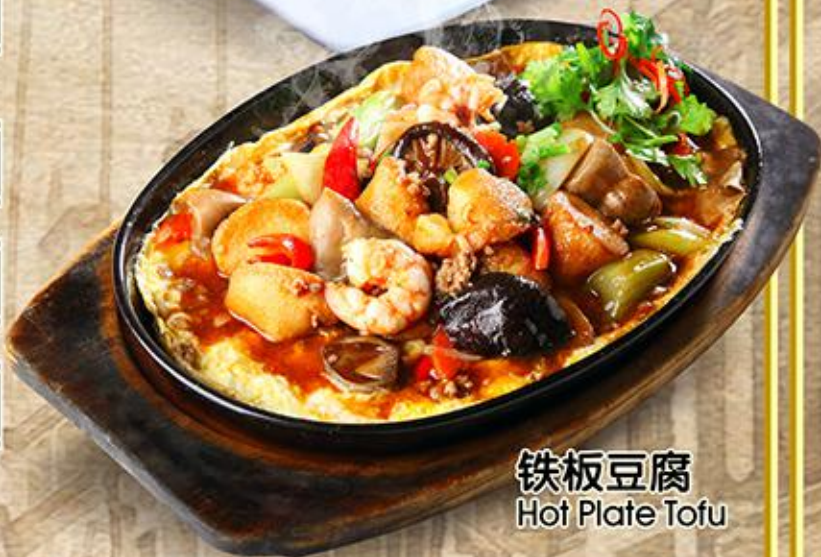
铁板豆腐 Hot Plate Tofu