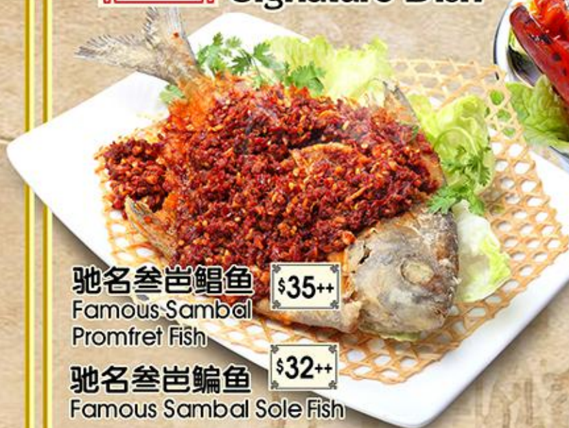
驰名叁岙鲳鱼 $35++ Famous Sambal Promfret Fish