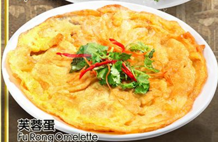
芙蓉蛋 Fu Rong Omelette