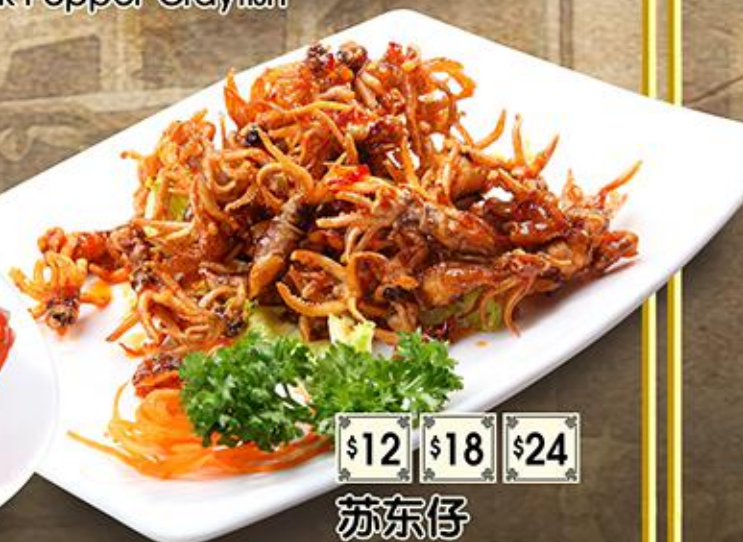
$12 $18 $24 苏东仔 Baby Squid

• 图片只供参考 Food picture are for reference only.