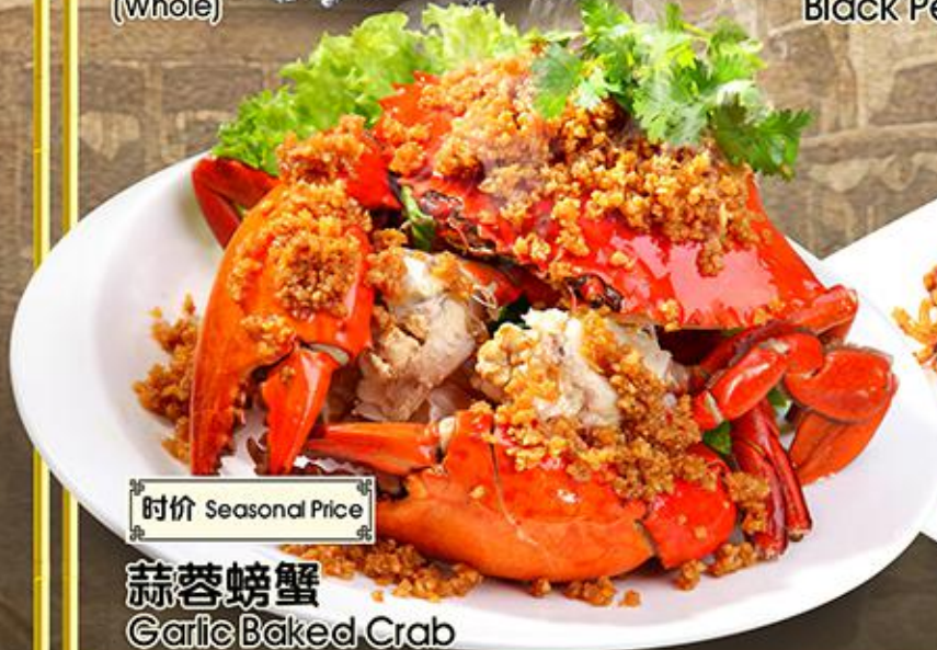
时价 Seasonal Price 蒜蓉螃蟹 Garlic Baked Crab