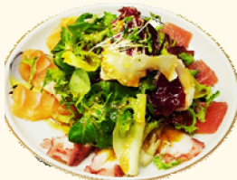
5 Sashimi Salad