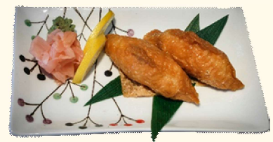
6 Tofu pouch Nigiri

Pictures may differ from original foods, a discretionary 10% service charge will be added to your bill.