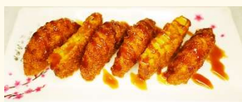
14 Pumpkin Korokke