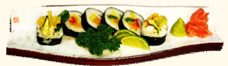
6 Vegetable Tempura Roll

Pictures may different from original foods, a discretionary 10% service charge will be added to your bill.