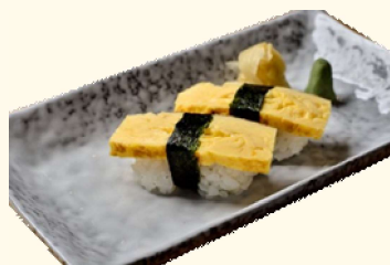
5 Egg Nigiri