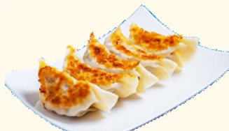
6 Chicken Gyoza