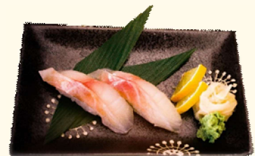
3 Seabass Nigiri