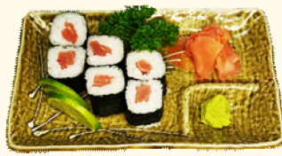
2 Tuna Hosomaki