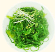
4 Seaweed Salad