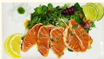
22 Salmon Tataki