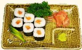
1 Salmon Hosomaki