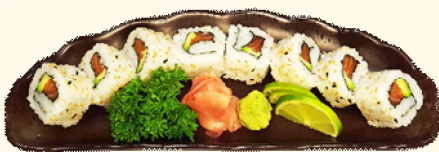
1 Salmon & Avocado Uramaki