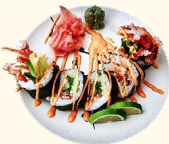
4 Spider Roll