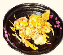
17 Crunch Soft Shell Crab