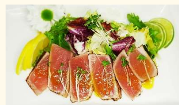
23 Tuna Tataki

Pictures may differ from original foods, a discretionary 10% service charge will be added to your bill.