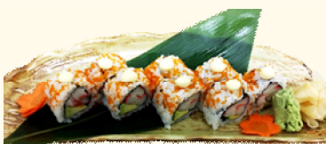
1 California Roll