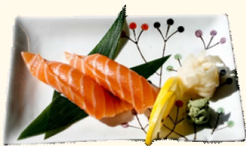
1 Salmon Nigiri