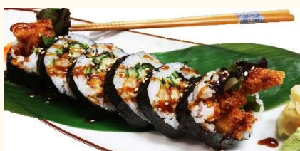
5 Chicken Katsu Roll