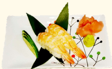
4 Prawn Nigiri