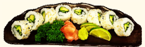
5 Cucumber & Avocado Uramaki

Pictures may differ from original foods, a discretionary 10% service charge will be added to your bill.