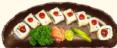
2 Salmon & Avocado (Spicy) Uramaki