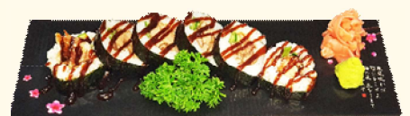
3 Duck Roll