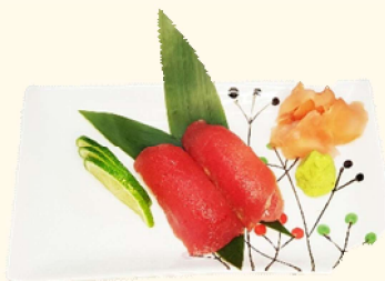
2 Tuna Nigiri