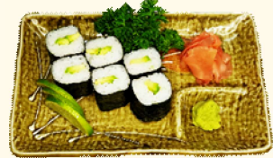
4 Avocado Hosomaki