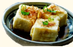
3 Agedashi Tofu