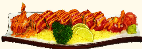
2 Prawn Tempura Roll