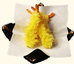
20 King Prawn Tempura