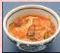
カルビスープ Beef Rib Soup 15.0