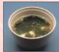
わかめスープ Seaweed Soup 3.0