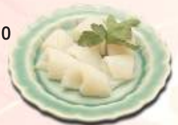
いかの刺身 Squid Sashimi 10.0 (6 pieces)