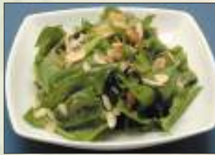
ほうれん草とアーモンドのサラダ Spinach & Almond Salad 13.0 Tuna flake & sliced onions. (soy dressing)