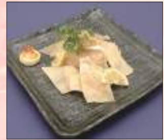
エイひれのあぶり焼き Dried Ray Wings