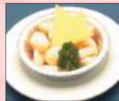
にんにくのバター焼き Garlic with Butter 4.5