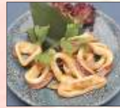
いか Calamari 9.9