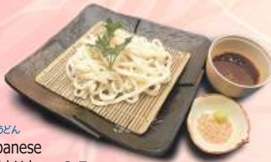
ざるうどん Japanese Cold Udon 9.5