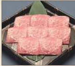
塩上タン Original Sliced OX Tongue 16.0 Served with salt & pepper.