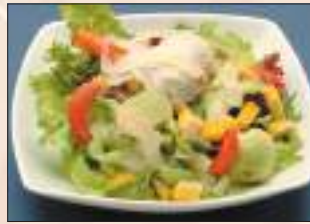
アボガド&ミックスグリーンサラダ Avocado & Mix Green Salad 13.0 (french dressing)