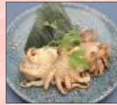
たこ Octopus 9.9