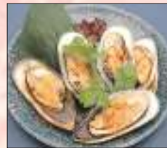
ムール貝 Mussel (5pieces) 12.0