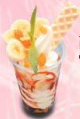
バナナとチョコレートのサンデー Fresh Banana & Chocolate Sundae 7.5