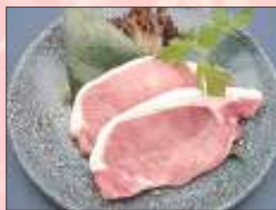
豚ロース Pork Loin 12.5 Salt or BBQ sauce