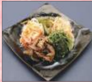
ナムルの盛り合せ Namuru Marinated vegetable.