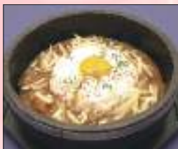
石焼き チーズカレー Stone Pot 16.0 Beef Cheese Curry Curry with beef, veges, egg & cheese on rice.