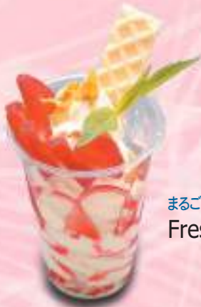
まるごといちごのサンデー Fresh Strawberry Sundae 7.5