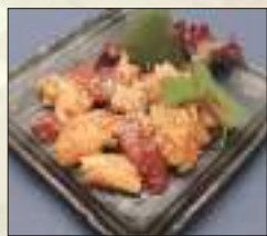
牛ホルモンミックス Assorted Beef Intestine 16.0 Please choose : Salt, Miso sauce or Miso chilli sauce