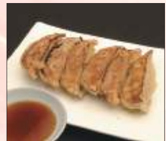
揚げ餃子 / たこ焼き Gyoza / Takoyaki (6 pieces) (8 pieces)