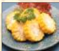
とうもろこし Corn on the cob 4.9