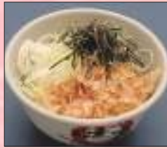
ねぎ ごはん Negi Rice 8.6 Chopped leeks, S 5.5 dried bonito flakes and dried seaweed on rice.