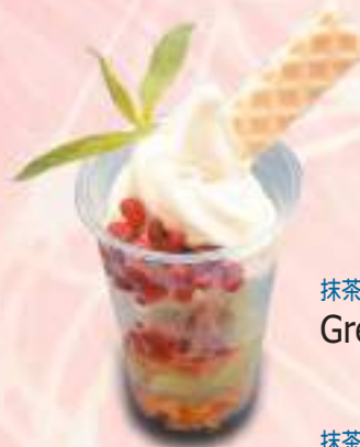
抹茶アイスのサンデー Green Tea Icecream Sundae 7.5