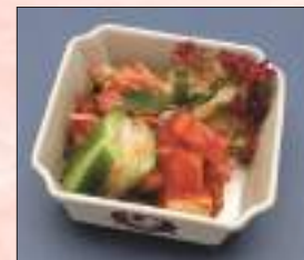
キムチの3種盛り合せ Assorted Kimchee