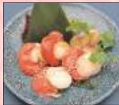
ホタテ Scallop (5pieces) 16.0