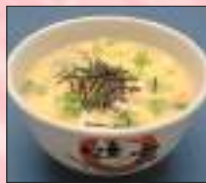
たまごクッパ Egg Porridge 10.0