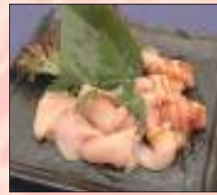
皮なし鶏の胸肉 Chicken Breast 9.9 Salt or BBQ sauce.