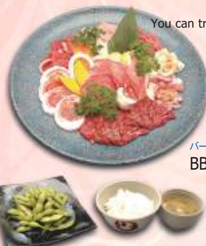
バーベキュープラッター セット BBQ Platter Set

Ideal choice for Yakiniku with your friends or family. You can try many kinds of BBQ meat on one plate.