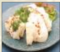
キャベツ Cabbage 4.9