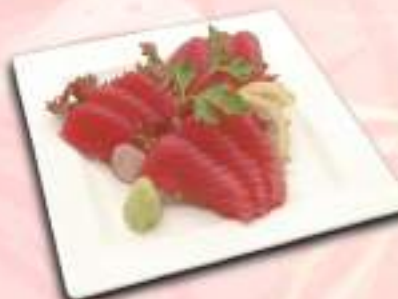
まぐろの刺身 Tuna Sashimi S 6 pieces 14.9 L 12 pieces 22.0