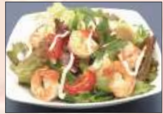
海老のカクテルサラ Prawn & Avocado Salad 14.0 (wasabi mayonnaise dressing)