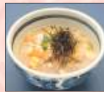
たまごスープ Egg Soup 8.5