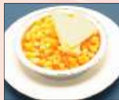
コーンのバター焼き Corn with Butter 4.5