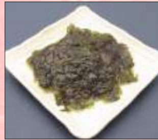
韓国のり Dried Korean Seaweed Sheets