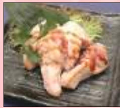
鶏の手羽先 Chicken Wings (4pieces) 8.5 Salt or BBQ sauce.