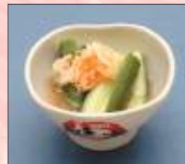
オイキムチ Cucumber Kimchee