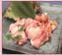
皮付き鶏のもも肉 Chicken Thigh with skin 9.9 Salt or BBQ or Spicy sauce.