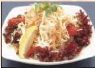
千切りキャベツのサラダ Fluffy Cabbage Salad 10.0 (mayonnaise & BBQ sauce dressing)