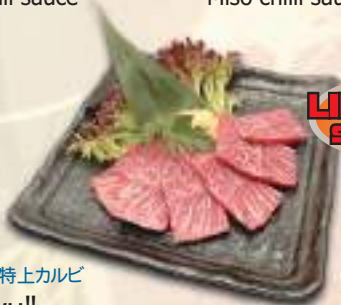
特選 和牛特上カルビ "Wagyu" Premium Beef Rib 28.0 Please choose : Salt & pepper or BBQ sauce