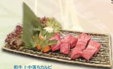
和牛上中落ちカルビ "Wagyu" Special Beef Rib Finger 19.0 Please choose : Salt & pepper or BBQ sauce