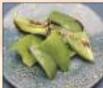
ピーマン Capsicum 4.9