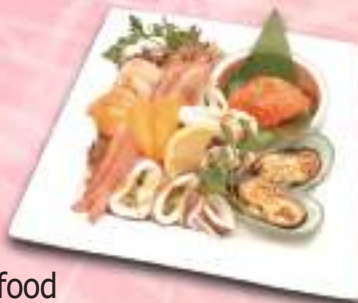
シーフード盛り合せ Assorted Seafood

S 2 prawns, 2 scallops, calamari, octopus, 2 mussels & fish. 24.5