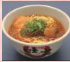
カルビラーメン Beef Rib Ramen Udon noodles 17.0 in hot and spicy soup.