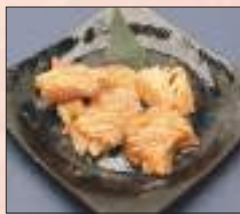
和牛 上ミノ Special Beef Tripe 9.9 Please choose : Salt, Miso sauce or Miso chilli sauce