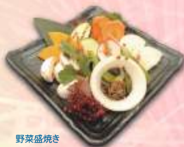
野菜盛焼き Assorted Seasonal Vegetables 13.5