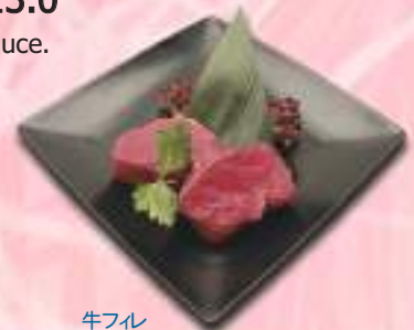
牛フィレ Beef Fillet 16.0 Served with BBQ sauce.