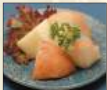
じゃがいも Potato 4.9