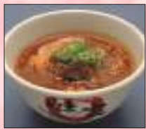
カルビクッパ Beef Rib Porridge 17.0 Rice in spicyhot soup.