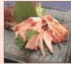
鶏の軟骨 / 砂肝 Chicken Soft Bone 8.5 Chicken Gib 8.0 Salt or BBQ sauce.