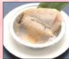
白身魚のバター焼き Fish with Butter 5.0