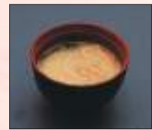
味噌汁 Miso Soup 3.0