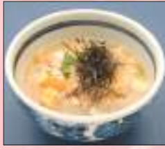
たまごうどん Egg Udon Udon noodles 12.0 and egg in hot soup.