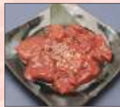
牛レバー Beef Liver 8.5 Please choose : Salt, Miso sauce or Miso chilli sauce