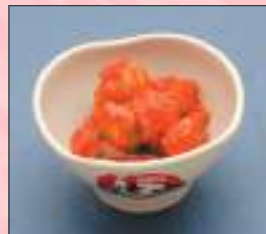
カクテキ Radish Kimchee