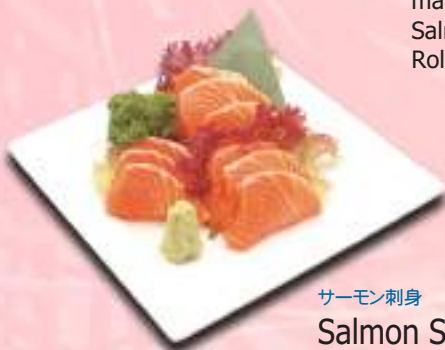
サーモン刺身 Salmon Sashimi S 6 pieces 14.0 L 12 pieces 22.0