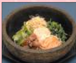
石焼き ビビンバ Stone Pot 15.0 Bibimba (with Soup) Veges, egg, beef mince & dried seaweed on rice.