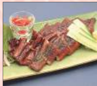
うなぎの蒲焼き Eel with Teriyaki sauce