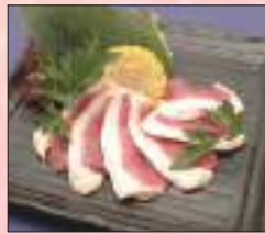
上合鴨 Duck 15.5 Salt or BBQ sauce.