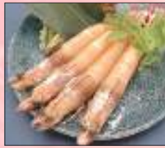
有頭えび Prawn (6pieces) 18.0

L 4 prawns, 4 scallops, calamari, octopus, 4 mussels & fish. 43.5