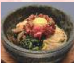
石焼き ユッケビビンバ Stone Pot 18.0 Beef Tartar Bibimba (with Soup) Veges, egg, yukke & dried seaweed on rice.