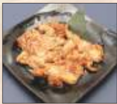
和牛 上ホルモン "Wagyu" Special Beef Intestine 9.9 Please choose : Salt, Miso sauce or Miso chilli sauce