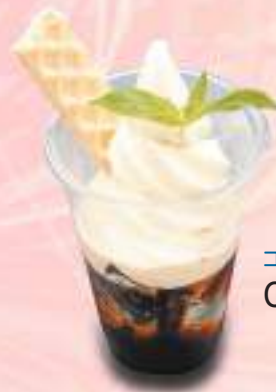
コーヒーゼリーサンデー Coffee Jelly Sundae 7.5