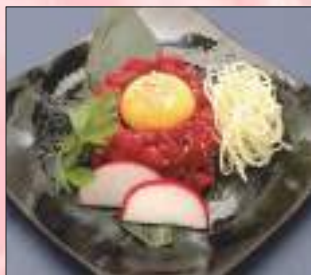
ユッケ Yukke Raw beef tartar with egg york.