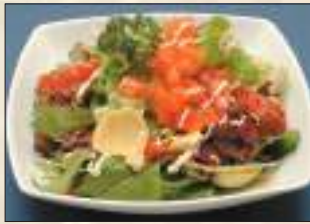
サーモンとアボカドのサラダ Salmon & Avocado Salad 15.0 (french dressing & mayonnaise)