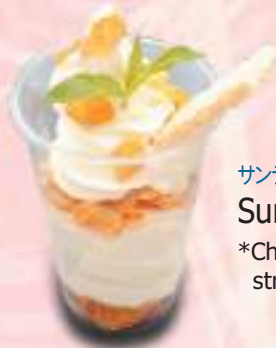
サンデー Sundae 6.5 *Choice of choc or strawberry sauce or plain