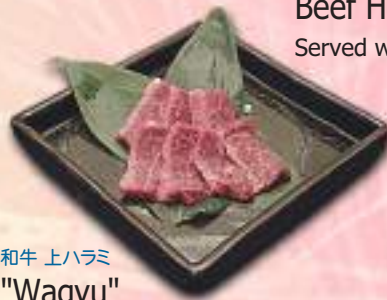
和牛 上ハラミ "Wagyu" Special Beef Harami 19.0 Part of the diaphragm muscle.