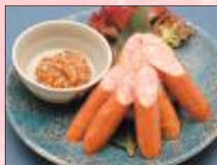
ポークソーセージ Pork Sausage 8.5