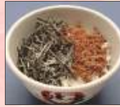
じゃこごはん Jako Rice 8.6 Soy flavored S 5.5 small white-bait on rice with dried seaweed.