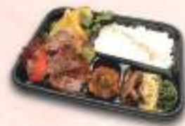
上カルビ弁当 "Wagyu" Beef rib Bento Box 23.0