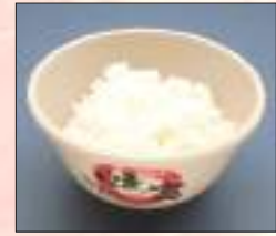
ごはん Rice S 2.2 R 2.8 L 3.5