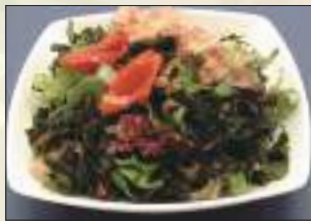
わかめサラダ Seaweed Salad 13.0 (soy dressing)