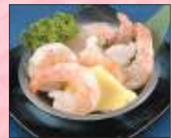
海老のにんにく焼き Garlic Prawns 6.5