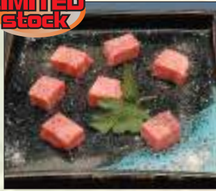
特選 特上サイコロ牛タン Premium Diced OX Tongue 18.0 Juicy and tender.