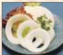
玉ねぎ Onions 4.9