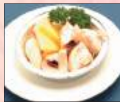
マッシュルームのバター焼き Mushroom with Butter 4.5