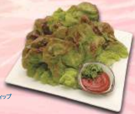
包み野菜と自家製味噌ディップ Wrap up Sunny Lettuce & Miso Dip 8.0