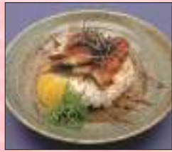
うなぎ ごはん Eel on Rice 20.0