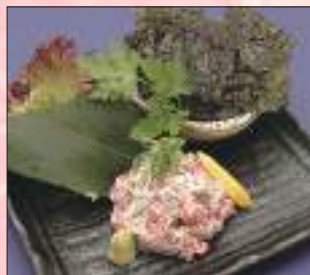
牛 or サーモンのねぎとろ巻 Finger Roll Beef or Salmon Sashimi Raw beef marinated with mayo & shallot or Salmon sashimi. Roll it up with dried seaweed.