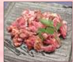
牛タンもと Under Tongue 10.0 Please choose : Salt or BBQ sauce