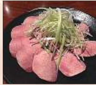
ねぎ塩上タン Special Negi-shio Tongue 18.0 Served with salted flavor leek.