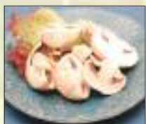
マッシュルーム Mushrooms 4.9