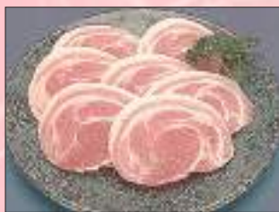
豚カルビ Pork Rib 13.5 Salt or BBQ sauce