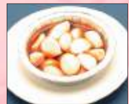
にんにくのごま油焼き Garlic in Sesame Oil 4.5