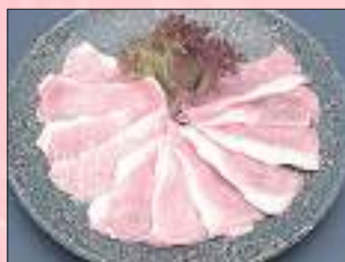
豚トロ Pork Neck 12.5 Salt or BBQ sauce