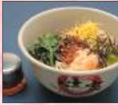
ビビンバ Bibimba (with Soup) Marinated veges & cooked beef on rice. 12.0