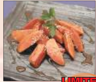
味噌牛タン Original Miso OX Tongue 18.0 Marinated with original miso souce.